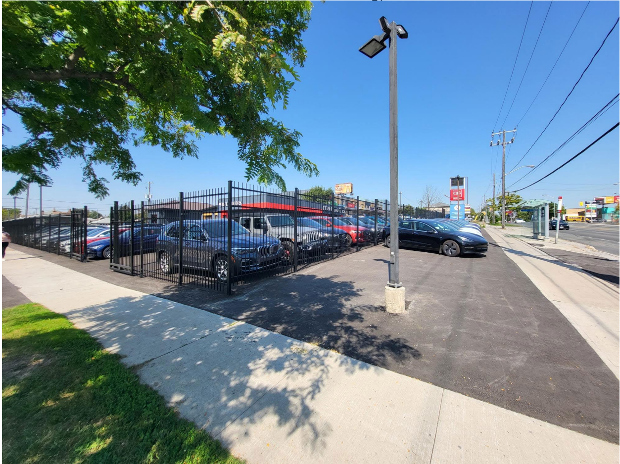
1. Street view - 3210 Weston (view is north facing)