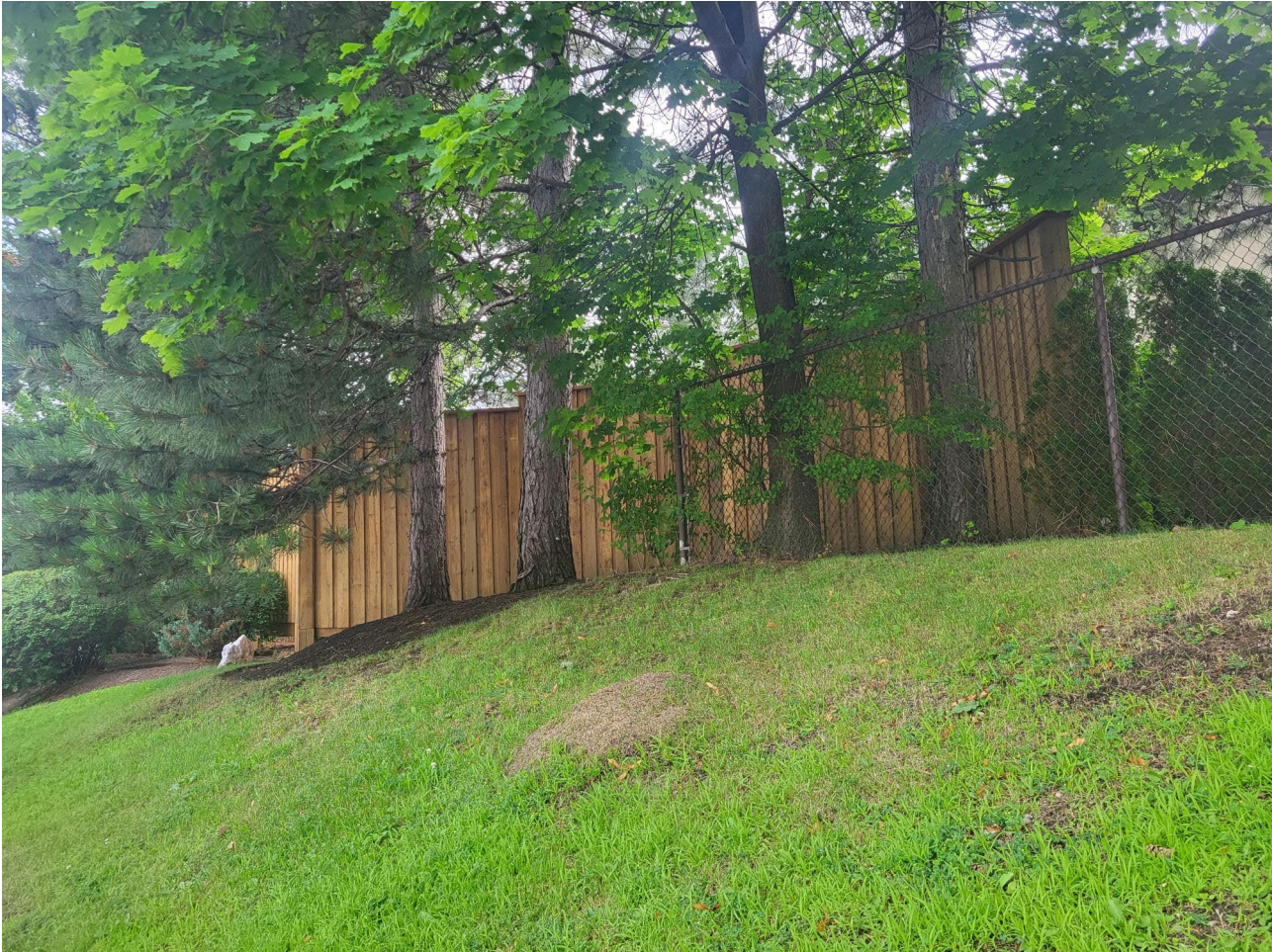
Attachment B: Officer's photo: Wooden fence off Royal York Road, front -West side of property.