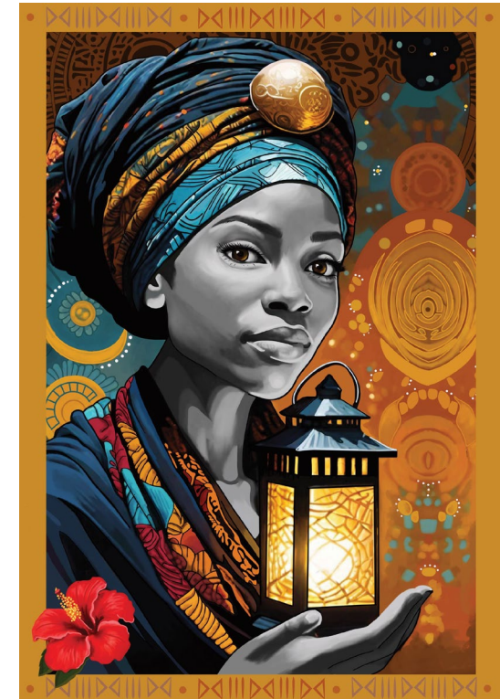
Artwork by Kanisha Dabreo (Artistic Perception), AstroSankofa Arts Initiatives, 2024.