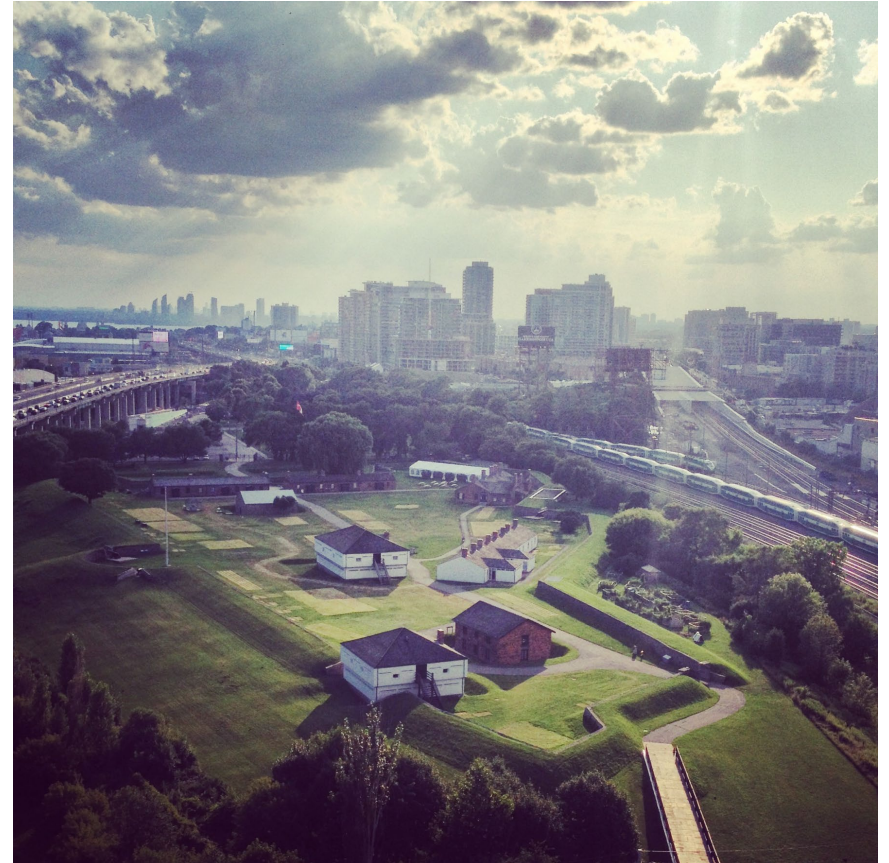
Fort York National Historic Site