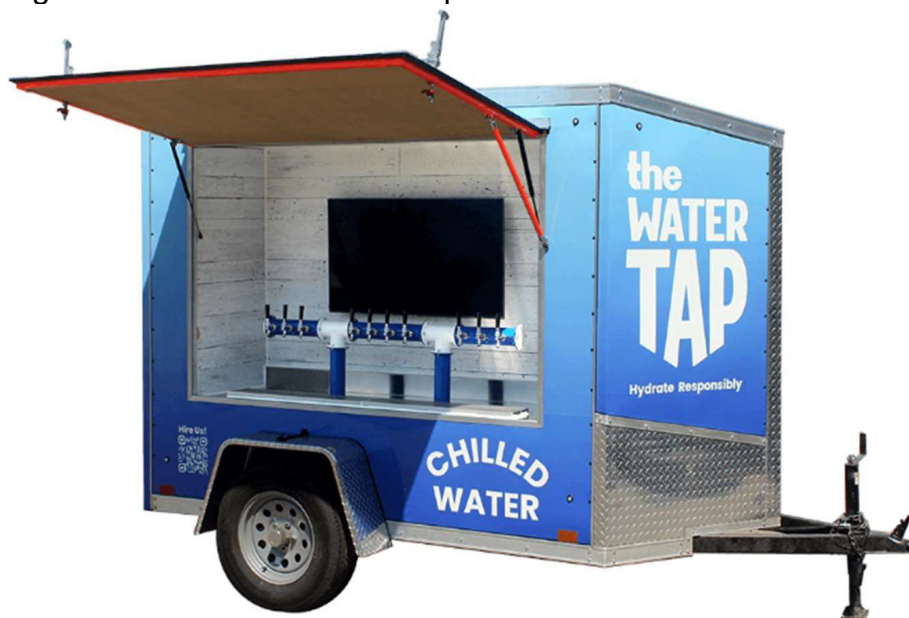
Figure 3: Stainless Steel 10 Tap Water Trailer

Lead times for trailer procurement are estimated at 12 to 18 months.