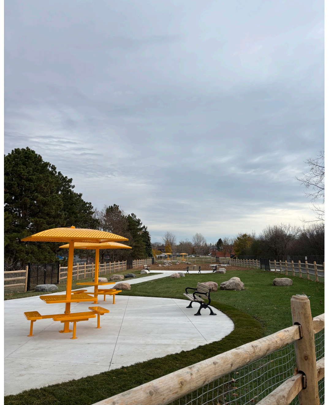
New OLA in Bob Hunter Park