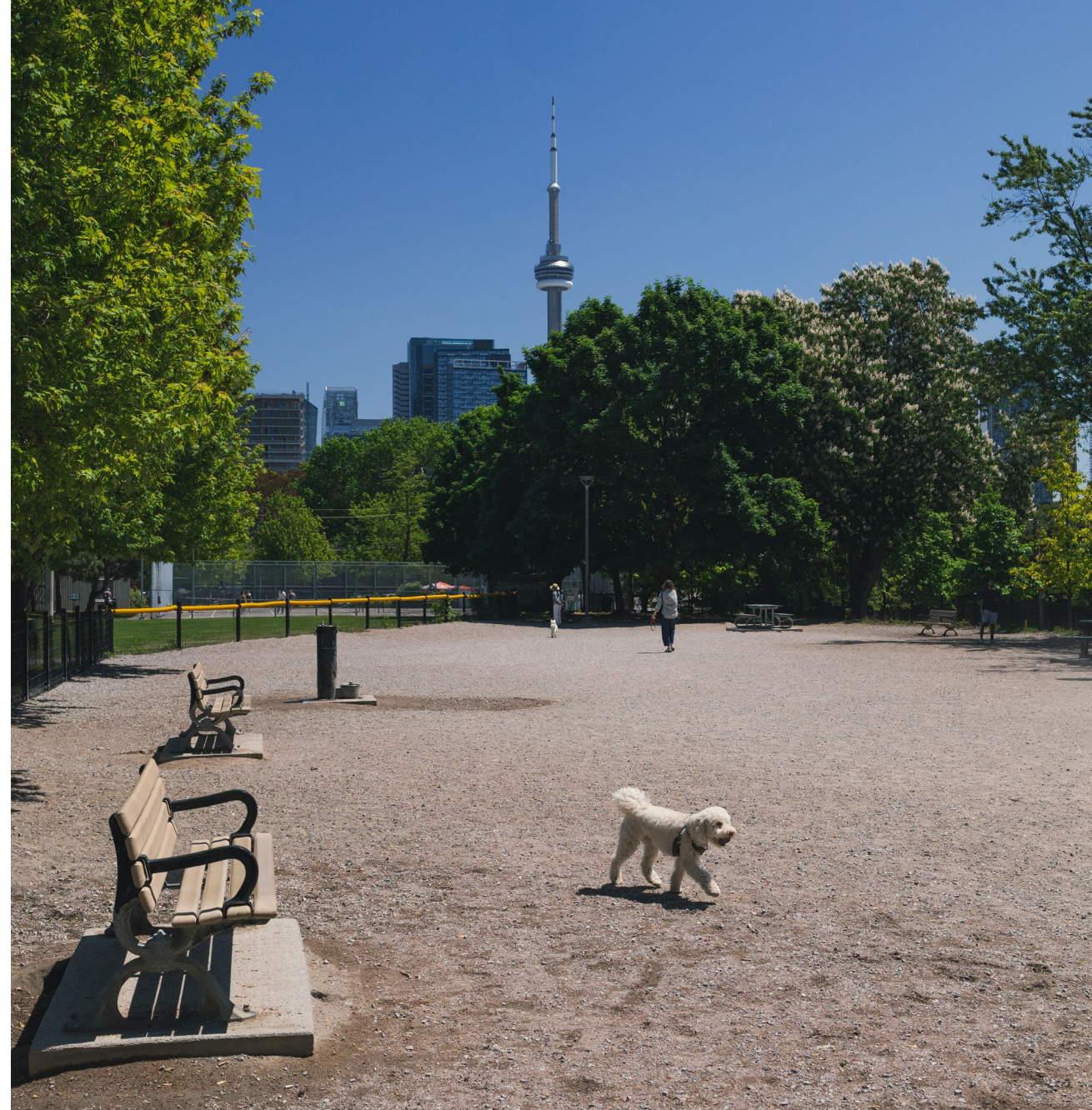
Off-leash area at Stanley Park South