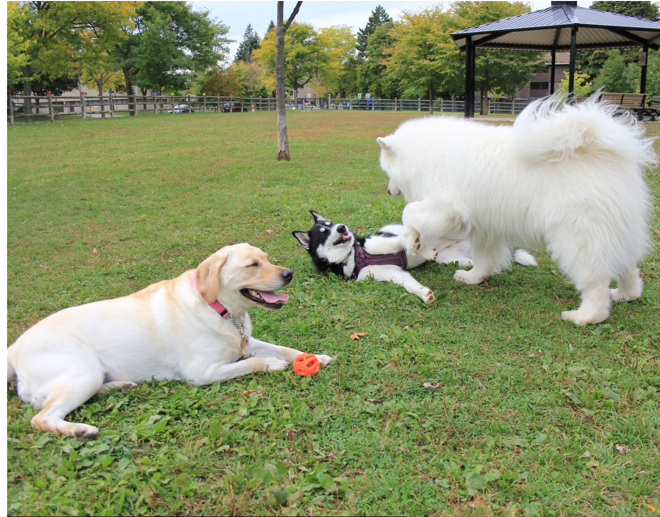
Off-leash areas at Botany Hill Park