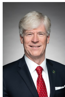
Hon. Tim Hodgson, P.C., M.P. Markham-Thornhill