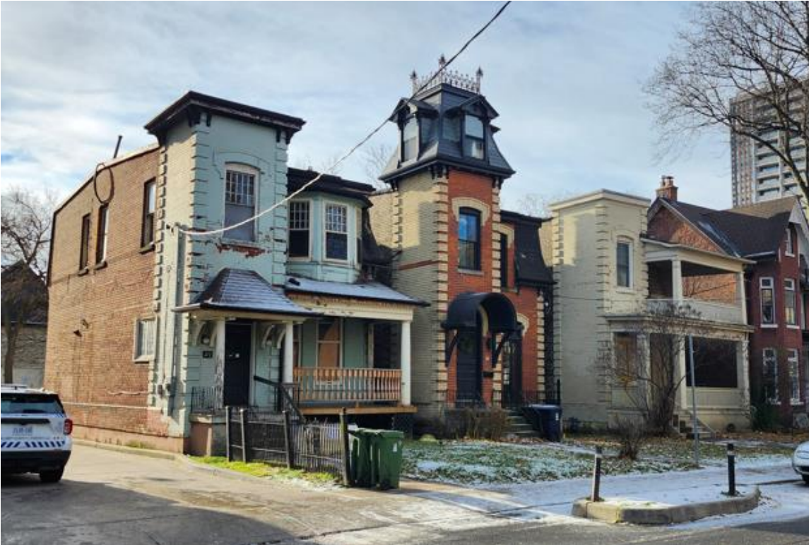
Detail of the principal (north) elevations of 29, 31 and 33 Sussex Avenue looking southwest