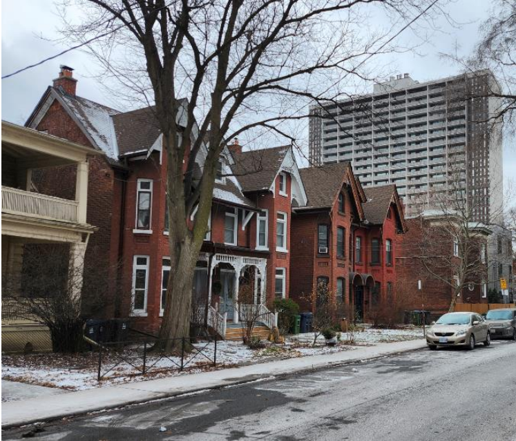
35-41 Sussex Avenue, houses on the south side showing the consistent scale, complex massing, and rich detailing of houses in the Huron-Sussex neighbourhood