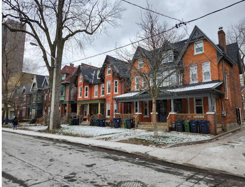
38-40 Sussex Avenue, north side