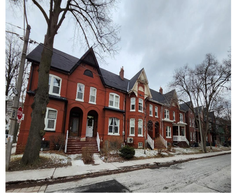
Sussex Avenue, north side, east of Huron Street