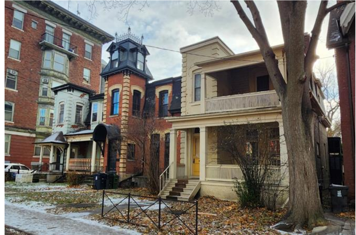
Detail of the principal (north) elevations of 29, 31 and 33 Sussex Avenue looking southeast