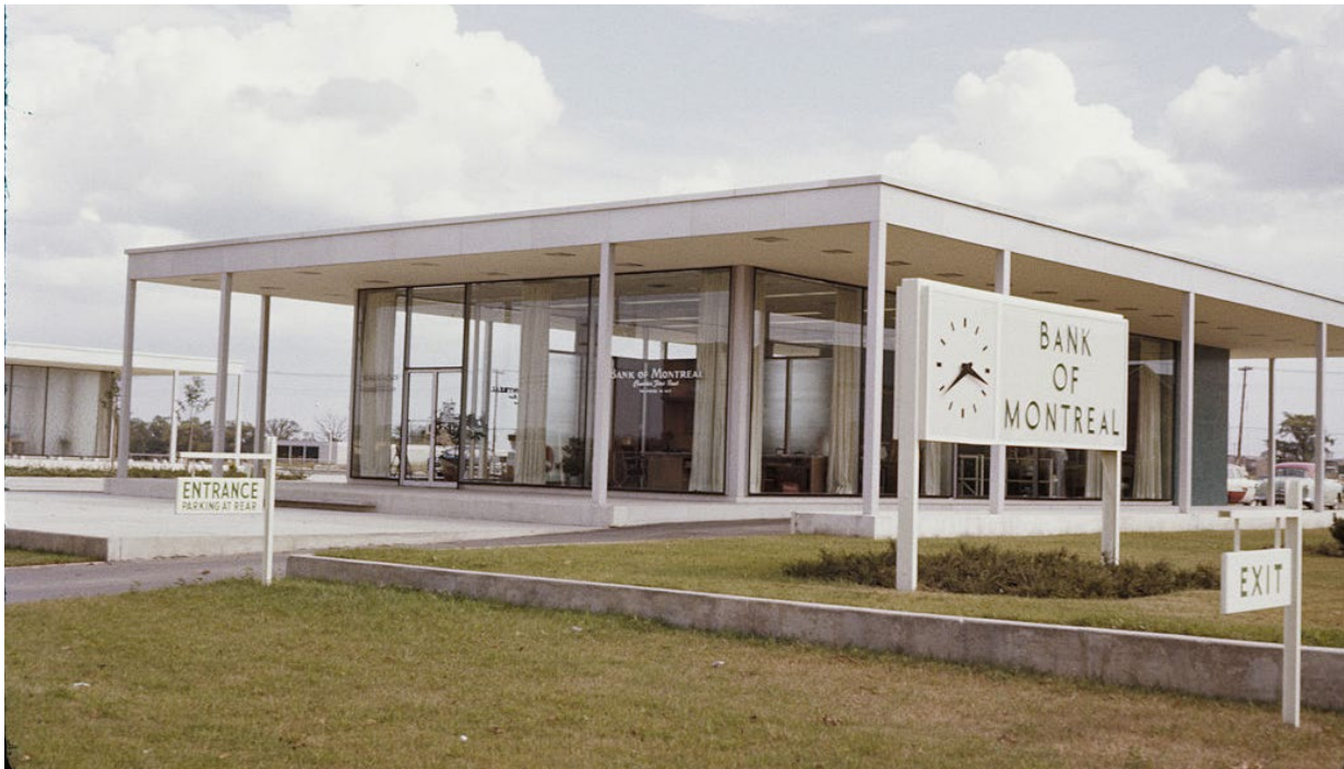
Figure 5 1957-1959 image looking southeast towards 877 Lawrence Avenue East. Note its 4-bay principal (north) elevation prior to the 1967 addition of one bays on its east elevation.