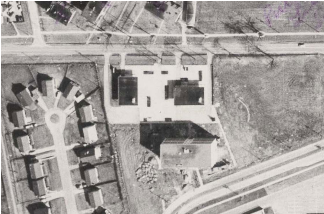
Figure 7 1959 aerial showing 877 (left) and 885 (right) Lawrence Avenue East with the large shared public plaza (Toronto Archives).