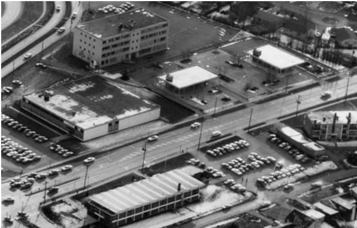
Figure 5 1965-1966 aerial image of Lawrence Avenue East looking southwest toward 877 (right) and 885 (left) Lawrence Avenue East.