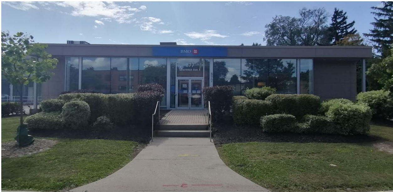
Principal (north) elevation of 877 Lawrence Avenue East (Heritage Planning, 2024).