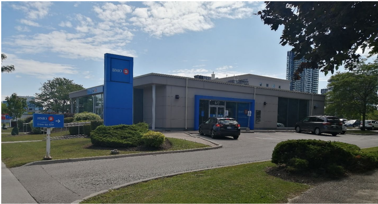
Figure 9 Image looking southeast toward the north and west elevations of 877 Lawrence Avenue East (Heritage Planning, 2024).