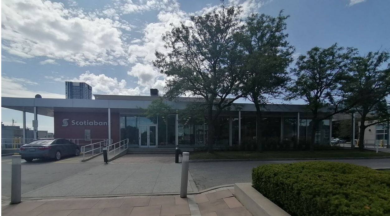
885 Lawrence Avenue East (Heritage Planning, 2024).