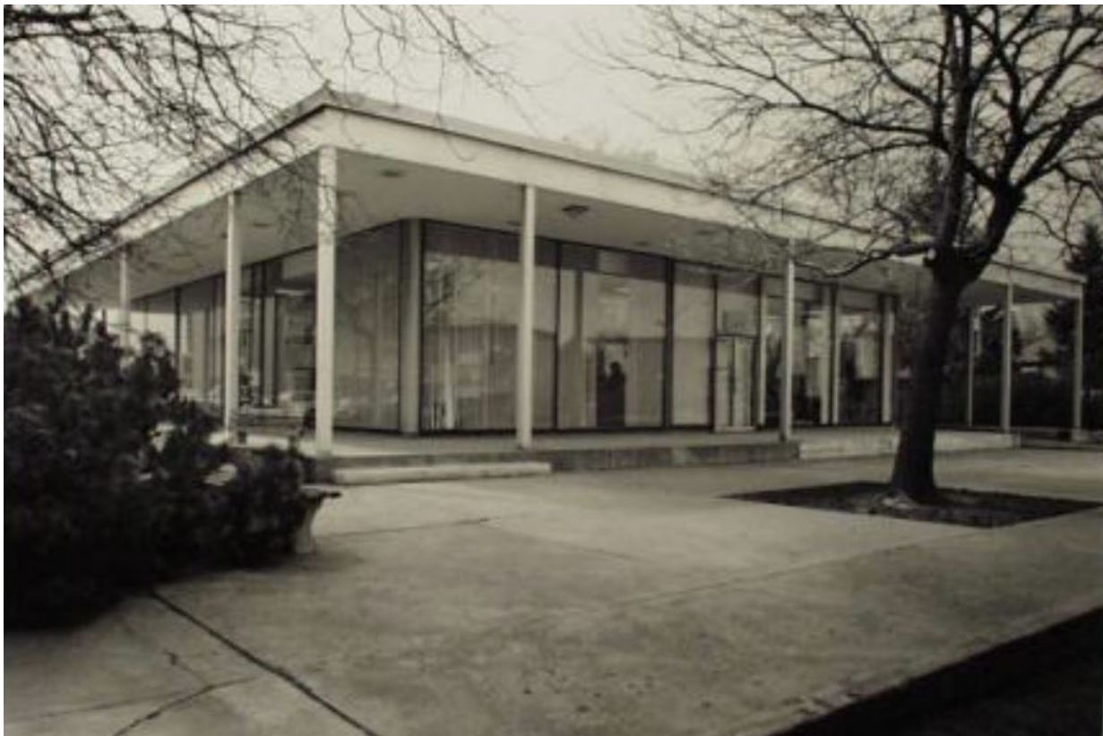
Figure 6 1989 image looking northwest towards 877 Lawrence Avenue East showing post-1967 five-bay principal (north) elevation (James Iska).