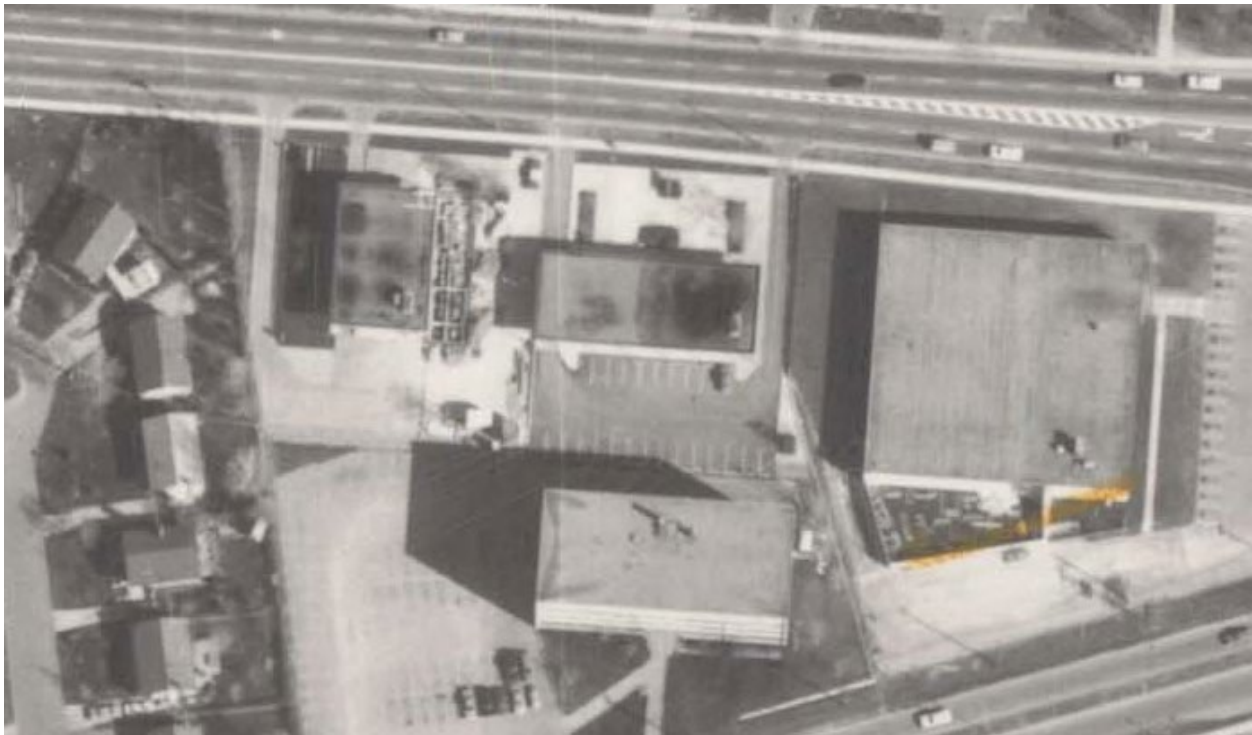
Figure 8 1967 aerial showing 877 Lawrence Avenue East (left) with its eastern addition under construction and 885 Lawrence Avenue East (right) with its recently completed western addition.