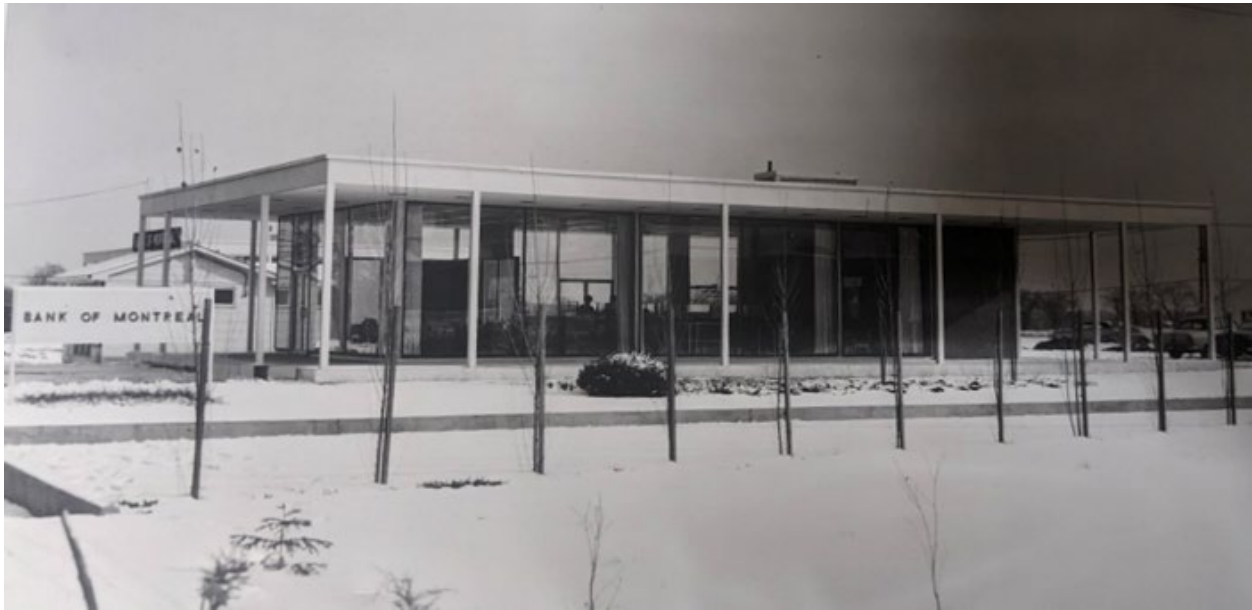
Figure 8 1956 image looking southeast towards the north and west elevations of recently completed 877 Lawrence Avenue East. Note the nearly all glass exterior walls and temporary "shack" in the background (University of Calgary Archives).