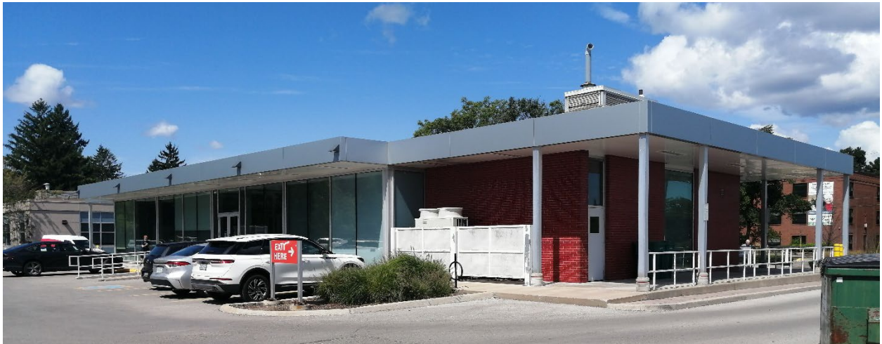
Figure15 Image looking northwest toward the south and east elevations of 885 Lawrence Avenue East.