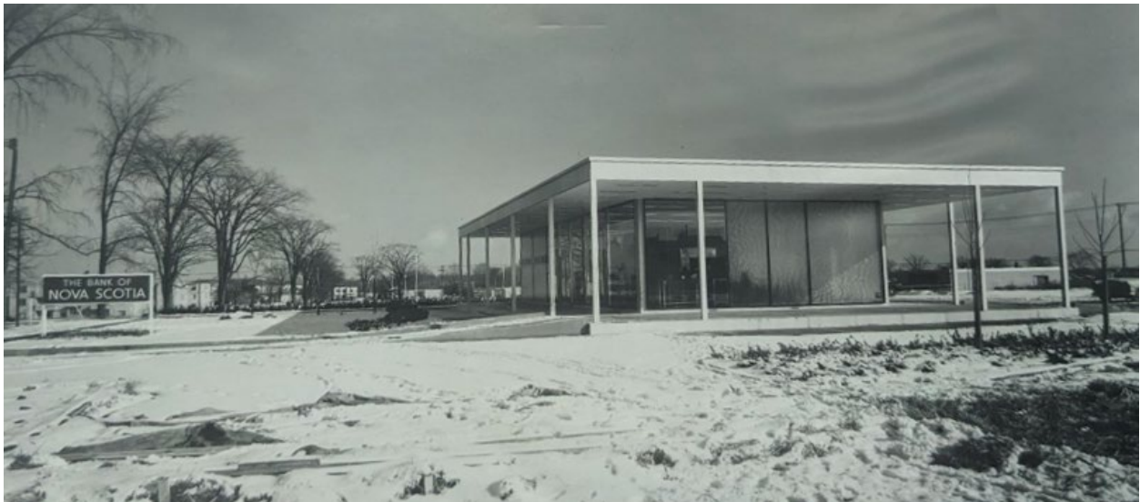
Figure 10 1956 image looking east towards the recently completed Bank of Nova Scotia at 885 Lawrence Avenue East.