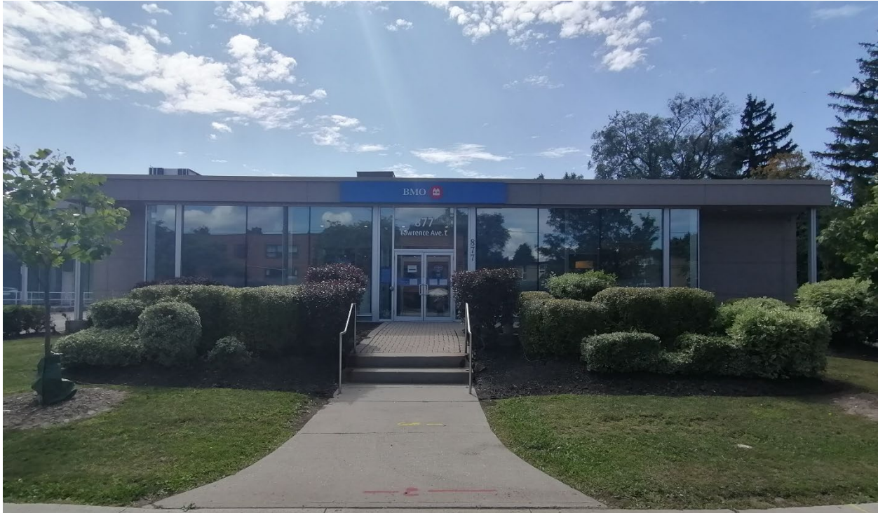
Figure 7 Image of principal elevation of 877 Lawrence Avenue East (Heritage Planning, 2024).