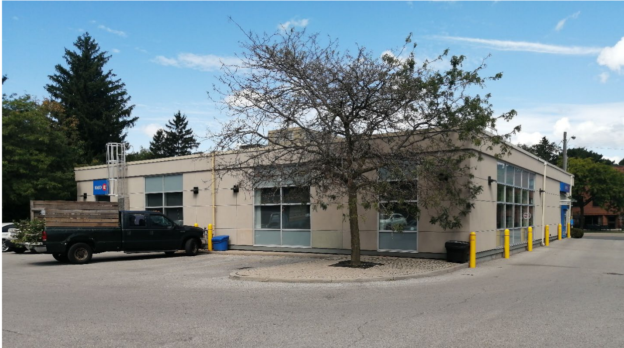
Figure 21 Image looking northwest toward the south and east elevations of 877 Lawrence Avenue East (Heritage Planning, 2024).