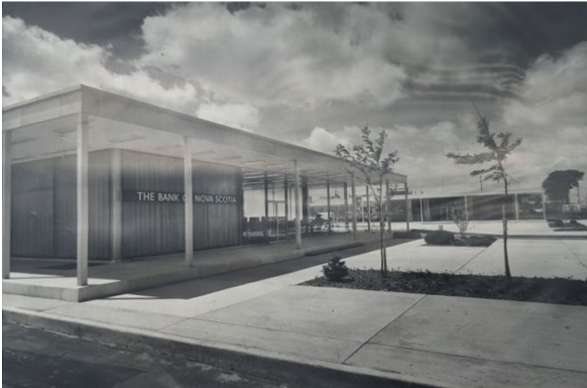
Figure 4 Late 1950s image showing nearly completed Bank of Nova Scotia in the foreground followed by the shared public plaza and Bank of Montreal in the background.