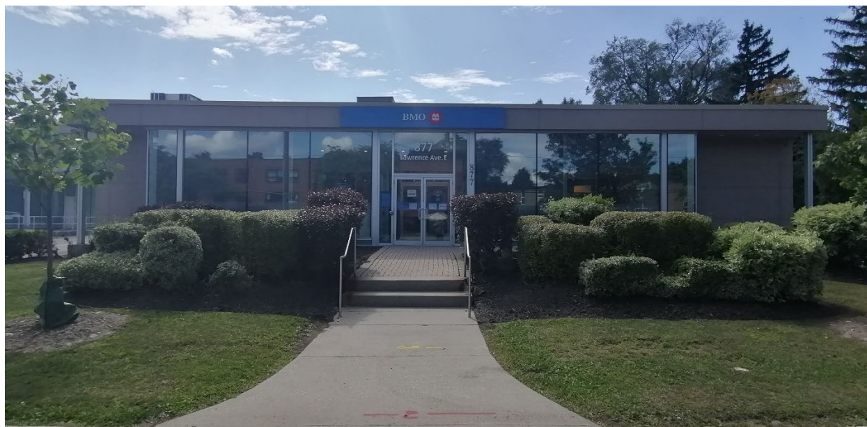
877 Lawrence Avenue East (Heritage Planning, 2024).