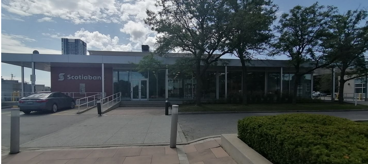
Principal (north) elevation of 885 Lawrence Avenue East.