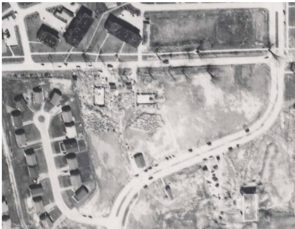
Figure 2 1956 aerial showing 877 (left) and 885 (right) Lawrence Avenue East under construction (Toronto Archives).