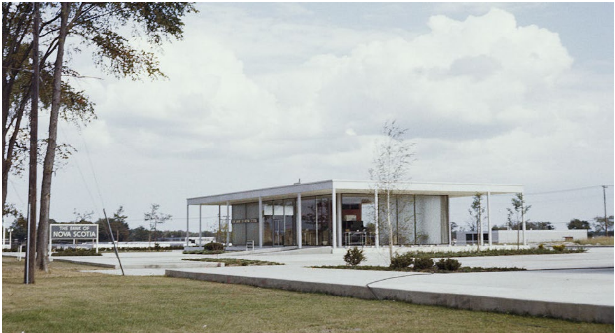
Figure 4 1957-1959 image looking southeast towards 885 Lawrence Avenue East. Note its 5-bay principal (north) elevation prior to the 1966-67 addition of 2 bays on its west elevation.