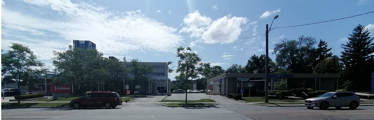
View looking south across Lawrence Avenue East towards (right to left) 877 and 885 Lawrence Avenue East (Heritage Planning, 2024).