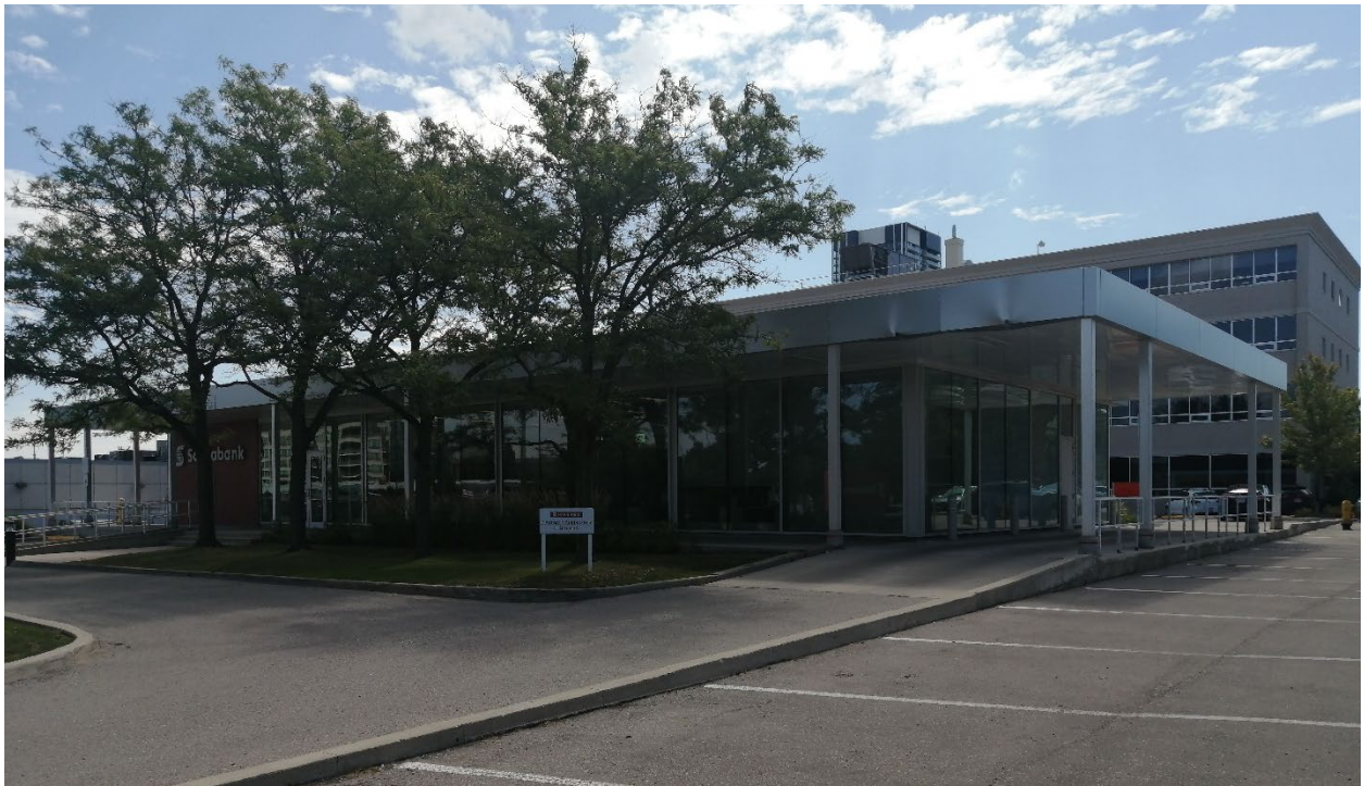
Figure 12 Image looking southeast towards the principal (north) and west elevations of 885 Lawrence Avenue East (Heritage Planning, 2024).