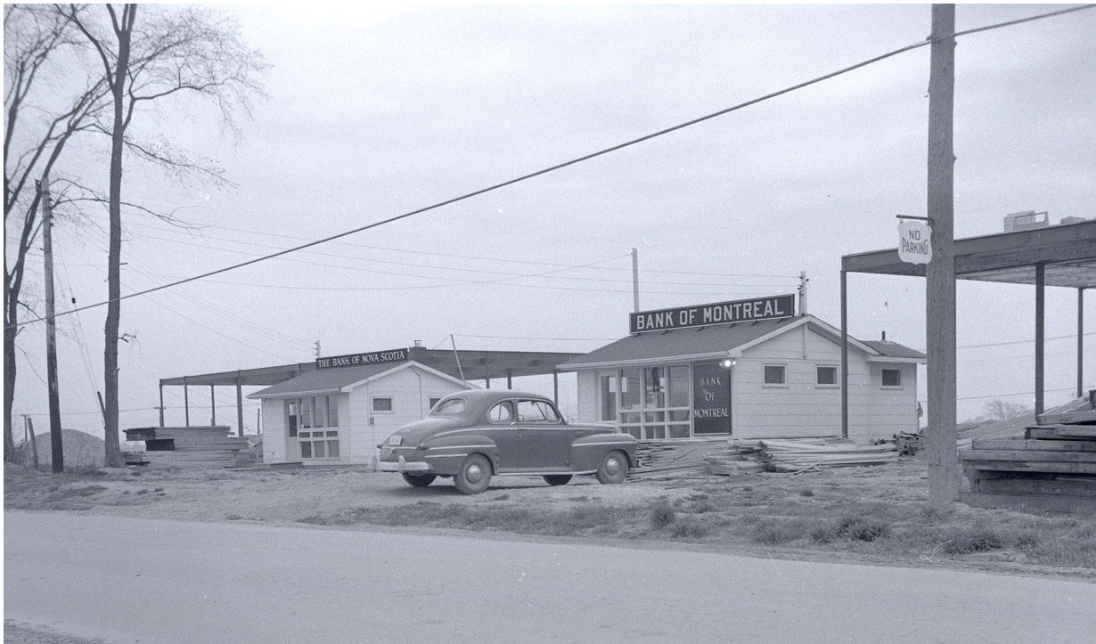
Figure 3 1956 image of the Bank of Nova Scotia at 885 Lawrence Avenue East (left) and Bank of Montreal at 877 Lawrence Avenue East (right) under construction with temporary "shack" banks.