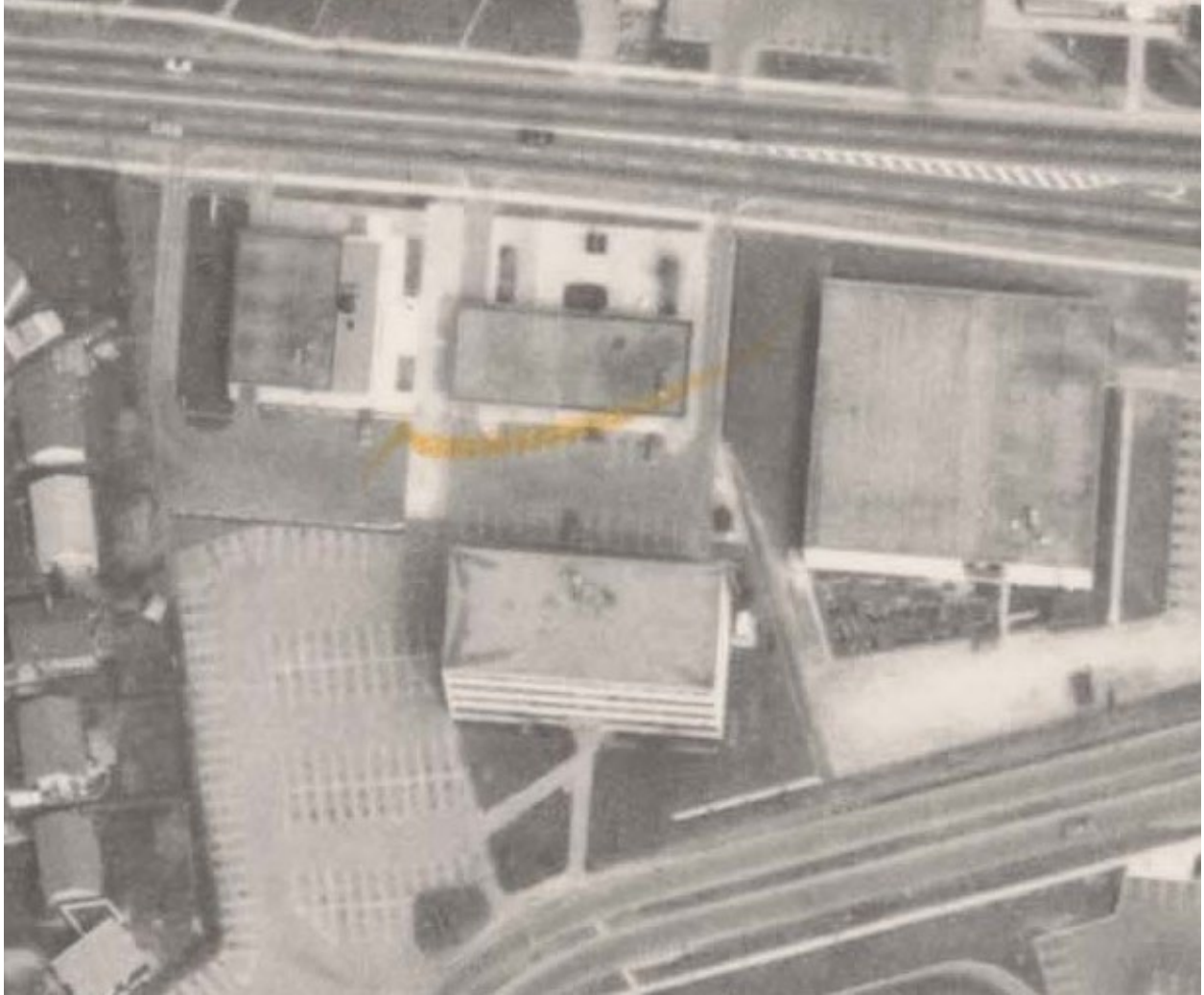
Figure 9 1968 aerial image of 877 (left) and 885 (right) Lawrence Avenue East showing their respective 1967 and 1966-67 extensions. Note the rear (south) portion of the shared public plaza is now parking (Toronto Archives).