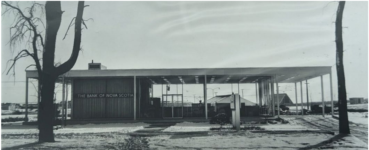
Figure 13 1957-1959 image of the principal (north) elevation of 885 Lawrence Avenue East prior to the 1966-67 addition of 2 bays on its west elevation.