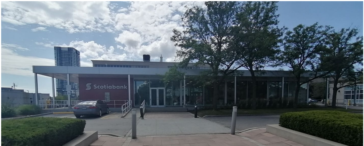
Figure14 Image of principal elevation of 885 Lawrence Avenue East (Heritage Planning, 2024).