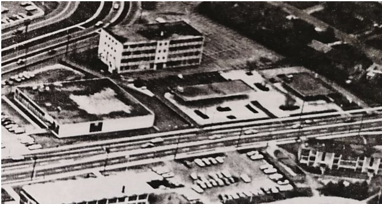
Figure 6 1967 aerial image of Lawrence Avenue East looking southwest toward 877 Lawrence Avenue East (right) and the recently expanded 885 Lawrence Avenue East (left).