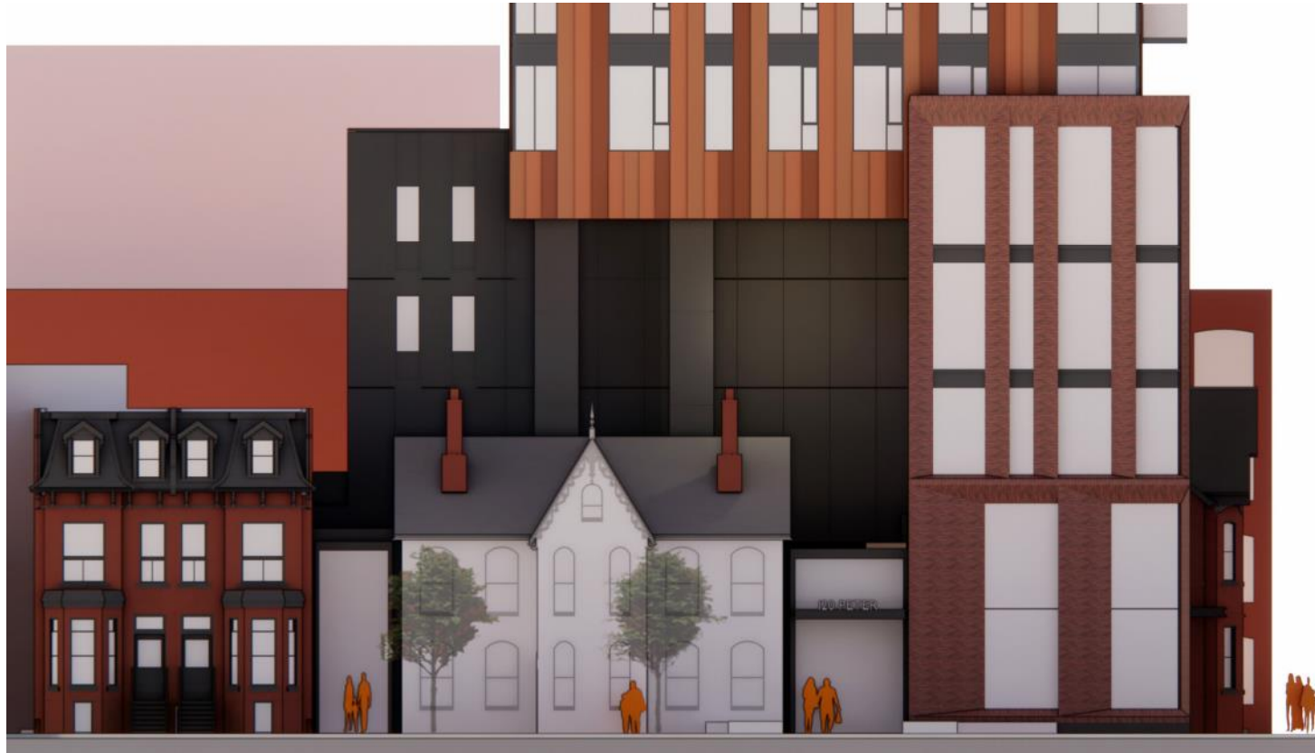
Proposed Peter Street frontage