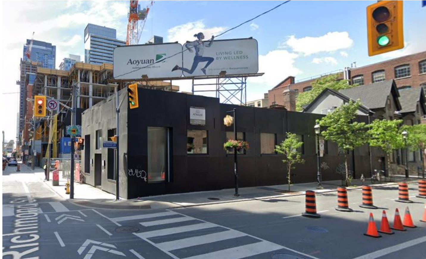
Site seen looking Southwest