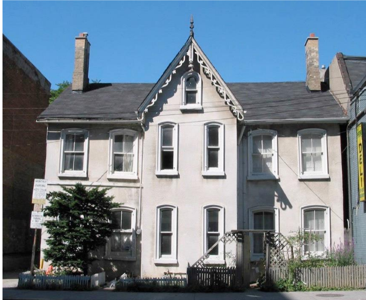
122-124 Peter Street – removed in fire