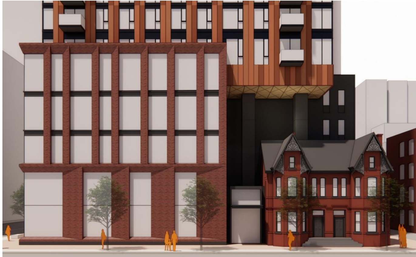
Proposed Richmond Street West frontage