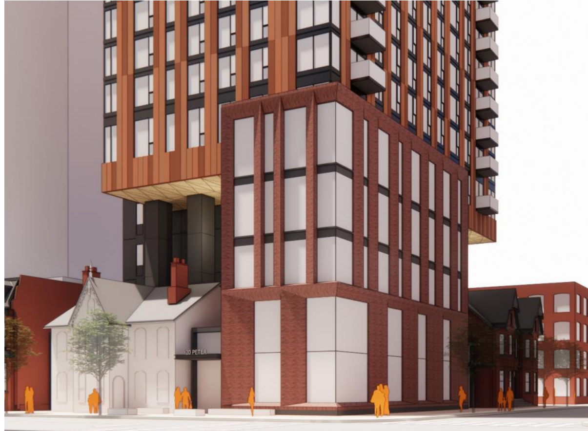
Looking Southwest at site