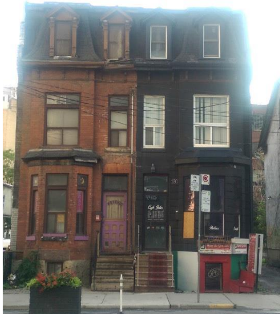
120 Peter Street – right side of semi