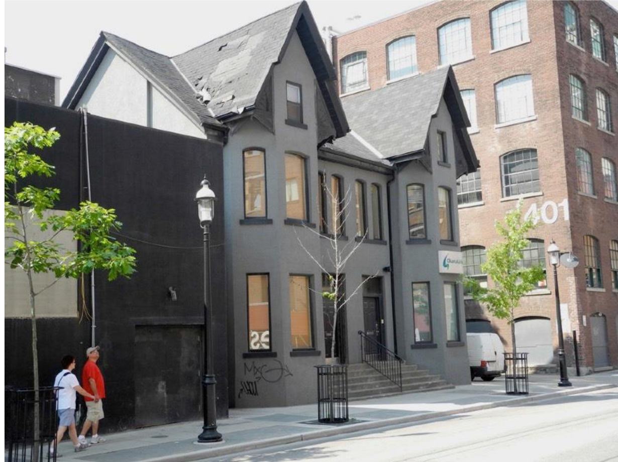
357-359 Richmond Street West