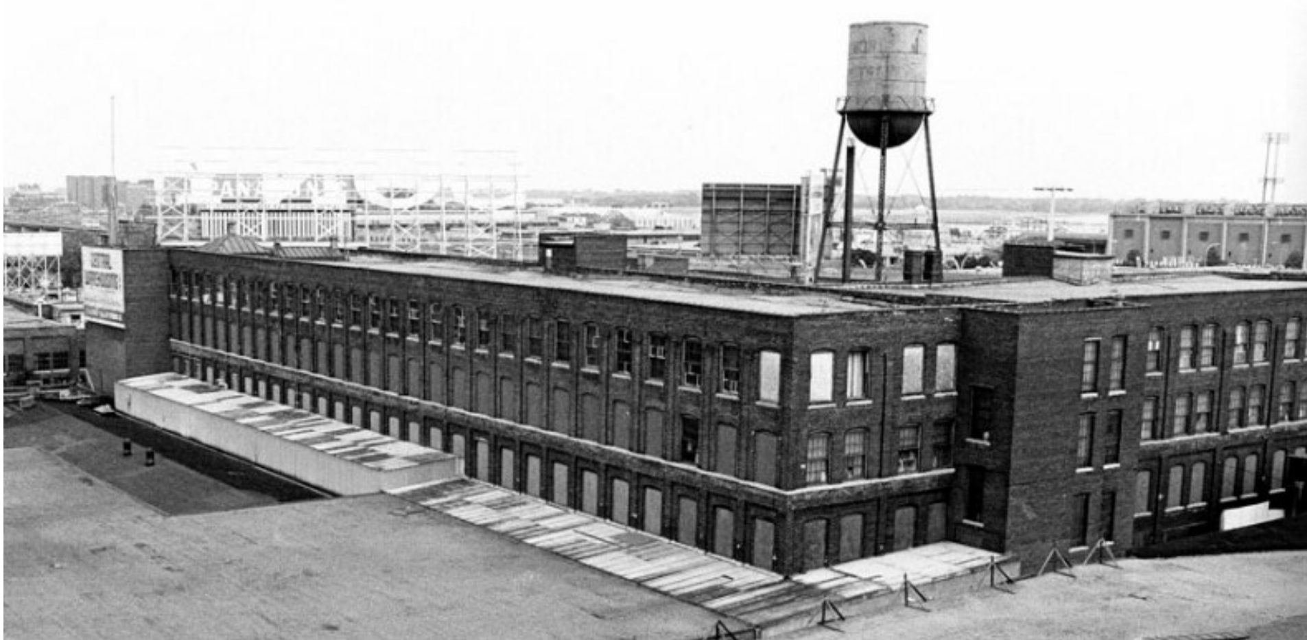
The north and west elevations of the building at 24 Jefferson Avenue prior to cladding, 1983 (Patrick Cummins).