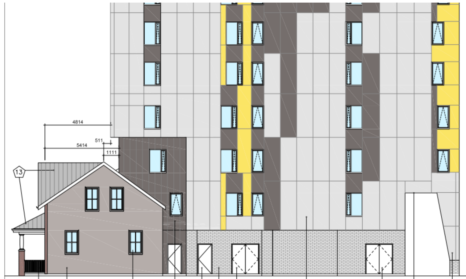
West Side/Lane Way Elevation