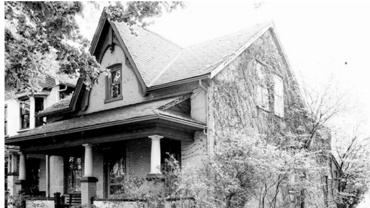
Left: Current photo of property. Right: 1973 Picture of Property.