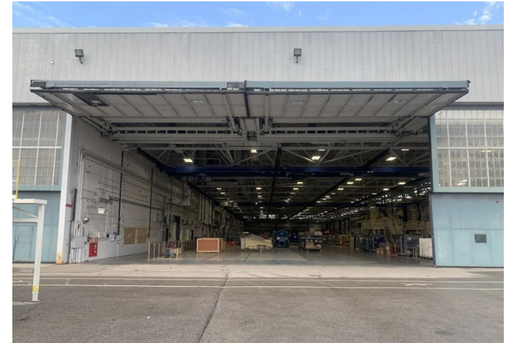
Bays 1-5 (Heritage Planning, 2023)