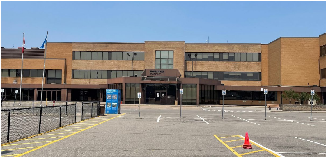
Administration Building, showing the principal (south) elevation (Heritage Planning, 2023)