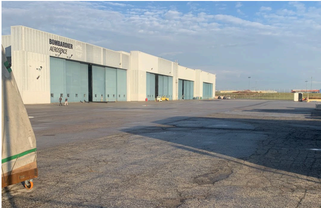
Bays 7-10 (Heritage Planning, 2023)