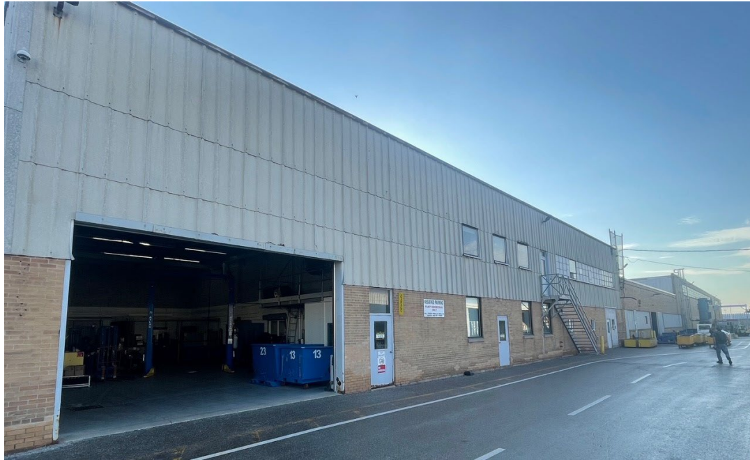
Superstore Building (Heritage Planning, 2023)