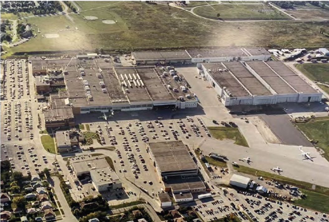
Aerial photo, looking west (c.2000). Heritage Impact Statement, ERA Architects.