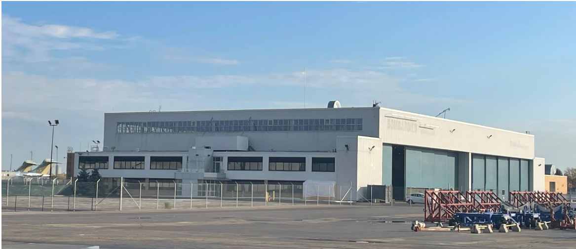
Bay 12 (Heritage Planning, 2023)