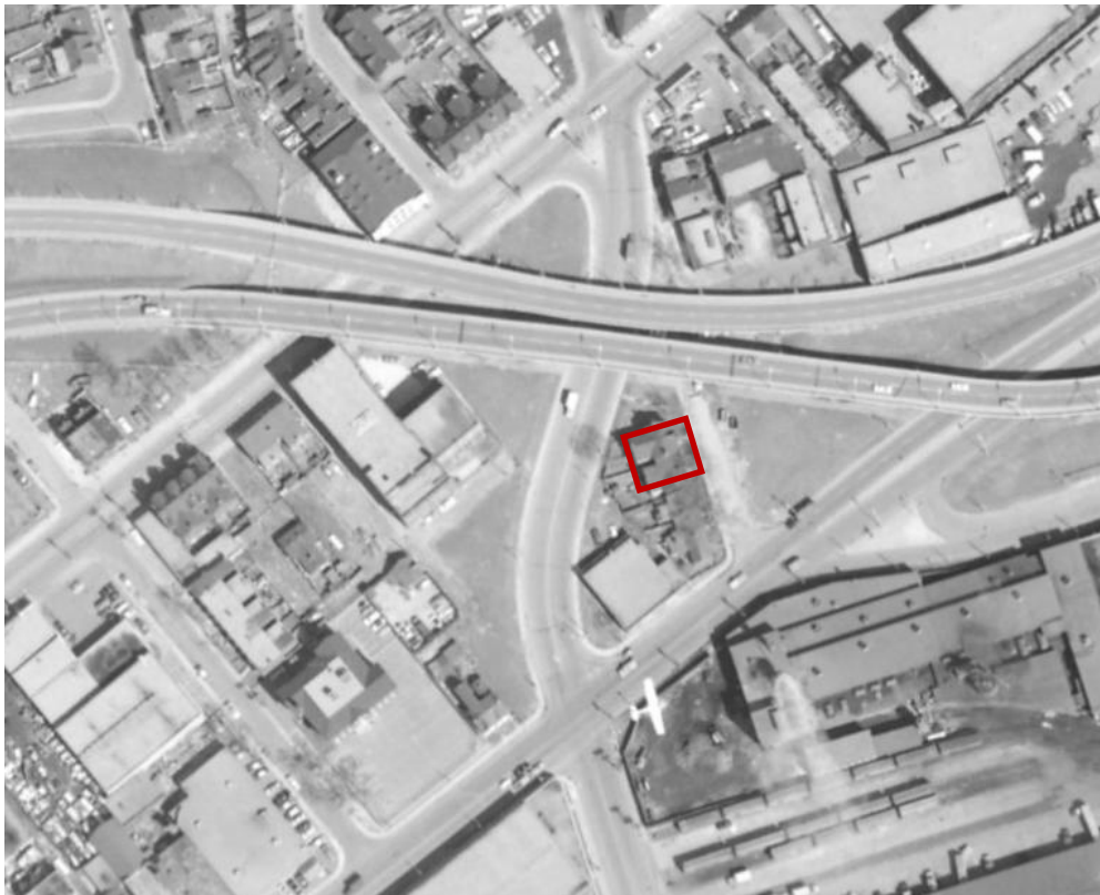
Image 6: 1965 aerial photograph showing the realignment of Sumach St to connect with Cherry south of Eastern Ave and the Adelaide and Richmond St E overpasses. (CofT)