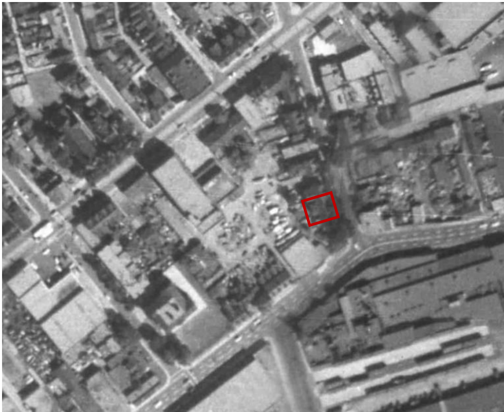
Image 5: 1954 aerial photograph showing the location of the four subject properties on the west side of the original alignment of Sumach Street (CofT)