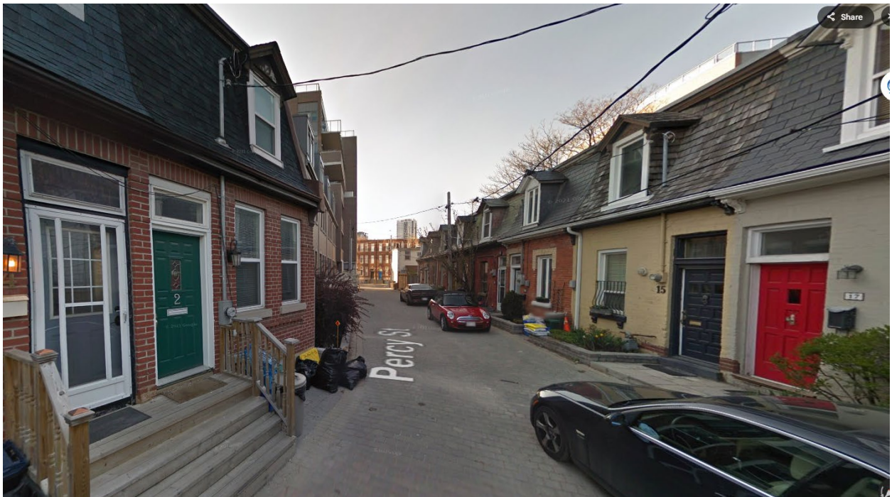
Image 20: Adjacent heritage properties (just north of the parkway overpasses) at 2-10 and 1-17 Percy Street