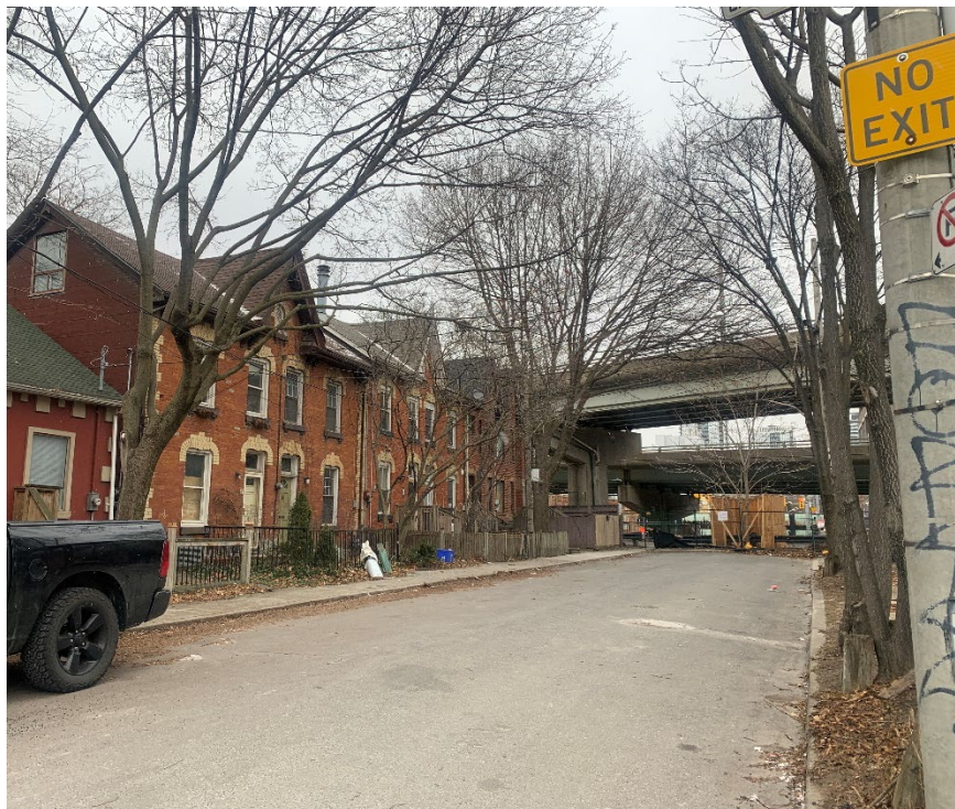
Image 16: Contextual photograph looking north from the subject properties to the Adelaide and Richmond Street East overpasses that severed this original portion of Sumach Street from the rest of the historic street north of King Street East.