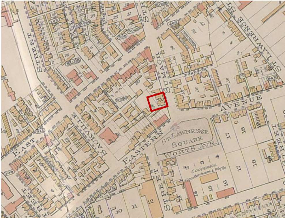
Image 3: 1889 Goad's historical map showing the location of the four subject properties (Ng)