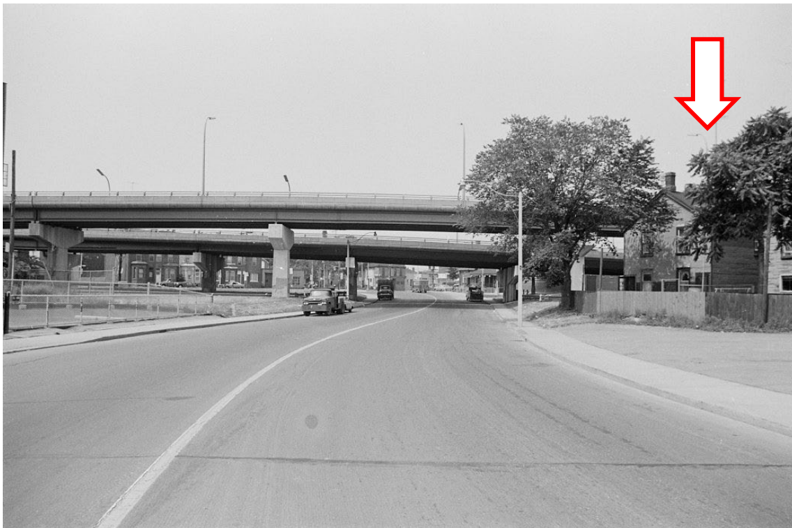
Image 7: 1972 archival photograph looking northwest from Eastern Ave and St. Lawrence St. The subject properties are indicated by the arrow. (Toronto Archives)

City of Toronto Archives, Fonds 2032, Series 841, File 19, Item 36