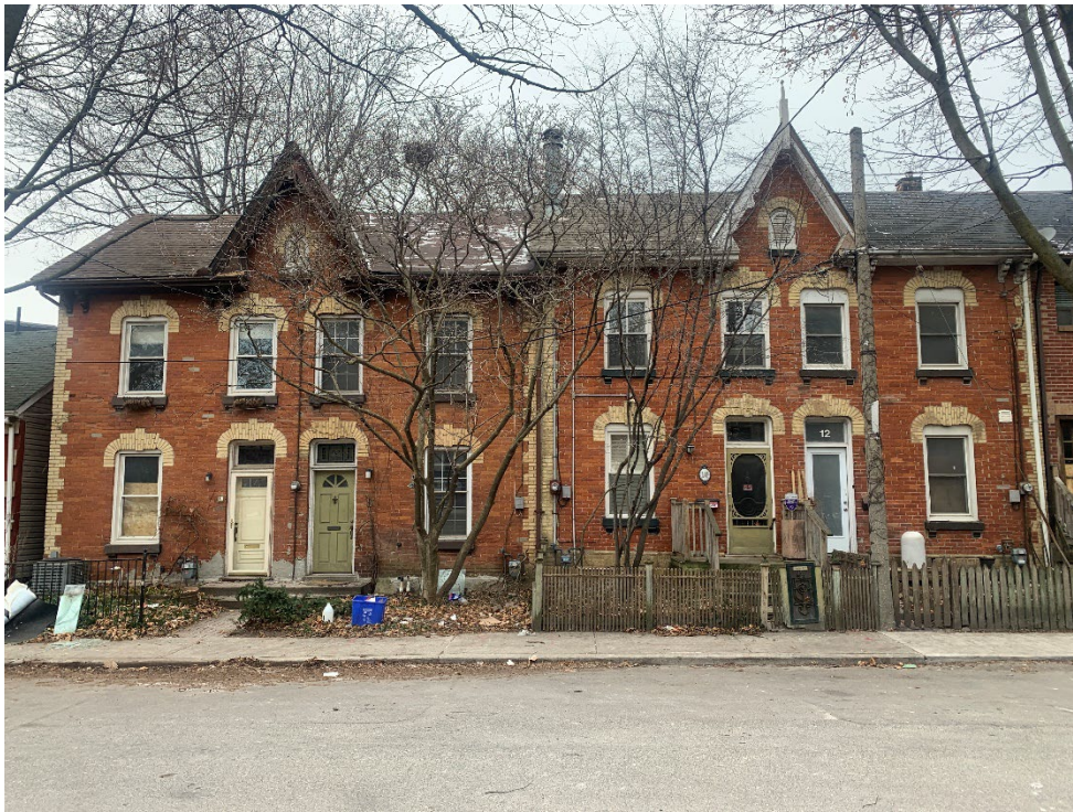
Image 10: Principal (east) elevations of the properties at 6-8 and 10-12 Sumach Street. Note the tall, wooden finial at the peak of the roof gable at 10-12 (currently missing at 6-8). (Heritage Planning, 2025)