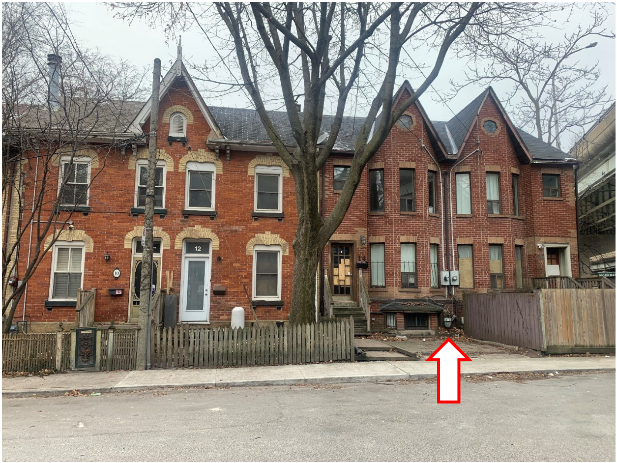
Image 9: Principal (east) elevations of 10-12 Sumach Street, at left, and infill properties at 14-16 Sumach Street (c.1984) indicated by the arrow. The latter properties replaced a larger boarding house at 14 Sumach Street that was demolished to make way for the parkway overpass. (Heritage Planning, 2025)