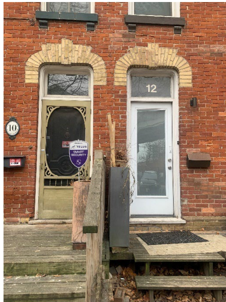
Images 11 and 12: Detail of the principal elevations at 6-8 and 10-12 Sumach Street, showing the decorative contrasting brickwork and original door openings with transoms. The stained glass transom at 8 Sumach Street is likely original to the 1886 house. (Heritage Planning, 2025)