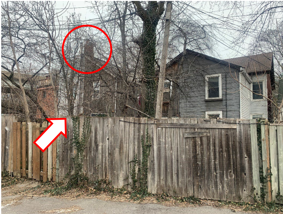
Image 14: Current photograph looking east at the rear (west) elevations of the properties at 6-8 Sumach Street, at right, and 10-12 Sumach Street, at left. The red circle indicates the same centred brick chimney, now truncated.