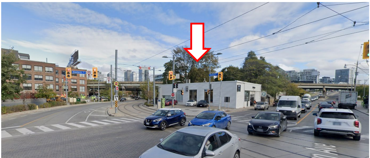
Image 18: Contextual image looking north along the realigned portion of Sumach Street. The arrow indicates the location of the subject properties on the original portion of Sumach behind the white building in the foreground. (Google, July 2023)