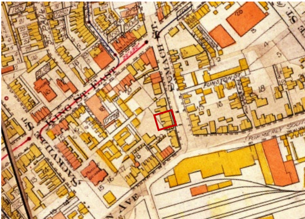
Image 4: 1924 Goad's historical map showing the location of the four subject properties (Ng)