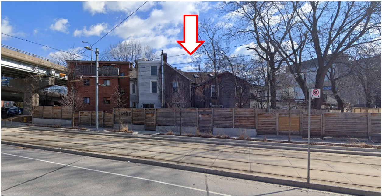
Image 17: Contextual image looking east at the rear (west) elevations of the subject properties and their proximity to the parkway overpass at left. (Google, Feb 2018)