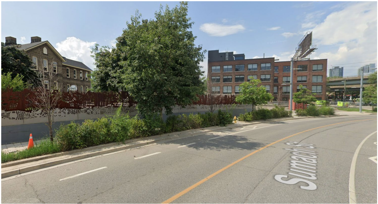
Image 19: Contextual image showing the west side of the Sumach Street alignment with 507 King Street East at right and the Sackville Street Public School at left. (Google, July 2023)