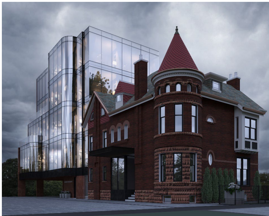
Proposed renderings showing west and south elevation with the new rear addition behind the existing retained heritage building with restored architectural features (Source: Richard Wengle Architect, 2025)