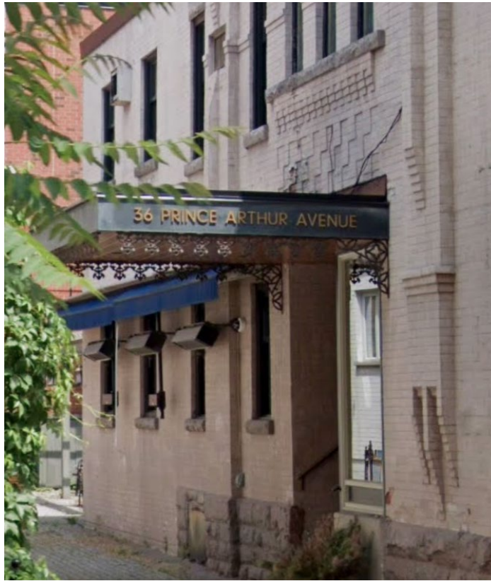
West elevation of 36 Prince Arthur Avenue showing existing entrance