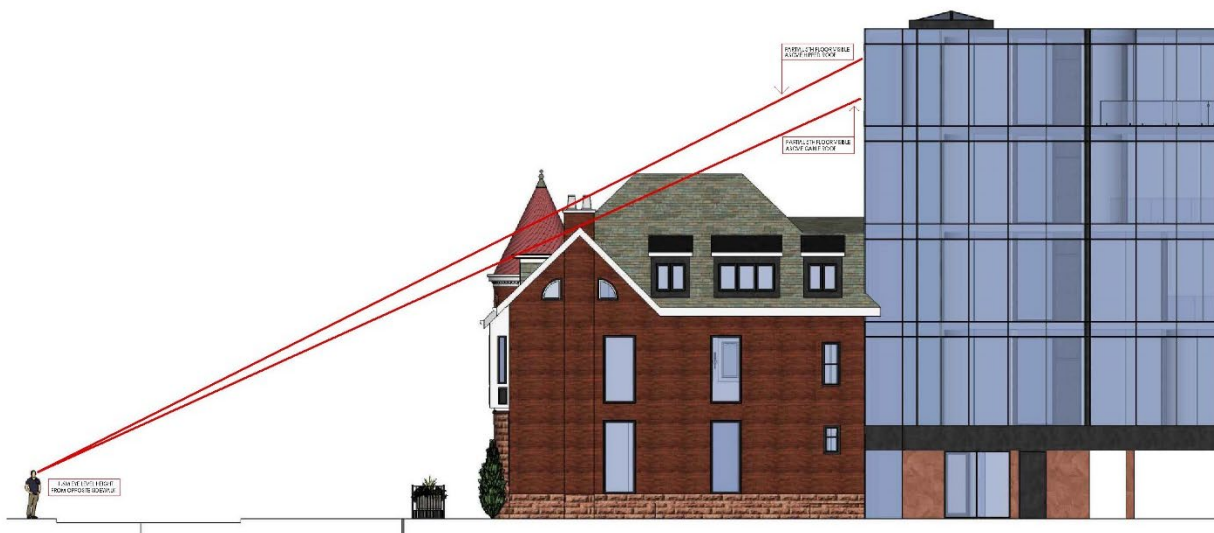
East Elevation showing visibility of addition from the public realm.