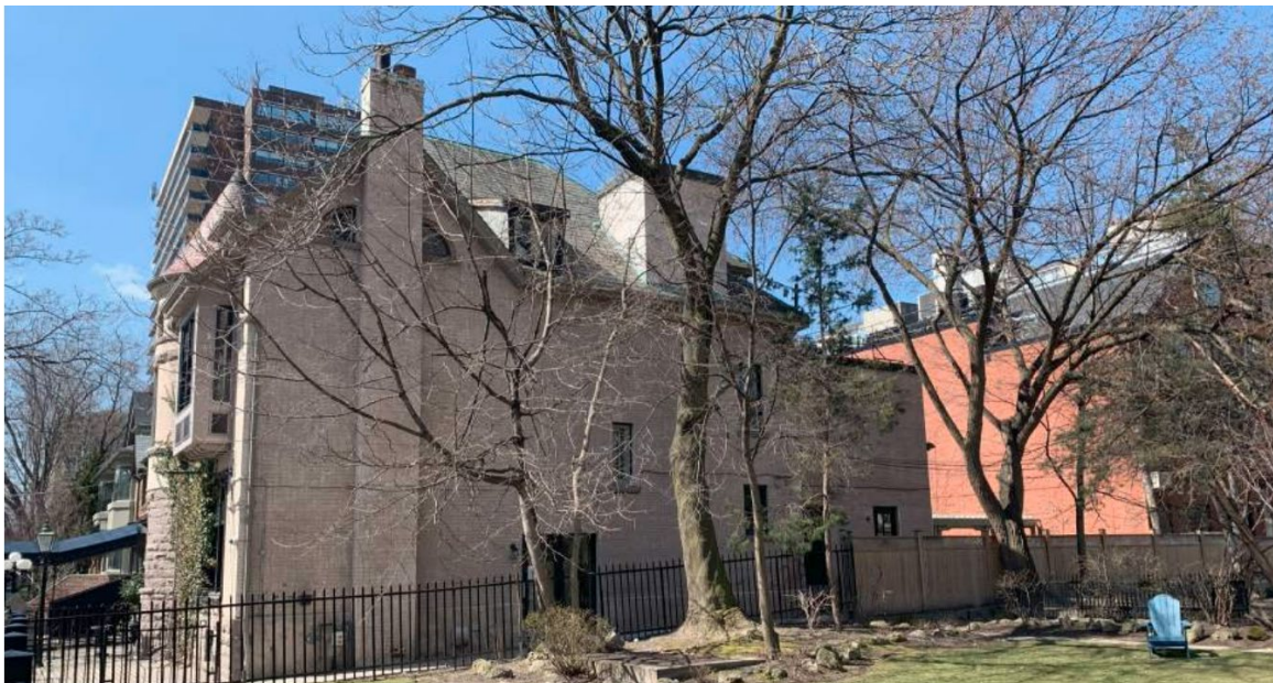
East elevation of 36 Prince Arthur Avenue showing existing windows, chimney, elevator overrun to be altered