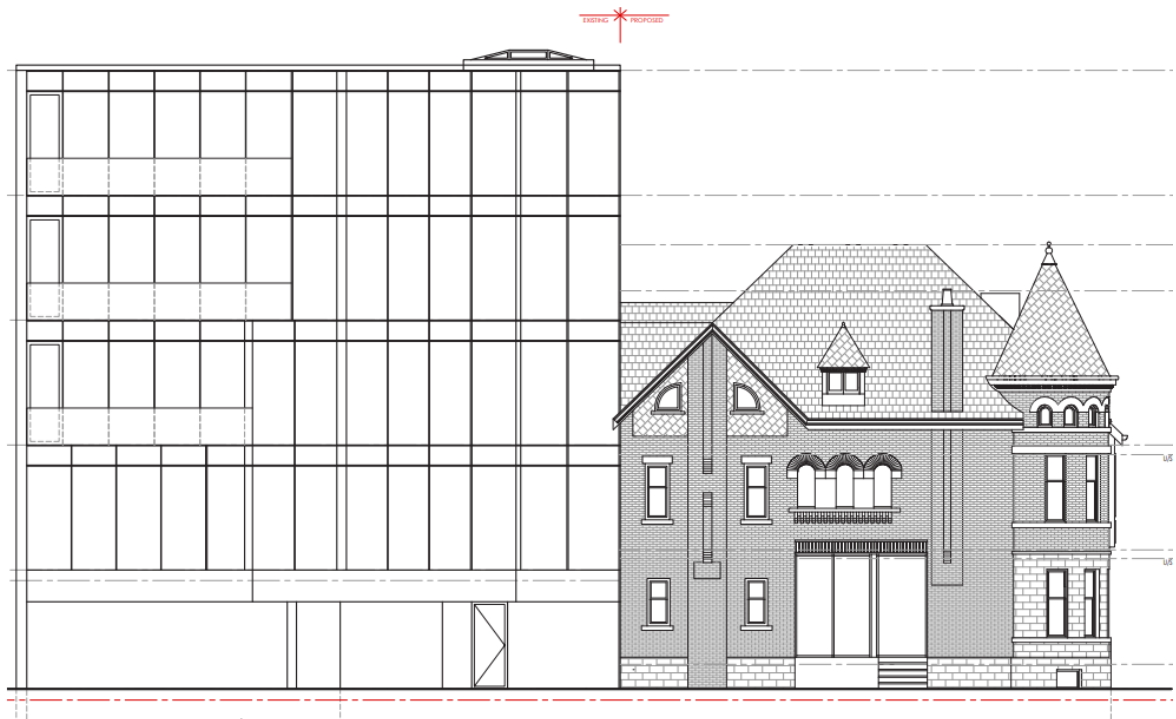
West Elevation (Source: Richard Wengle Architect, 2025)