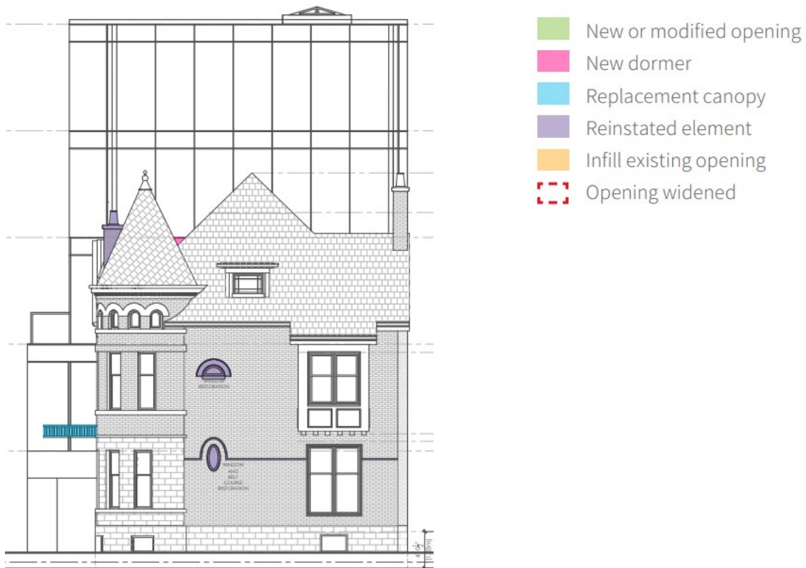
Primary (south) elevation showing the restoration of the oval window, half round window and chimney in purple and the new metal canopy on the west elevation in blue