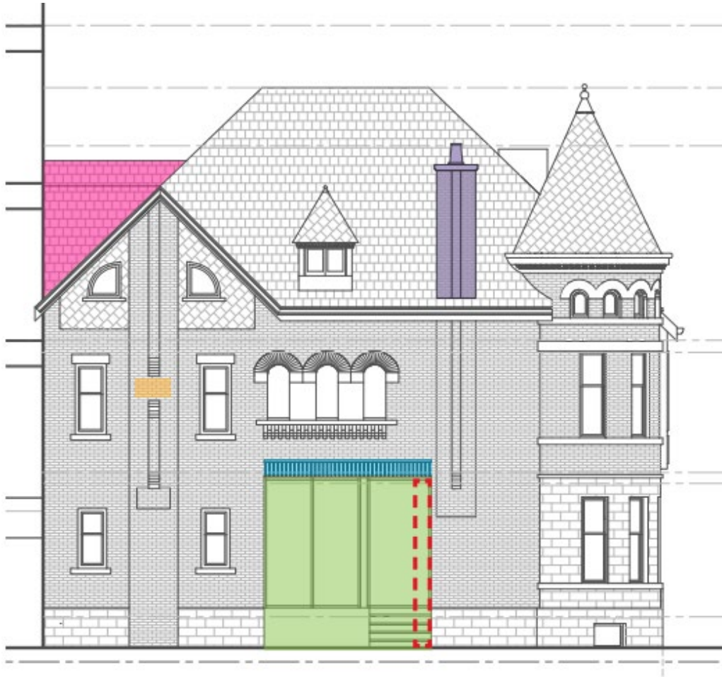
Proposed west elevation showing reinstatement of the missing chimney in purple, replacement with metal canopy in blue, new rear dormer in pink, widened entrance in green with red hash line showing area of masonry removal, and infill of vent opening in orange (Source: ERA Architects Inc., 2025)