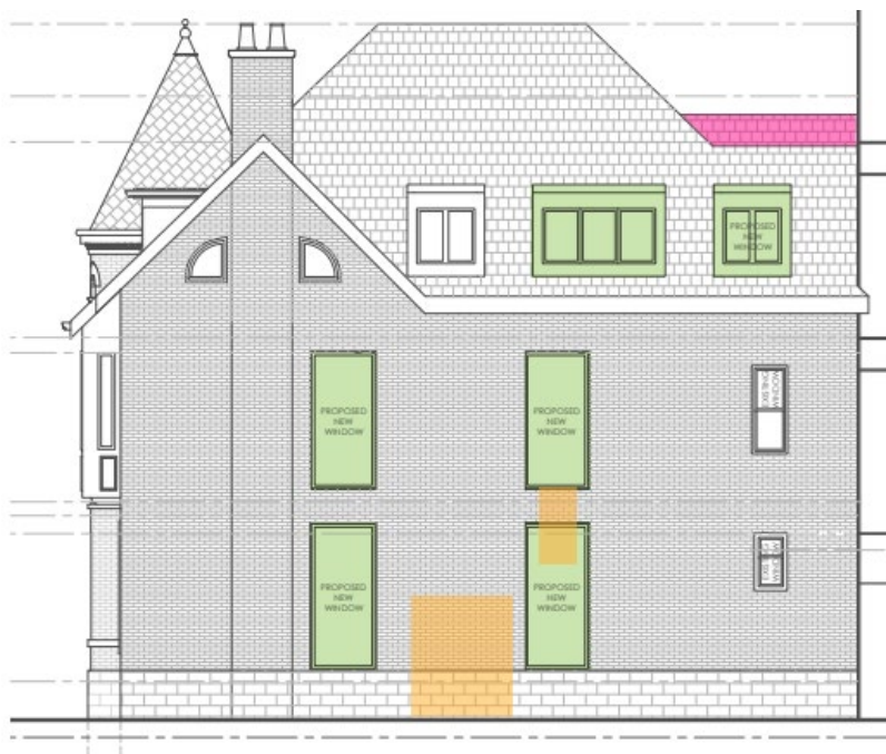
Proposed east elevation showing new windows in green, new rear dormer in pink and infilled openings in orange