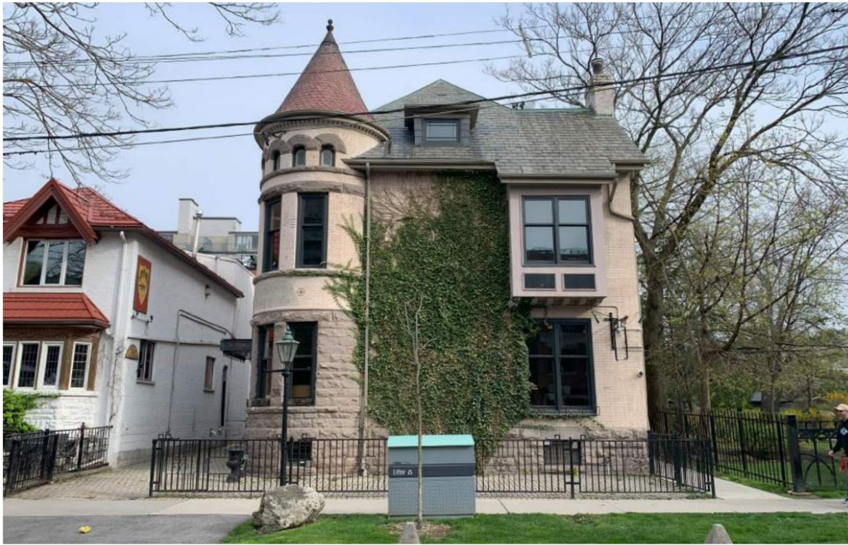
Primary (south) elevation of 36 Prince Arthur Avenue showing the building as seen from Prince Arthur Avenue. Partial view of the property at 36A Prince Arthur Avenue is seen on the left