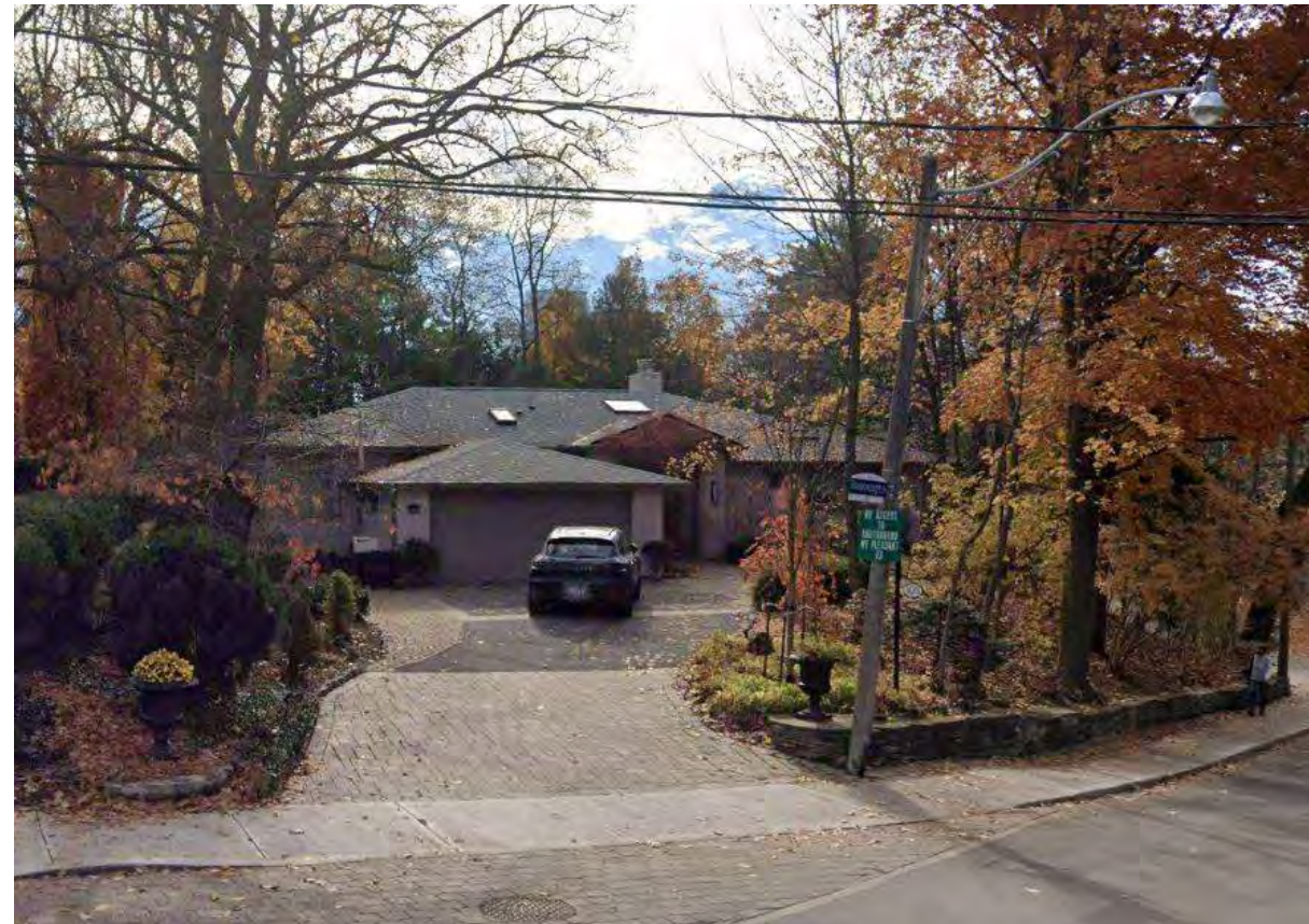
Comparable adjacent property: 105 Roxborough Drive (1954) (also unrated)

Development in this period is characterized by modern ranch style homes. Additionally, some extreme renovations of older homes replaced historical detail.