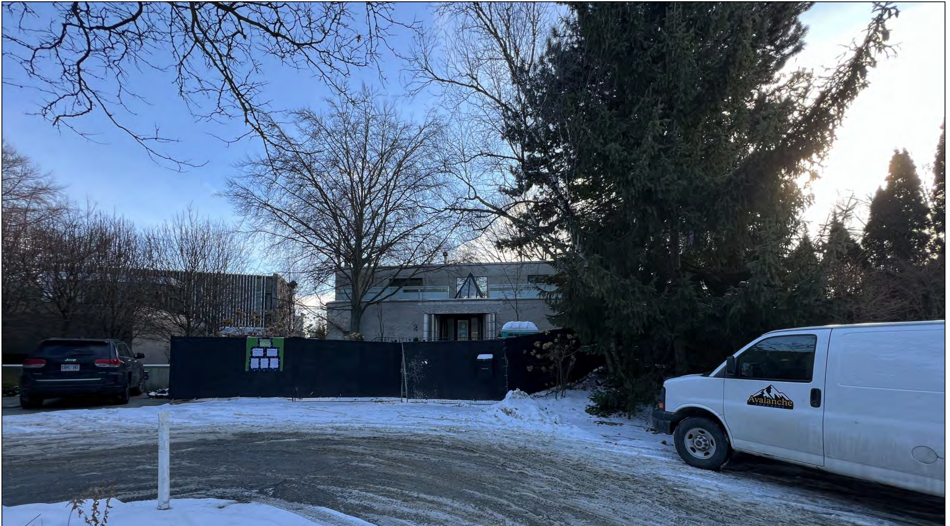
Original Architect: William G. Grierson; renovated Hicks & Pettes Constructed: c. 1965; renovated c. 2000 Designation: Unrated