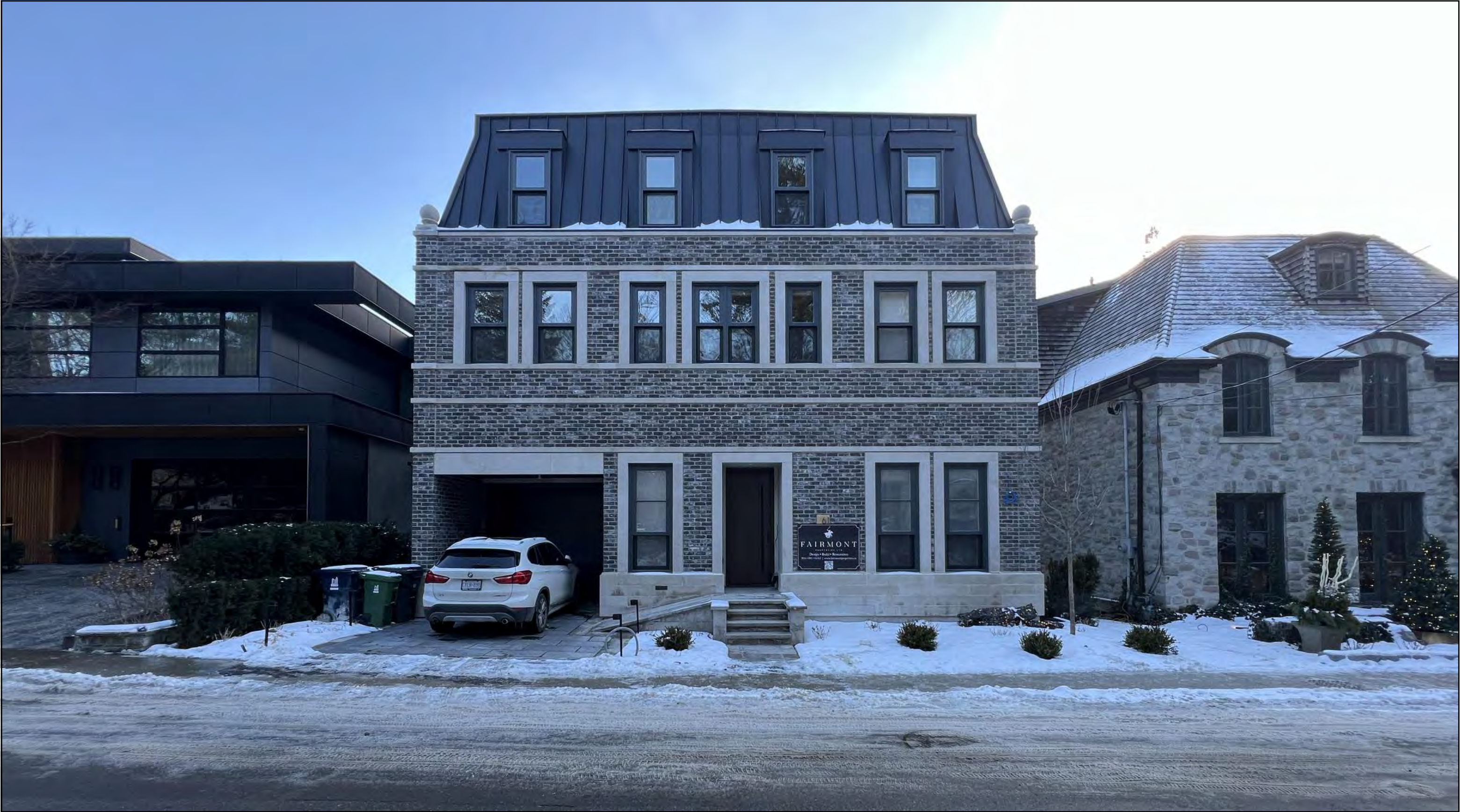
Original Architect: G. Crimi / Fairmont Properties Ltd. Constructed: c. 2024 Designation: Unrated