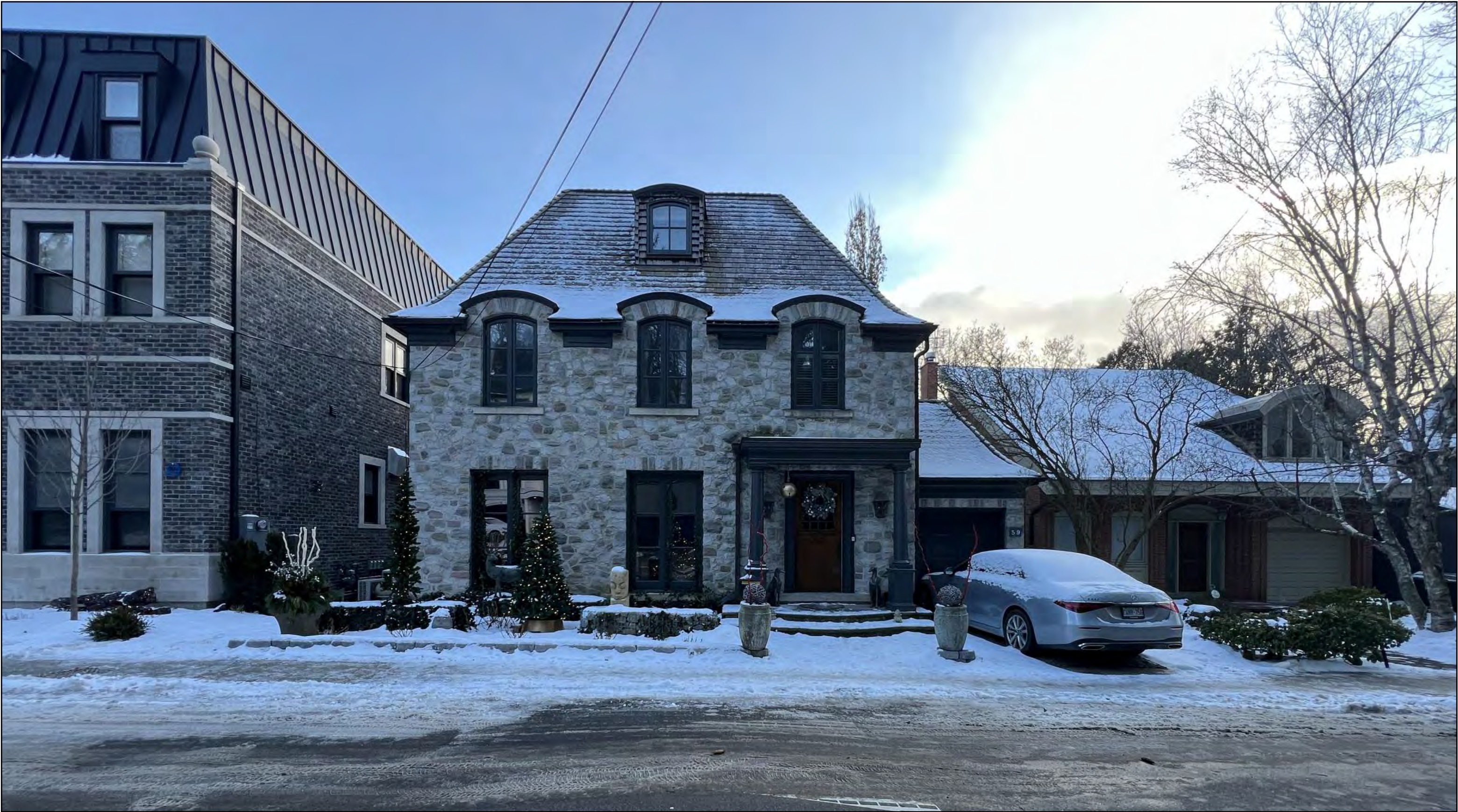
Original Architect: unknown Constructed: post-1967 Designation: Unrated