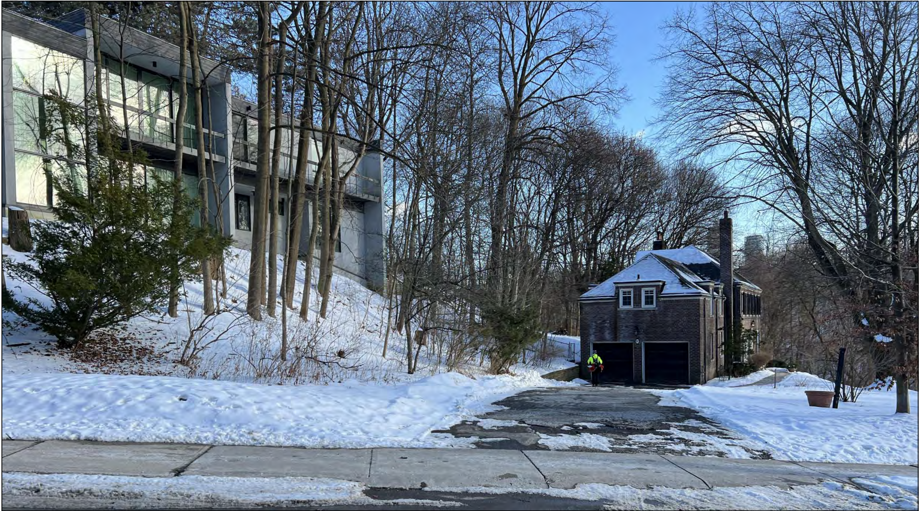
Original Architect: unknown Constructed: c. 1938 Designation: Unrated