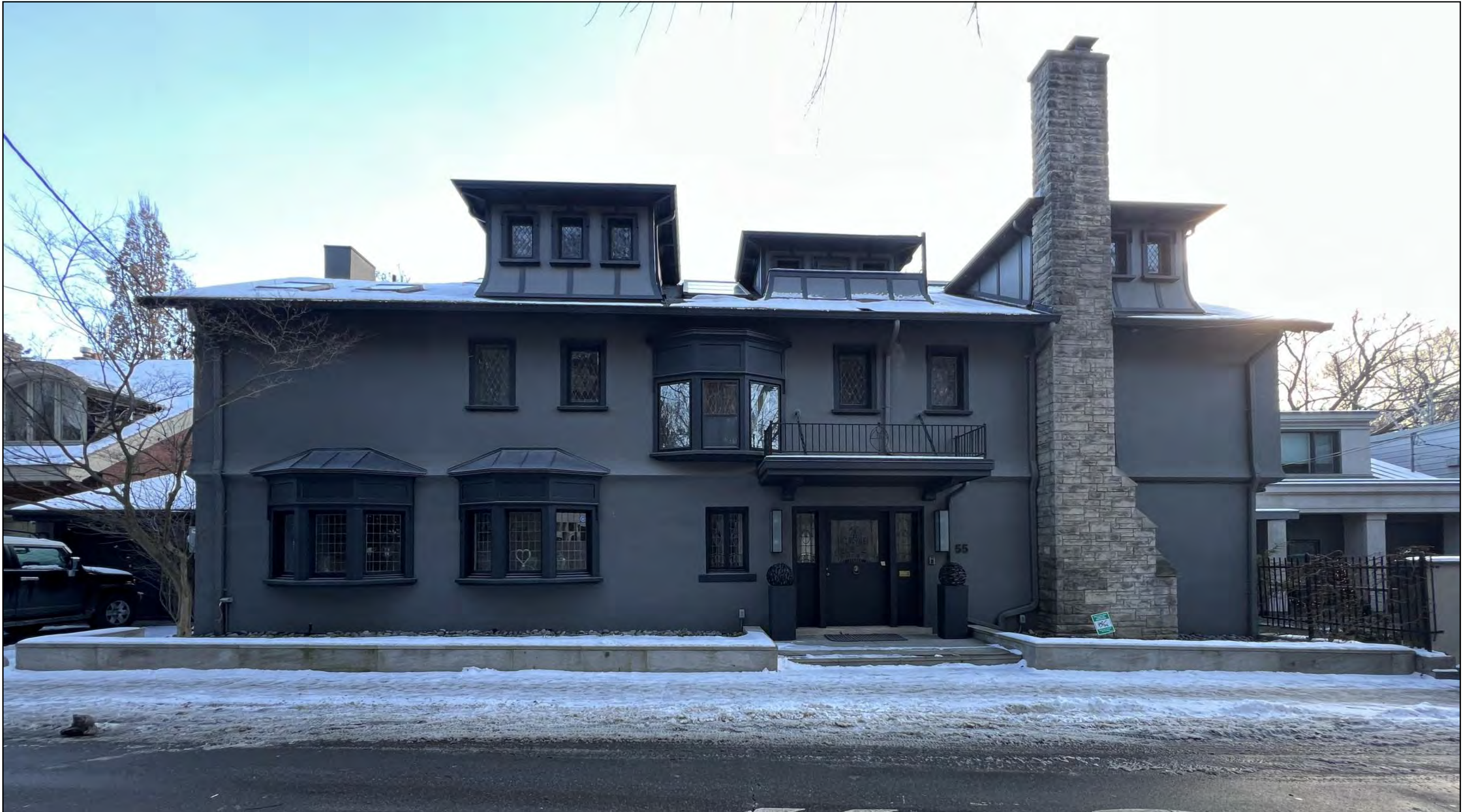
Original Architect: Ashton Pentecost Constructed: c. 1912 Designation: C rated