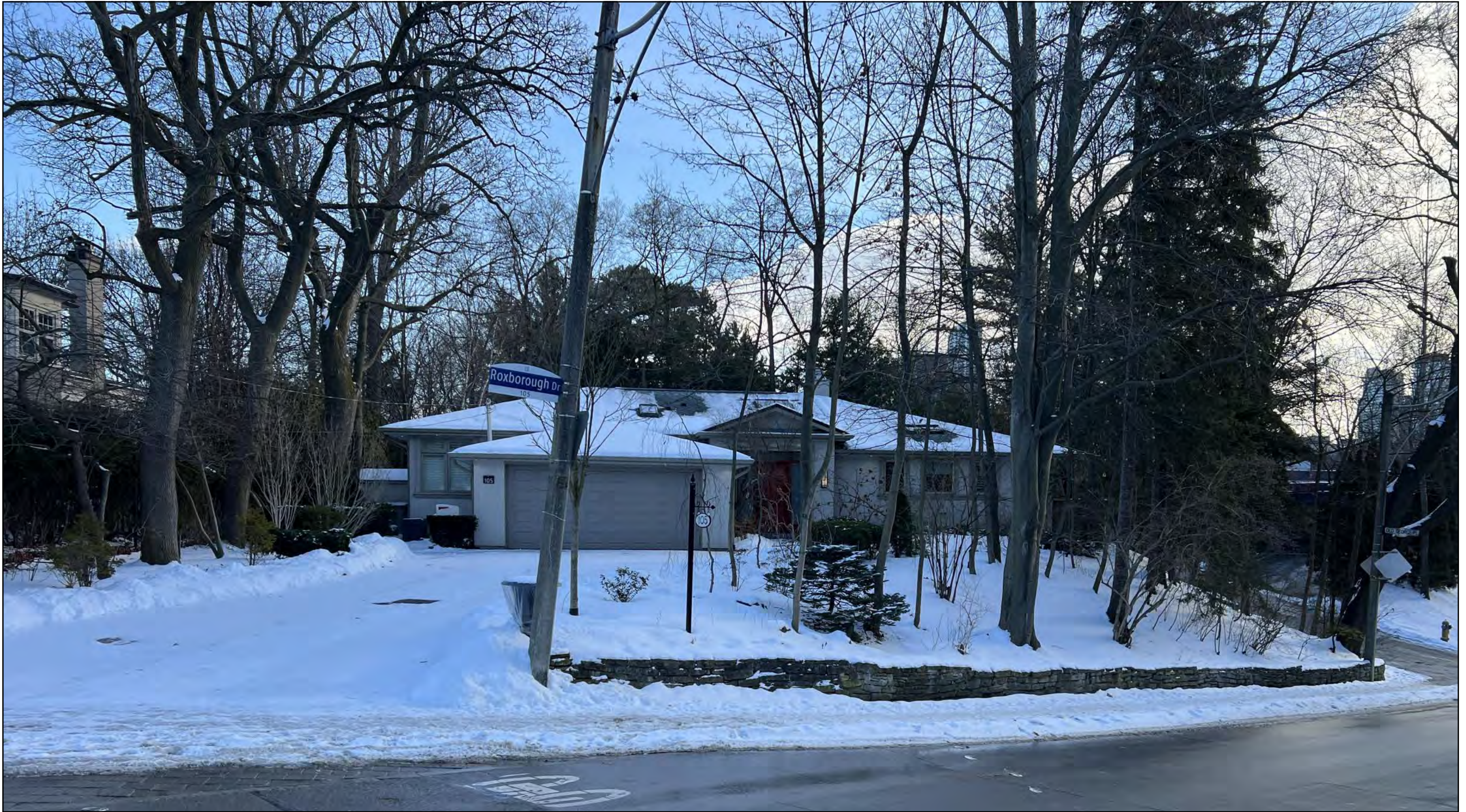
Original Architect: unknown Constructed: c. 1954 Designation: Unrated