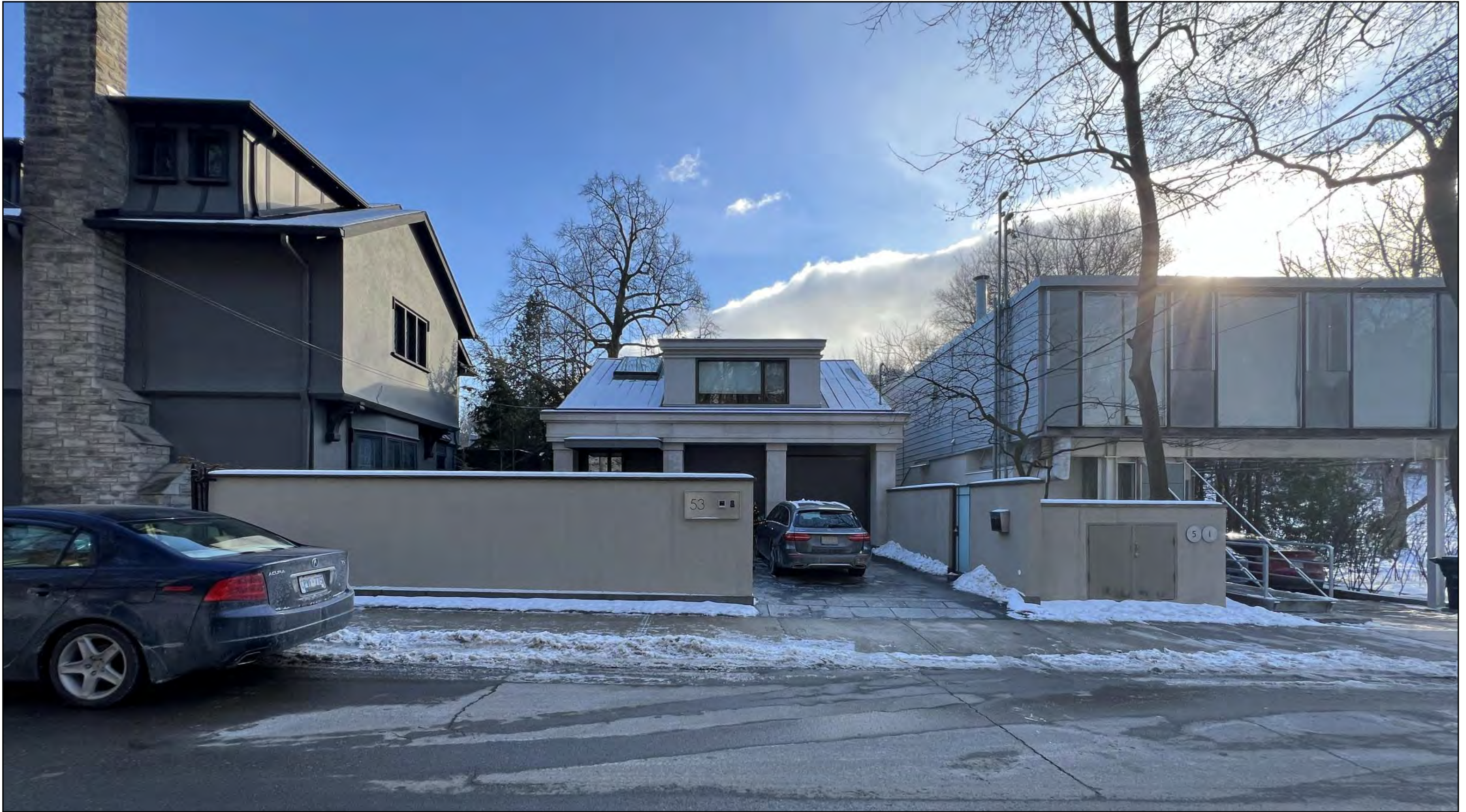
Original Architect: unknown Constructed: c. 1953 Designation: Unrated