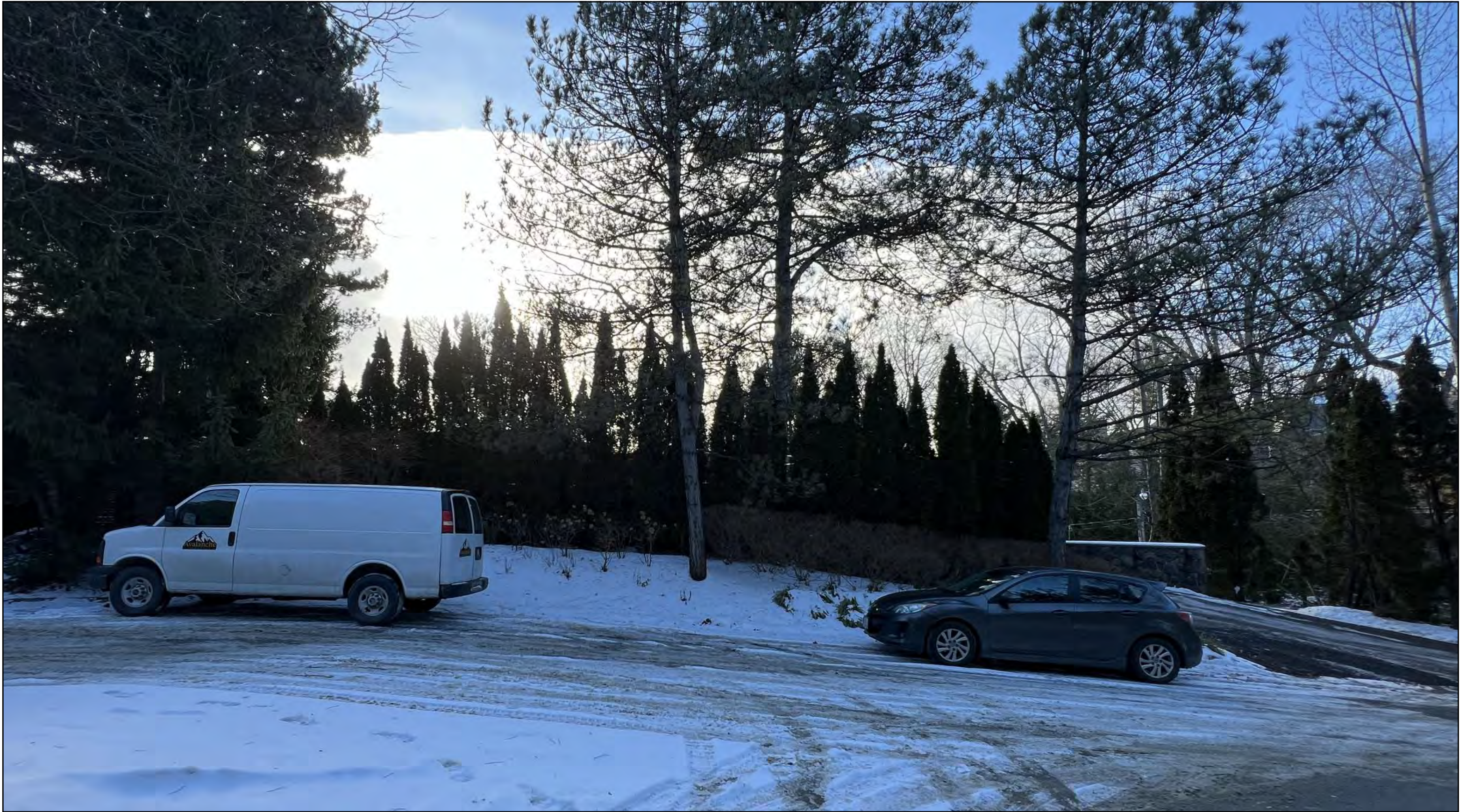
Original Architect: unknown Constructed: c. 1969 Designation: Unrated