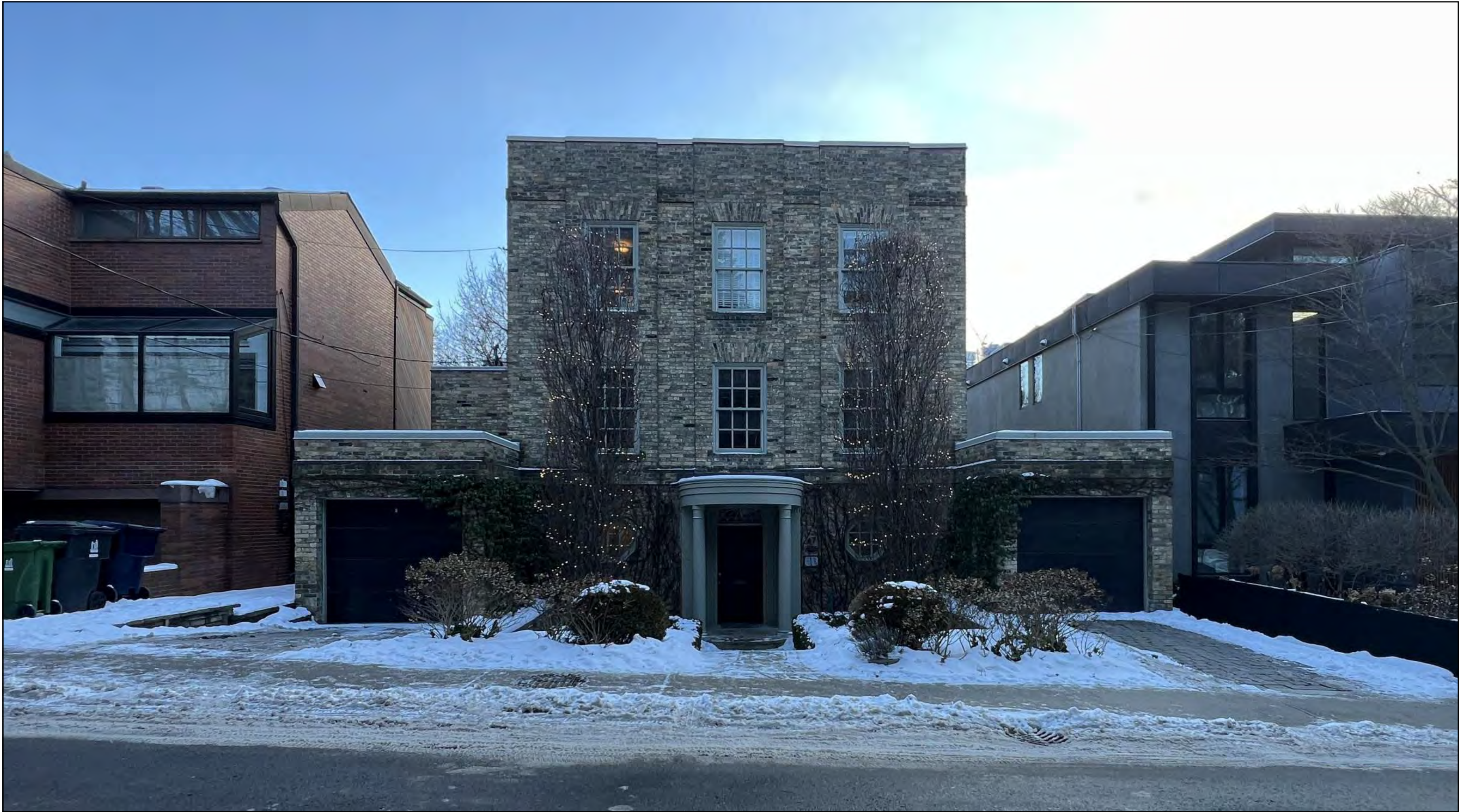
Original Architect: Mackenzie Waters Constructed: c. 1935 Designation: B rated