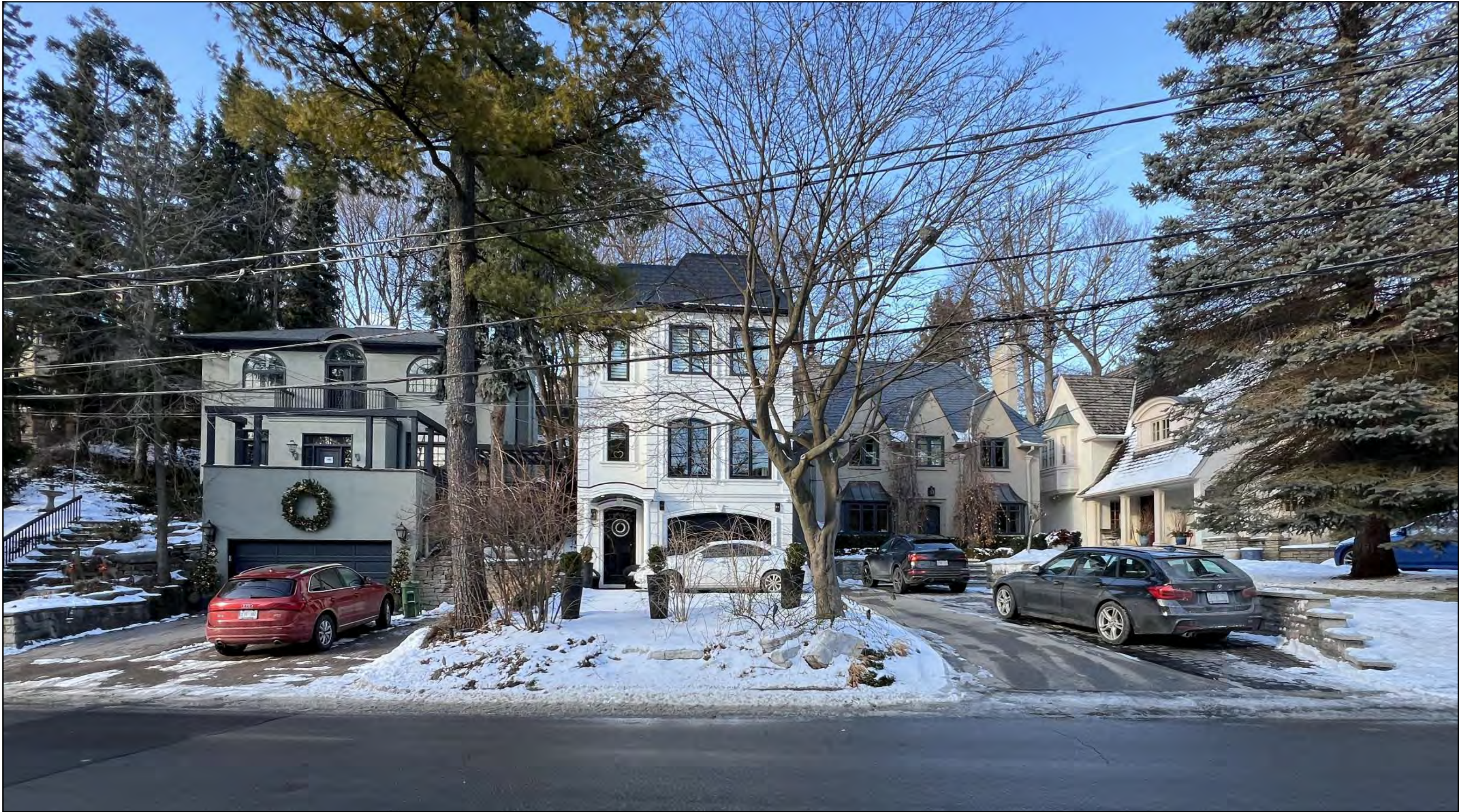
Original Architect: unknown Constructed: varies Designation: Unrated / C rated / C rated