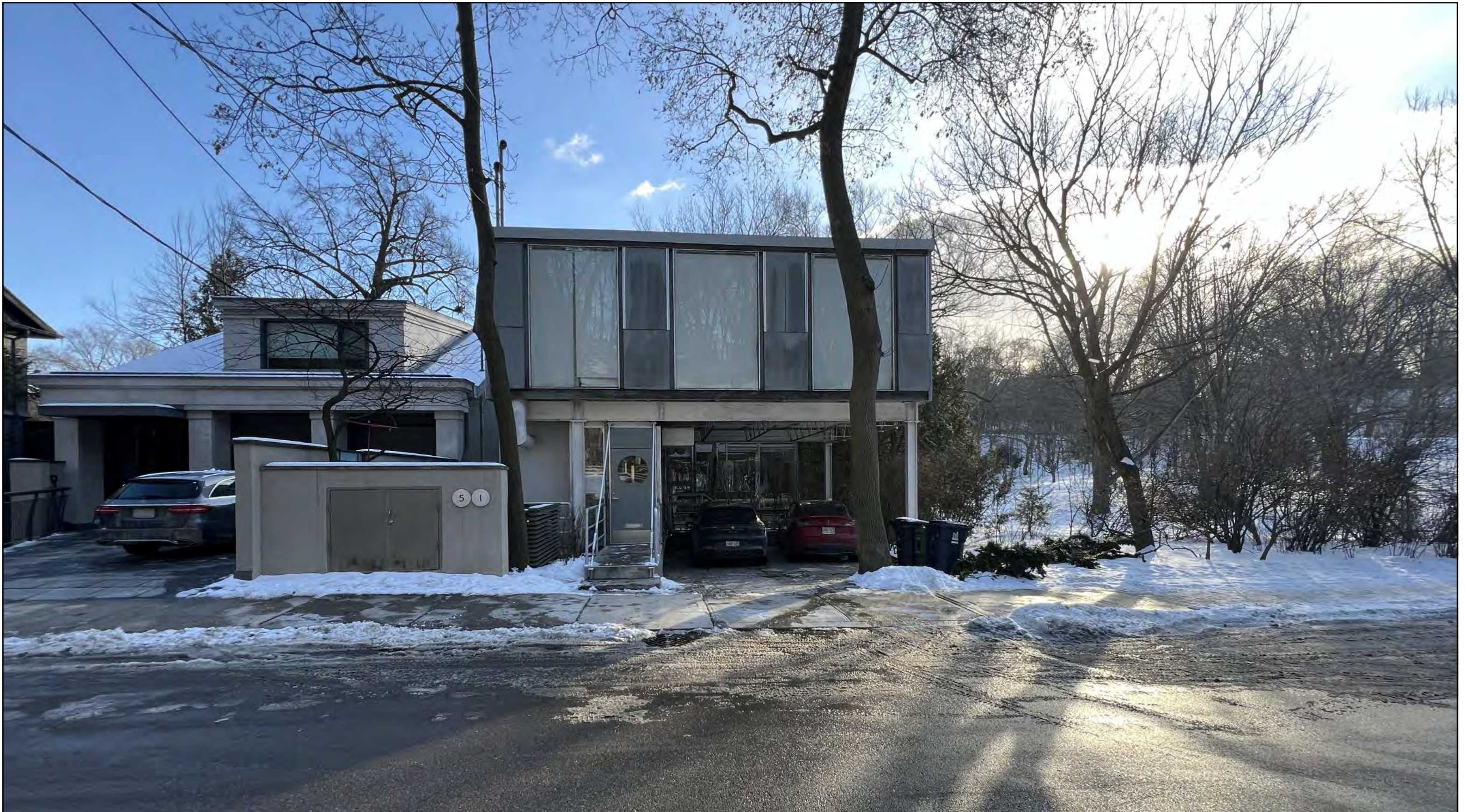
Original Architect: Barton Myers Constructed: c. 1974 Designation: A rated