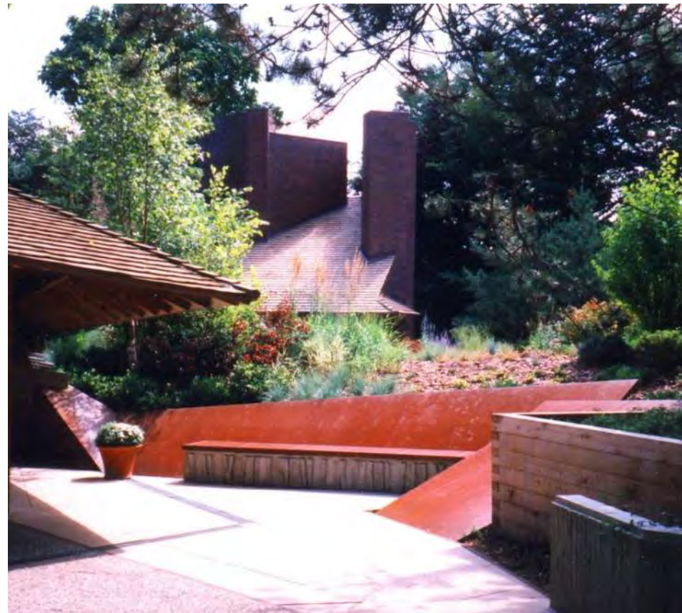
Figure 17: 4 Old George Place (Ron Thom, 1965) (A rating: NRHCD text and photo missing)

Some very fine modern and post-modern homes were constructed in this period, which was dominated by renovation and rebuilding. The following well-known architects built in North Rosedale: Barton Myers, Ron Thom, John Parkin, and Eberhard Zeidler.