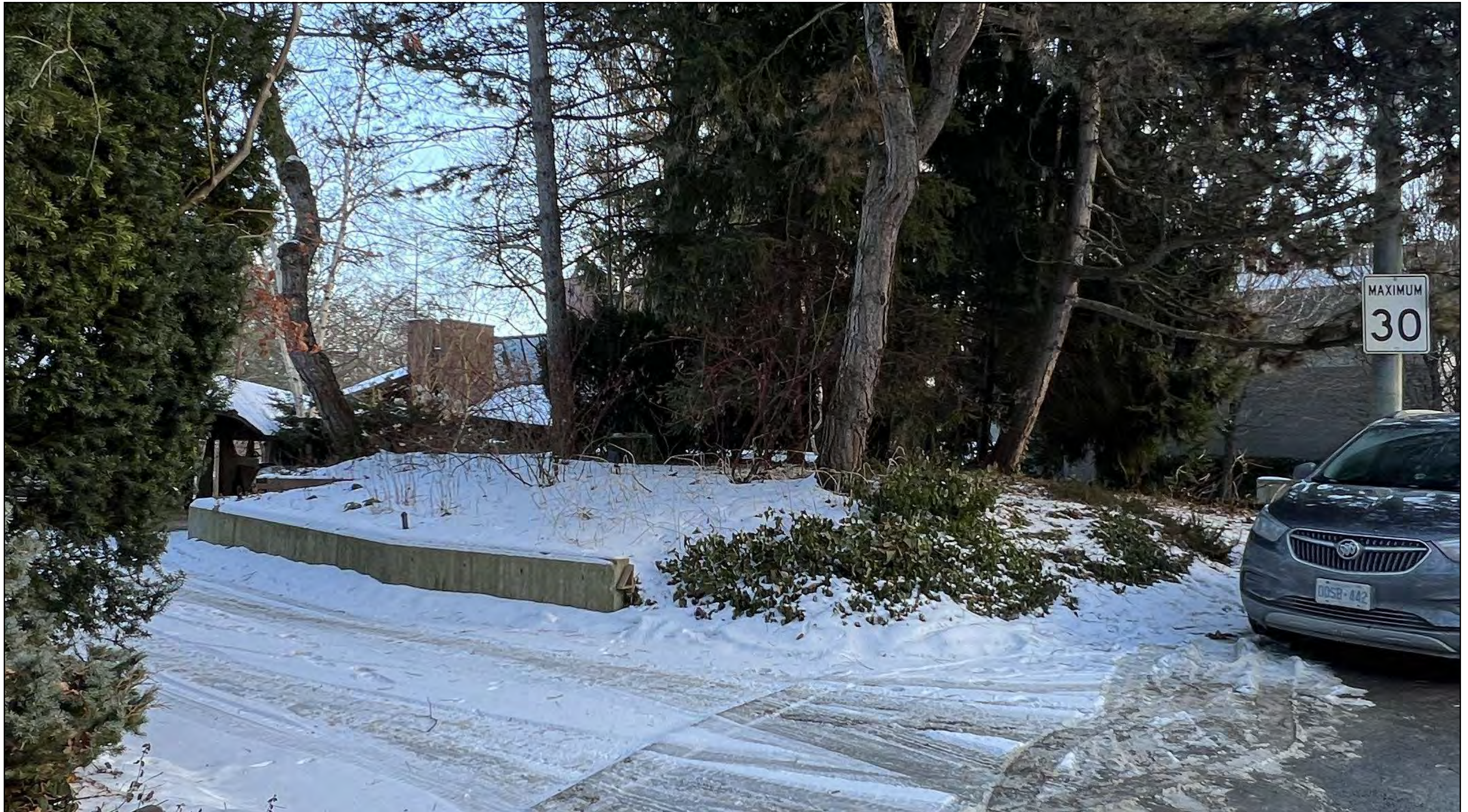
Original Architect: Ron Thom Constructed: c. 1968 Designation: A rated