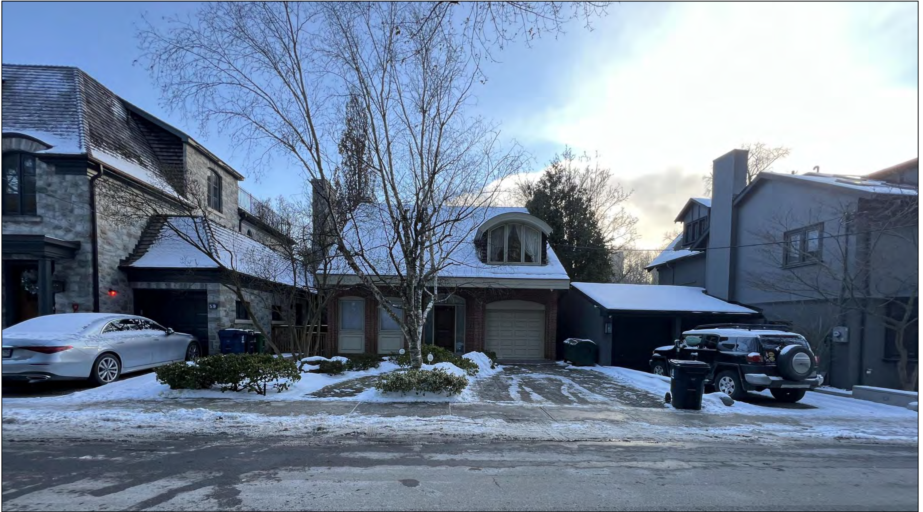
Original Architect: unknown Constructed: post-1967 Designation: Unrated