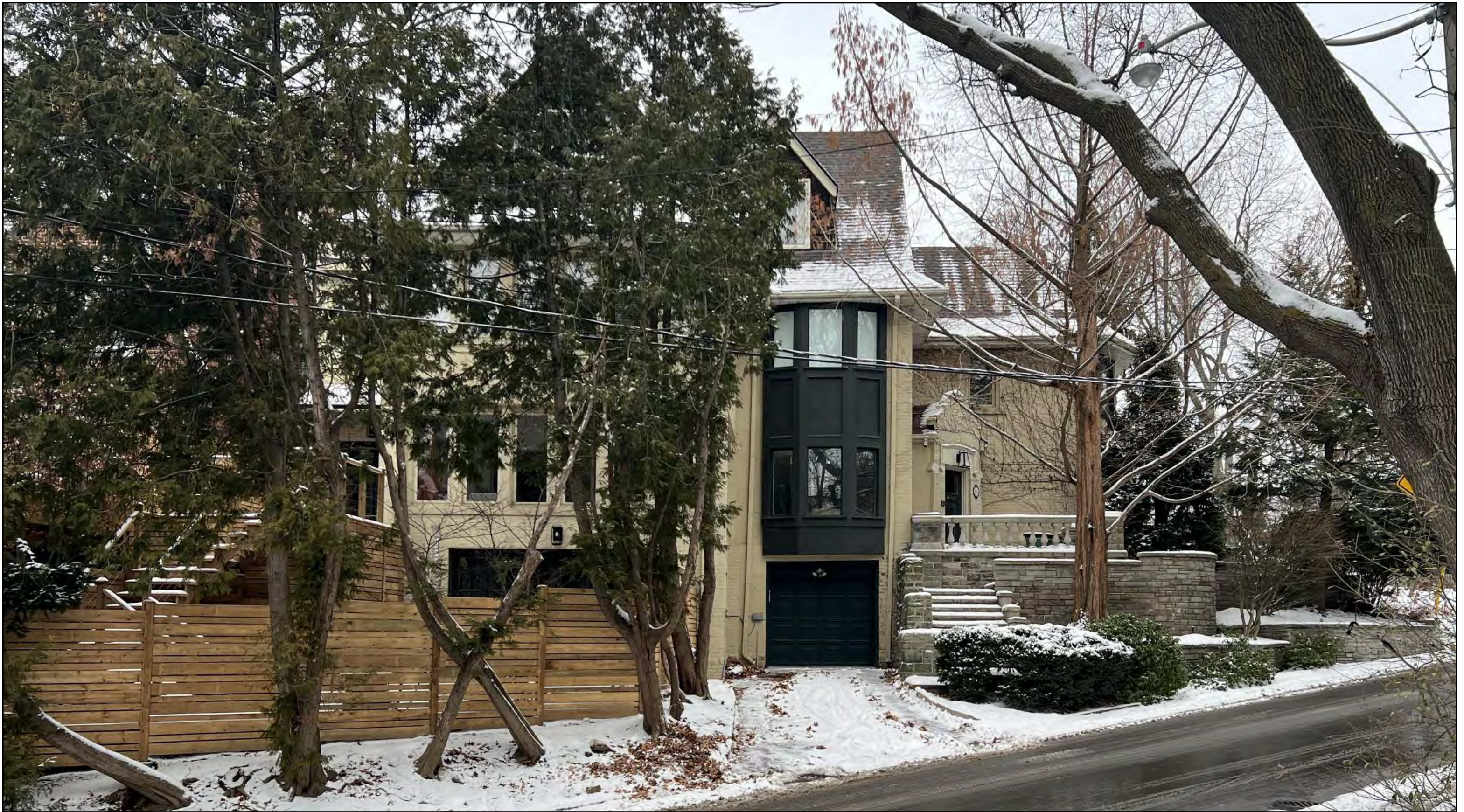
Original Architect: unknown Constructed: c. 1911 Designation: C rated