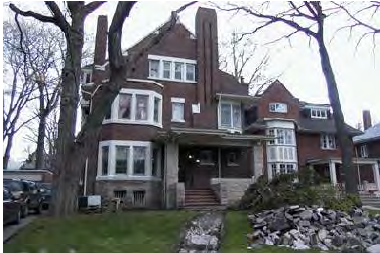
Figure 13: 112 Roxborough (1914) (C rating: good example of style, contributed to heritage character)

Many North Rosedale homes are built in this period, the majority of which are located south of Summerhill Avenue. The dominant style here is Edwardian classicism, however some fine Arts and Crafts designs are located throughout.