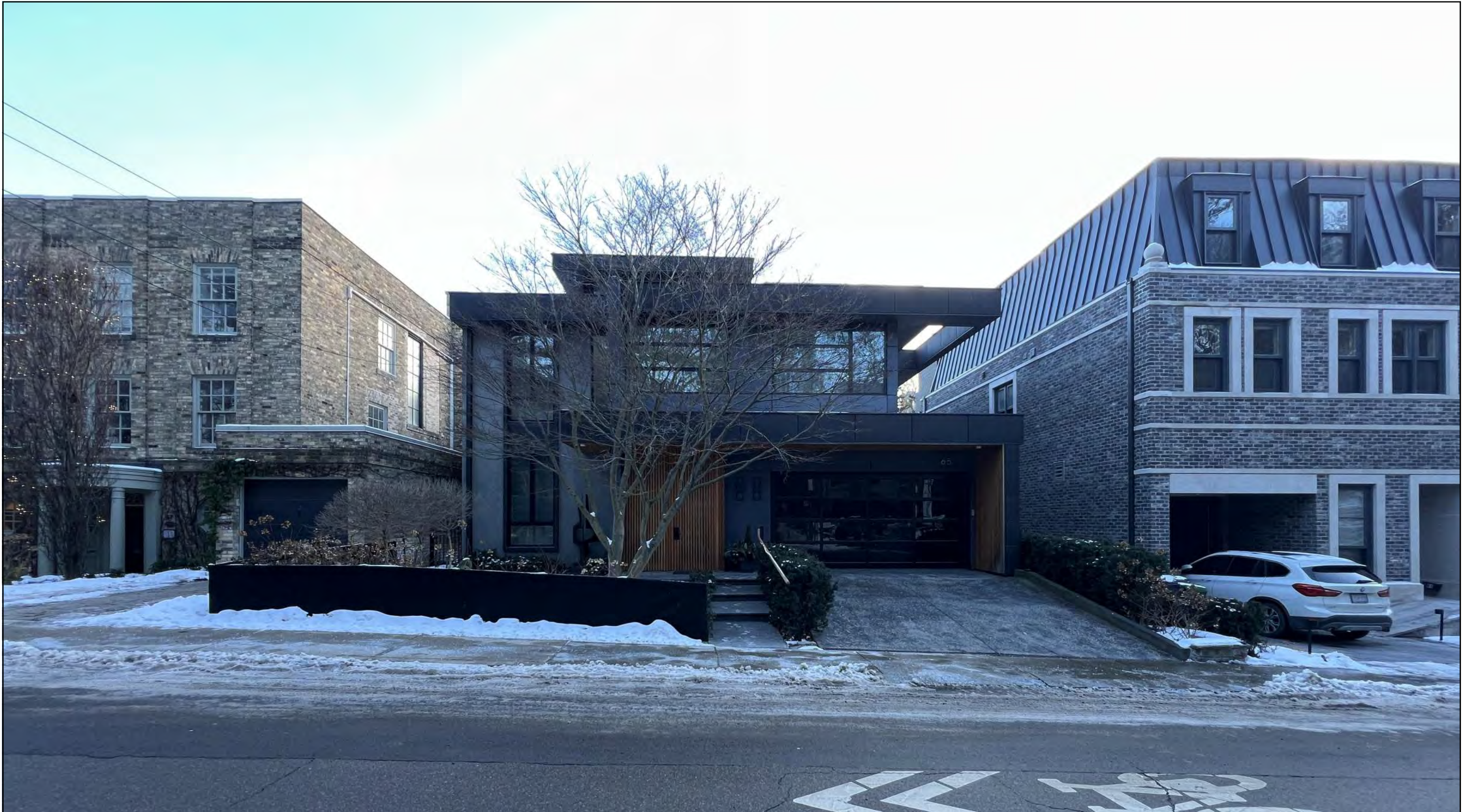
Original Architect: Edouardo A. Ortiz / architecture unfolded inc. Constructed: c. 2016 Designation: Unrated