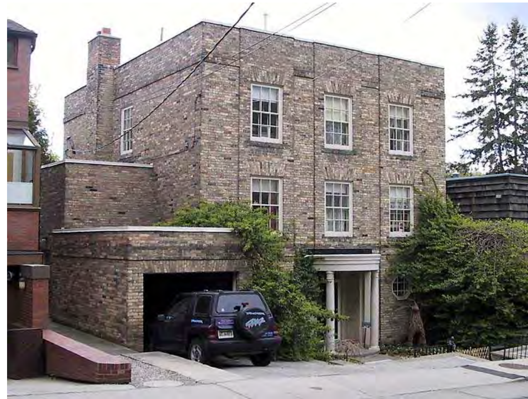
Figure 15: 67 Roxborough Drive (Mackenzie Waters, 1935) (B rating: prominent location; prominent architect; interesting/rare example of style).

In this period, domestic architecture began to respond to the influence of modernity and its machine aesthetics, exhibiting a more reductive expression than the previous architectural period. The styles have recognizably Tudor and Georgian forms, but are reduced and geometrized, and sometimes display Art Deco and Art Moderne influences.