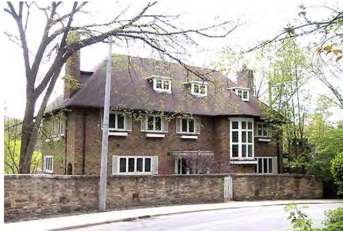
Figure 14: 93 Roxborough Drive (Alfred Chapman - designed and occupied - 1927) (B rating: Prominent location; prominent architect; good example of style)

The desire for Canadian influence in art and architecture was strongly felt in this post-war period. Most Victorian decorative exuberance was rejected, perhaps a result of the sobering trauma of the war and its sacrifices. Refined and still largely academic Tudor and Georgian styles are common. There was a proliferation of pattern books for houses in this period (refer Appendix 3).