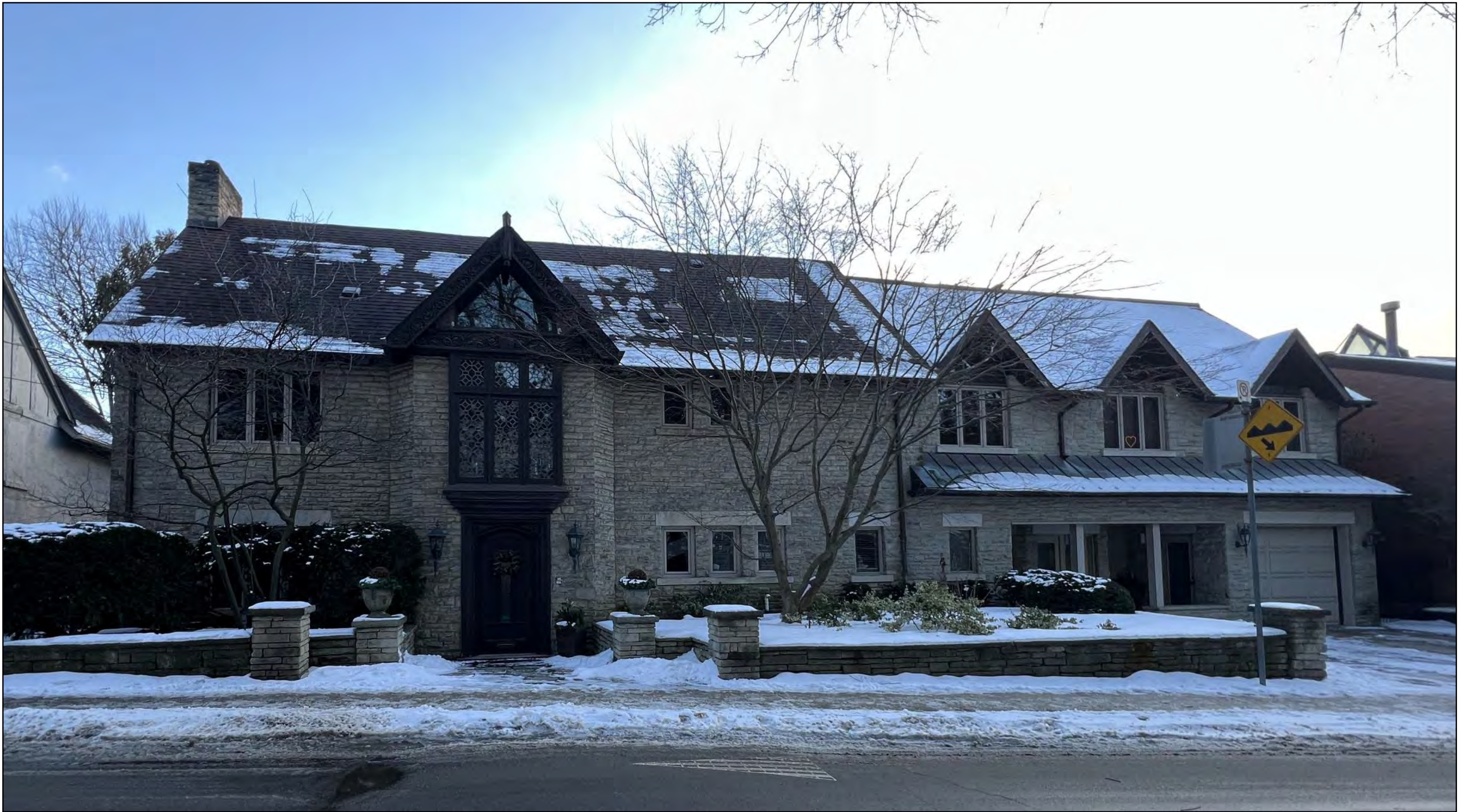
Original Architect: Alfred Chapman Constructed: c. 1915 Designation: C rated