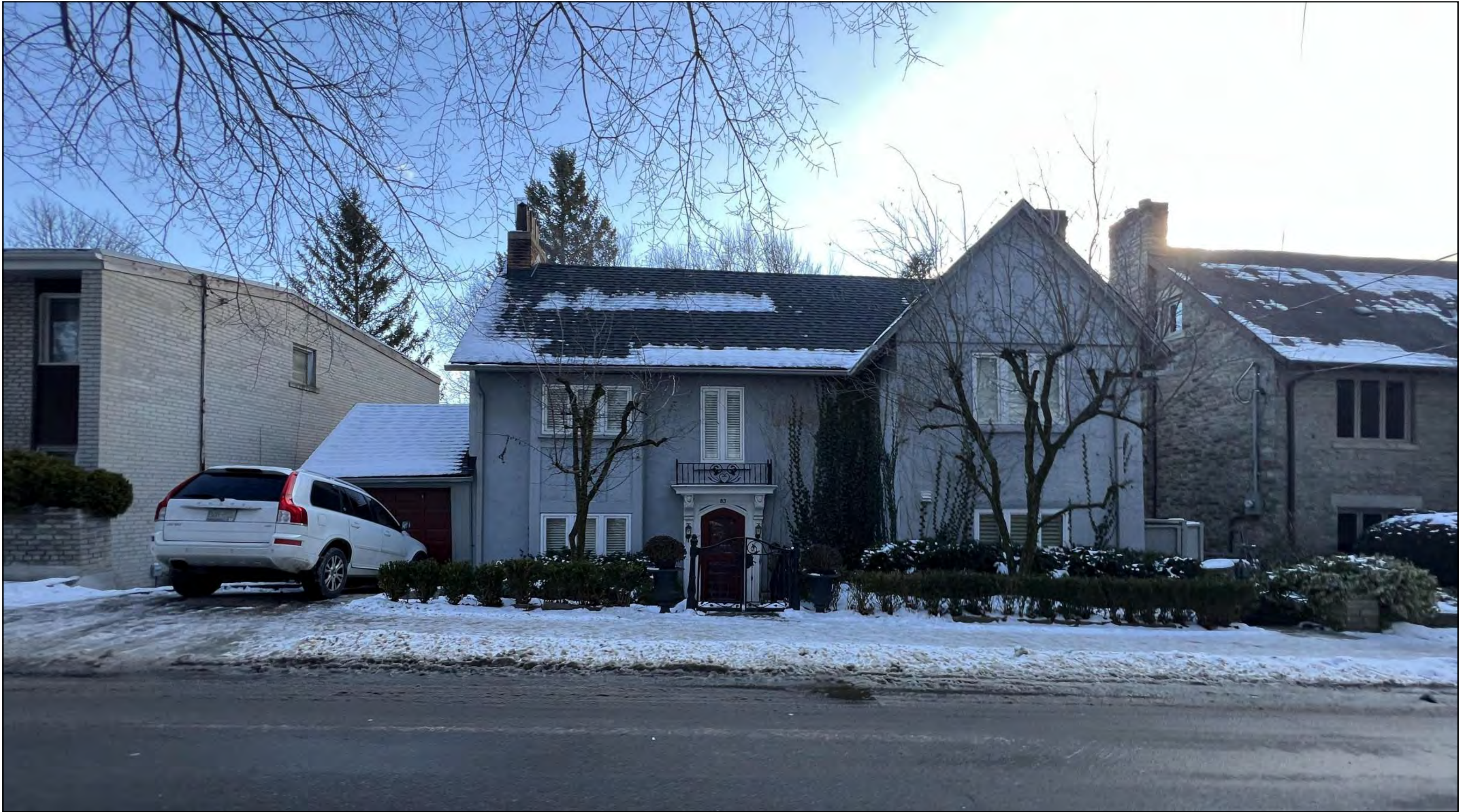
Original Architect: Alfred Chapman Constructed: c. 1915 Designation: C rated