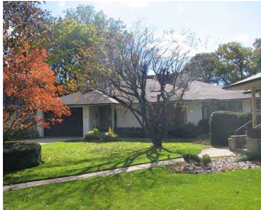
Figure 16: 1 Douglas Drive (1956) (unrated; too recent to be evaluated in terms of heritage significance)

Development in this period is characterized by modern ranch style homes. Additionally, some extreme renovations of older homes replaced historical detail.