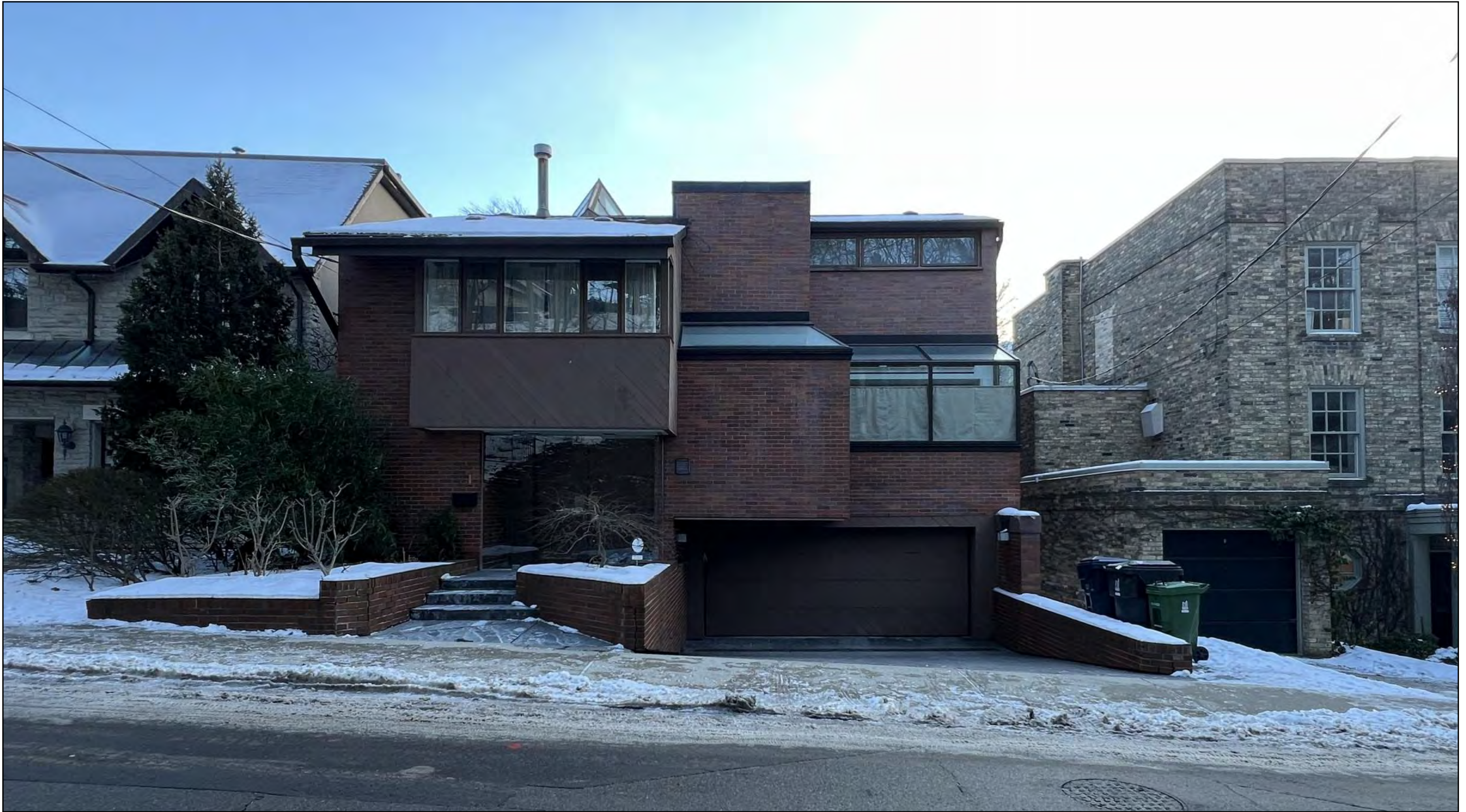
Original Architect: unknown Constructed: post-1967 Designation: C rated