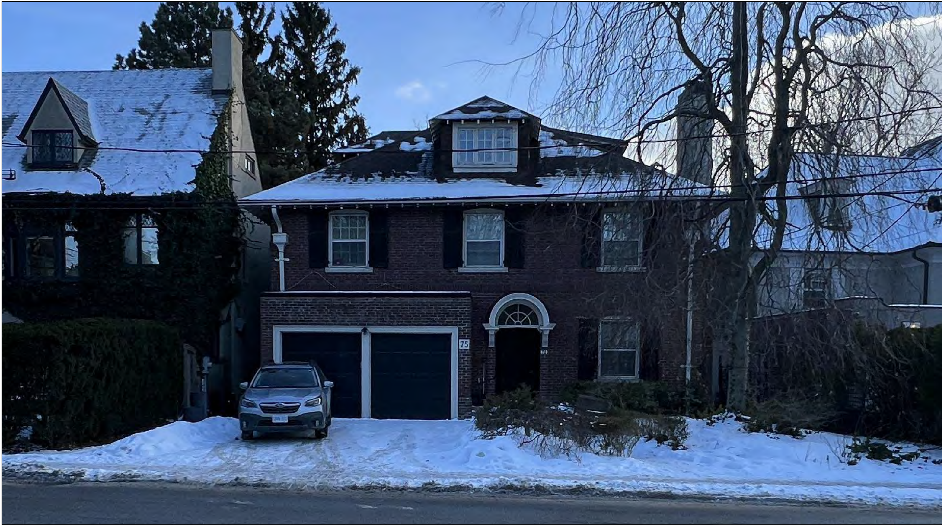
Original Architect: Molesworth, West & Secord Constructed: c. 1923 Designation: C rated