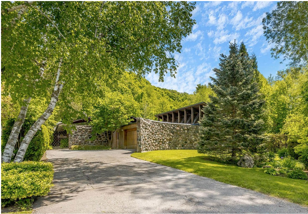
36 Green Valley Road (Sotheby's Realty Canada, 2024).