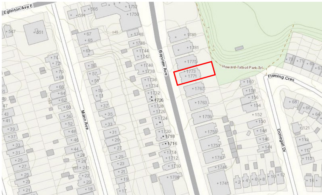
1771 and 1773 Bayview Avenue (outlined in red).

Note: This location map is for information purposes only; the exact boundaries of the property are not shown (City of Toronto Mapping).