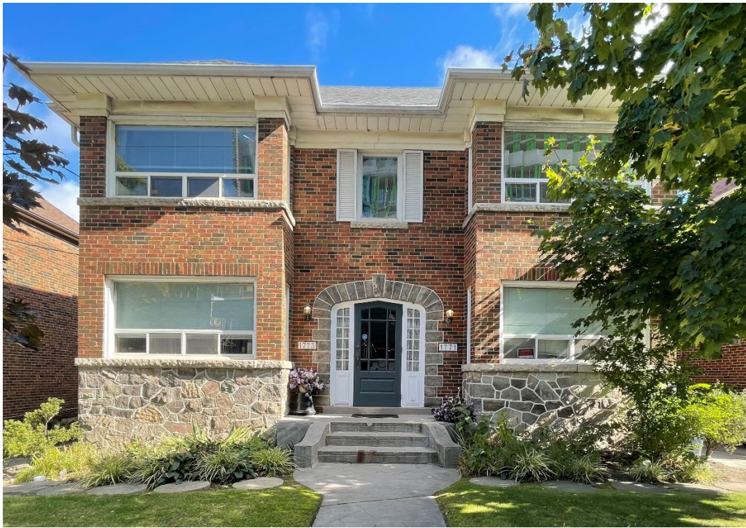
1771 and 1773 Bayview Avenue (Heritage Planning, 2024).