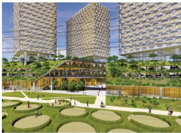
2444 Eglinton Avenue East Rendering