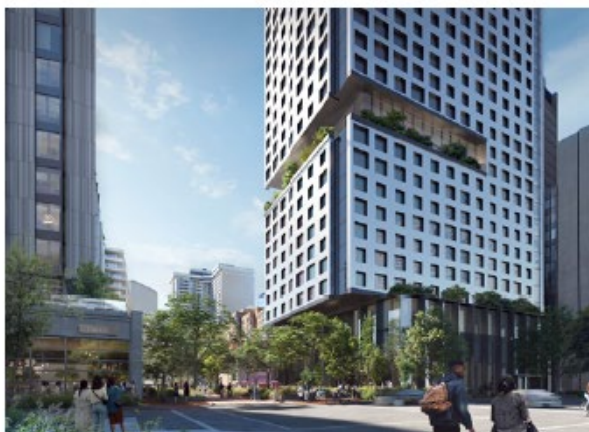
610 Bay Street Rendering