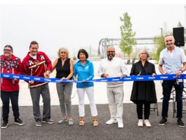
Leslie Lookout Park Opening Event

Over the past year, CreateTO has made significant progress working with our partners as we continue to embark on a transformative chapter in the Port Lands – creating opportunities for housing, vibrant community spaces and new destinations.