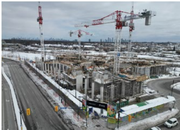
Bloor-Kipling Block 1 Construction