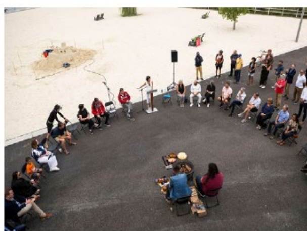
Leslie Lookout Park Indigenous Ceremony