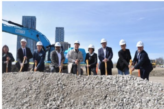
Etobicoke Civic Centre Groundbreaking