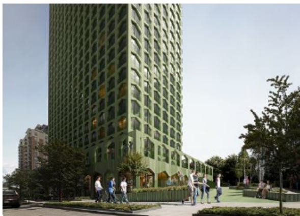
275 Merton Street Rendering