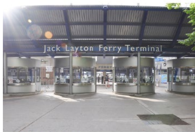
Jack Layton Ferry Terminal

Working with our City partners, our team is continually analyzing the City's real estate portfolio to explore new ways to make better use of the City's real estate assets. This work is key to providing the City's Divisions, Agencies, and Corporations with opportunities to address their program needs so they can better serve the people of Toronto.