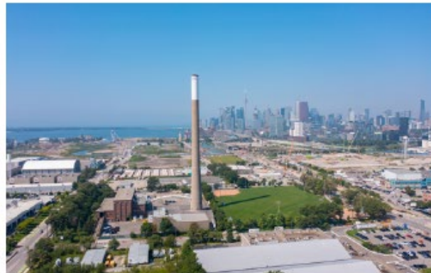
Aerial image of McCleary District