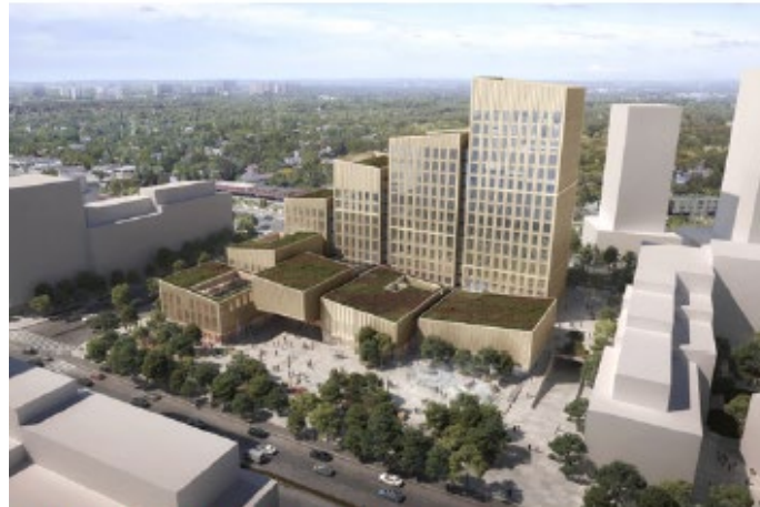
Rendering of Etobicoke Civic Centre