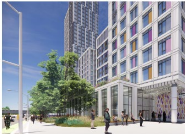
777 Victoria Park Avenue Rendering