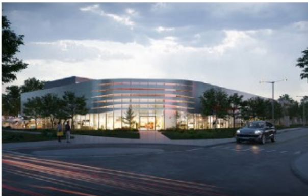
Rendering of Automotive Dealership at 190 Cherry Street