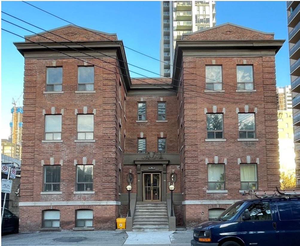
84 Maitland Street (Heritage Planning, 2024).