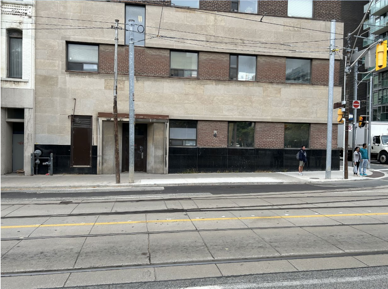
Church Street Entrance of 67 Adelaide Street East