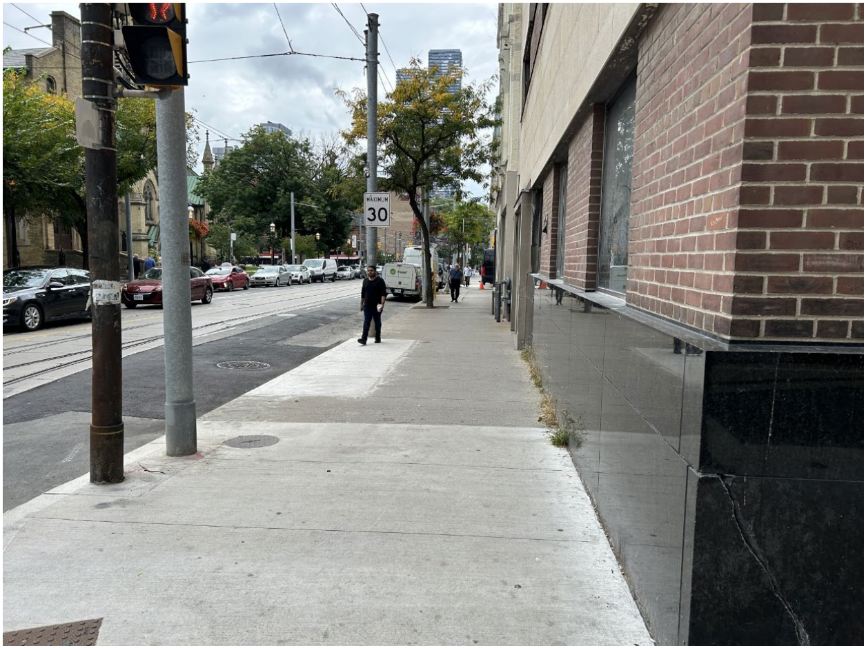
Looking north on Church Street from Adelaide Street East