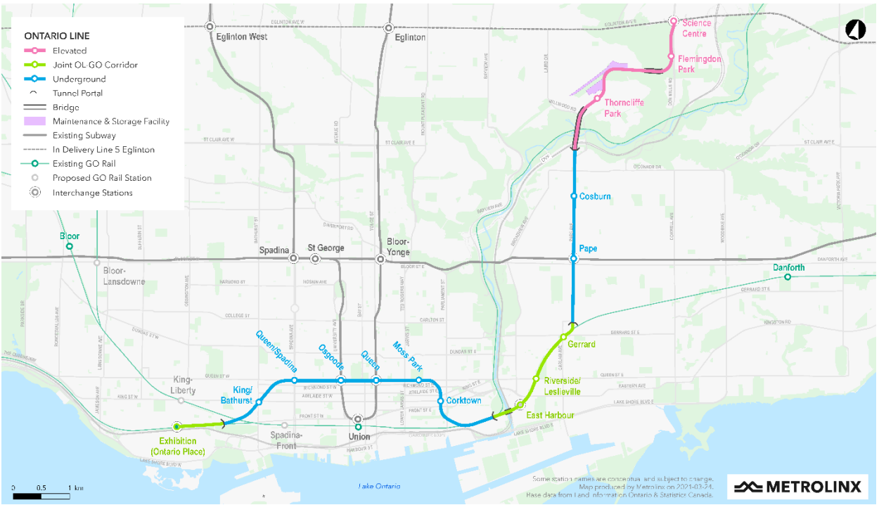
Figure 1: Ontario Line Alignment (Including the joint Ontario Line-GO corridor)