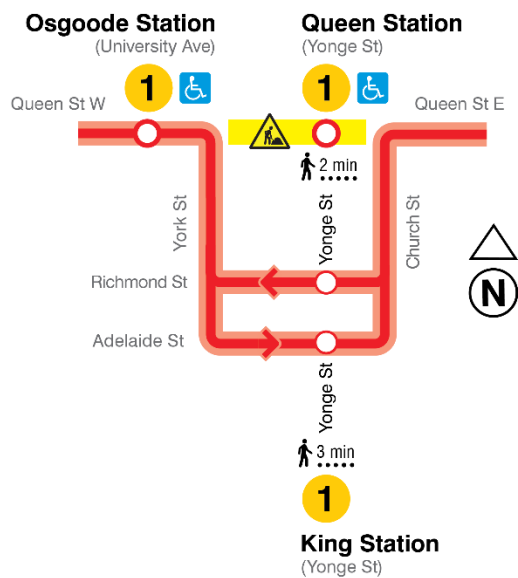
Figure 4: TTC 501/301 Queen Streetcar Routing