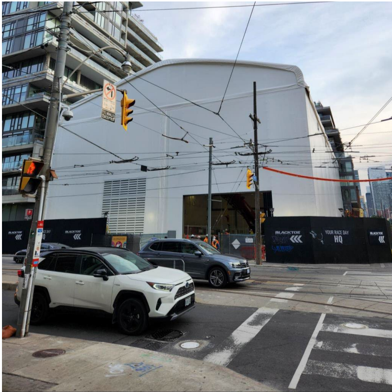
Figure 5: Exterior of King/Bathurst acoustic shelter