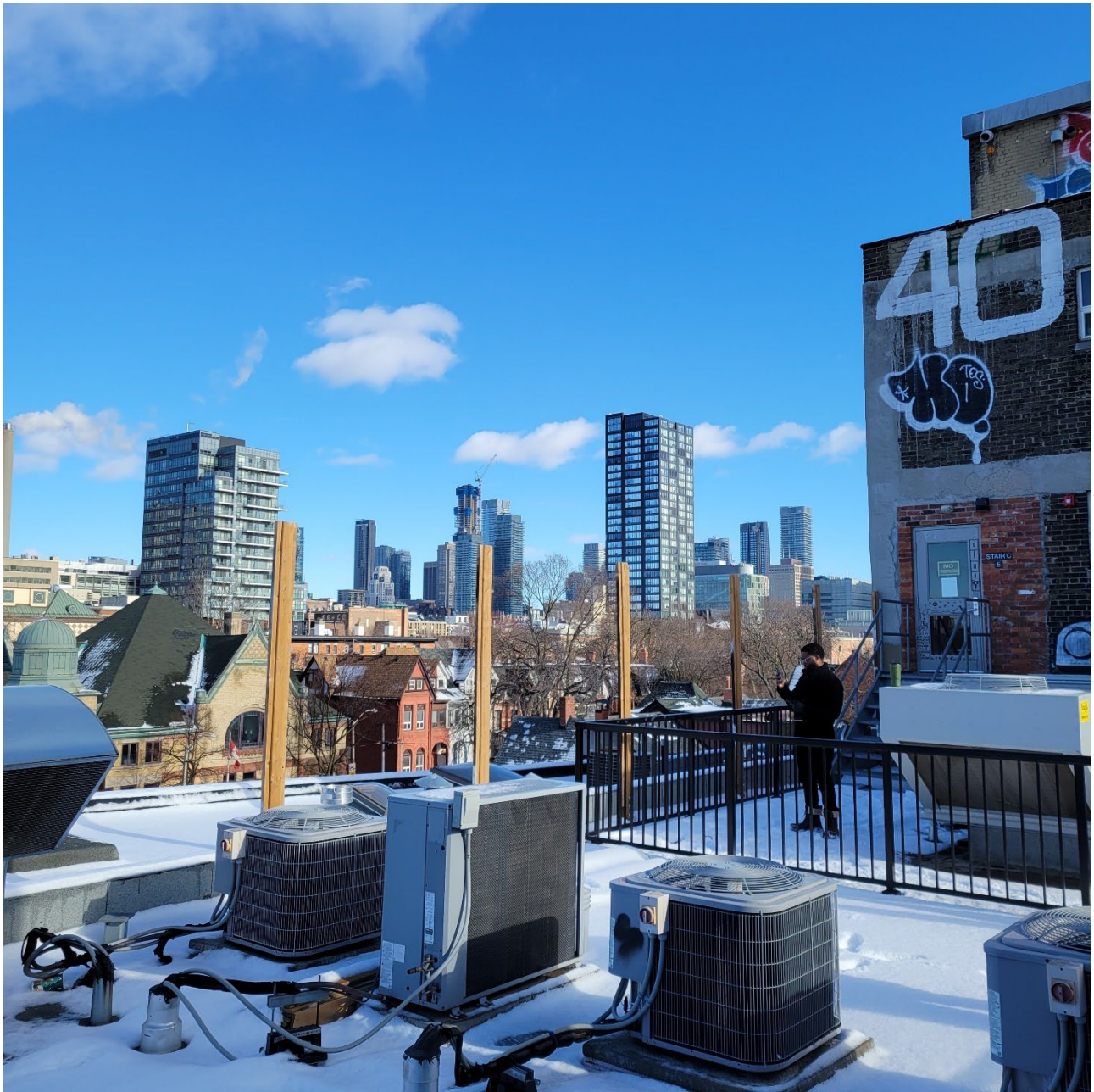
Attachment 7: Fence posts on the north side of the building looking northeast, height of posts pictured is 2.6m, measured from the top of post to the floor.