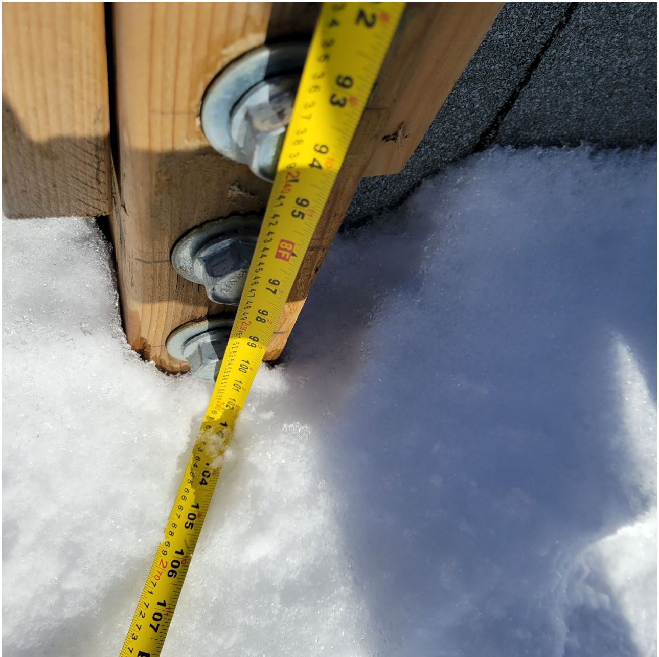
Attachment 9: Fence post on the north side of the building, height of post is 2.6m, measured from the top of post to the floor.