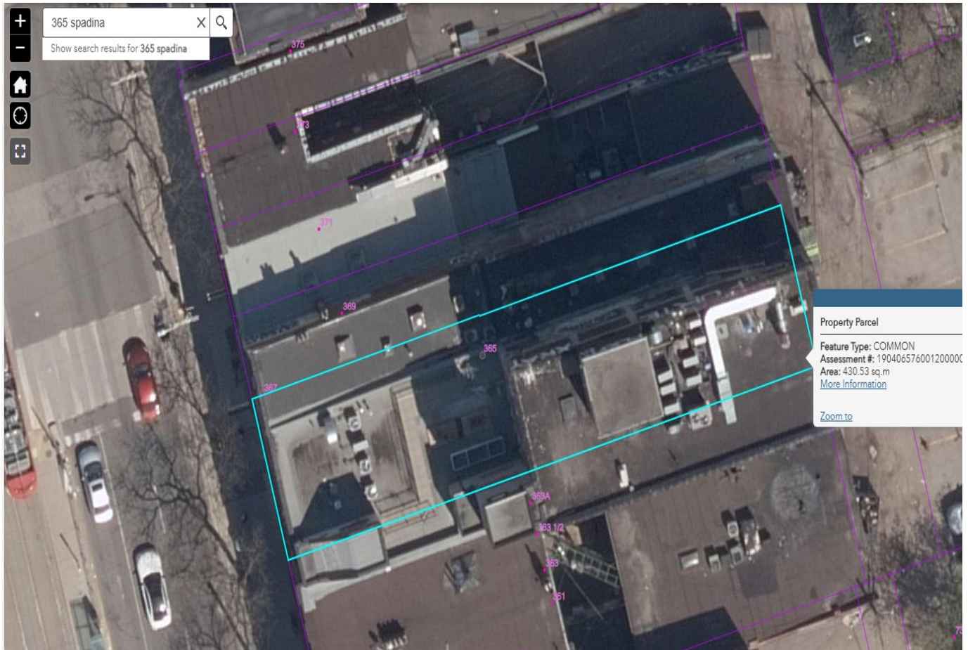
Attachment 2: iView Map of Property with satellite image – 365 Spadina Ave. - City of Toronto.