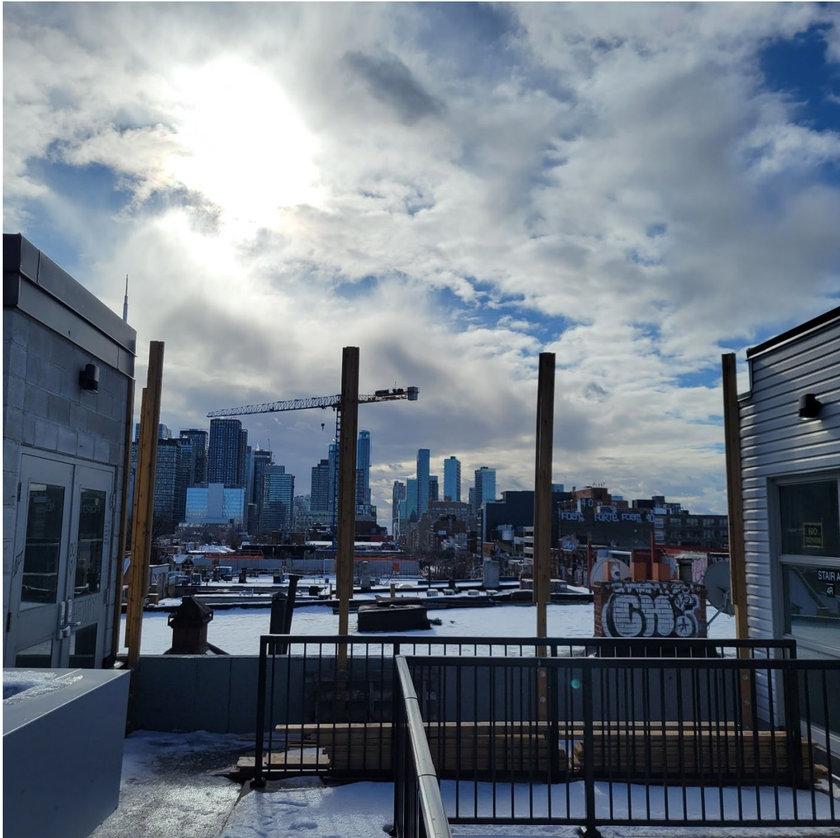
Attachment 4: Fence posts on the south side of the building looking south, height of posts is 3.66m, measured from the floor to the top of post.