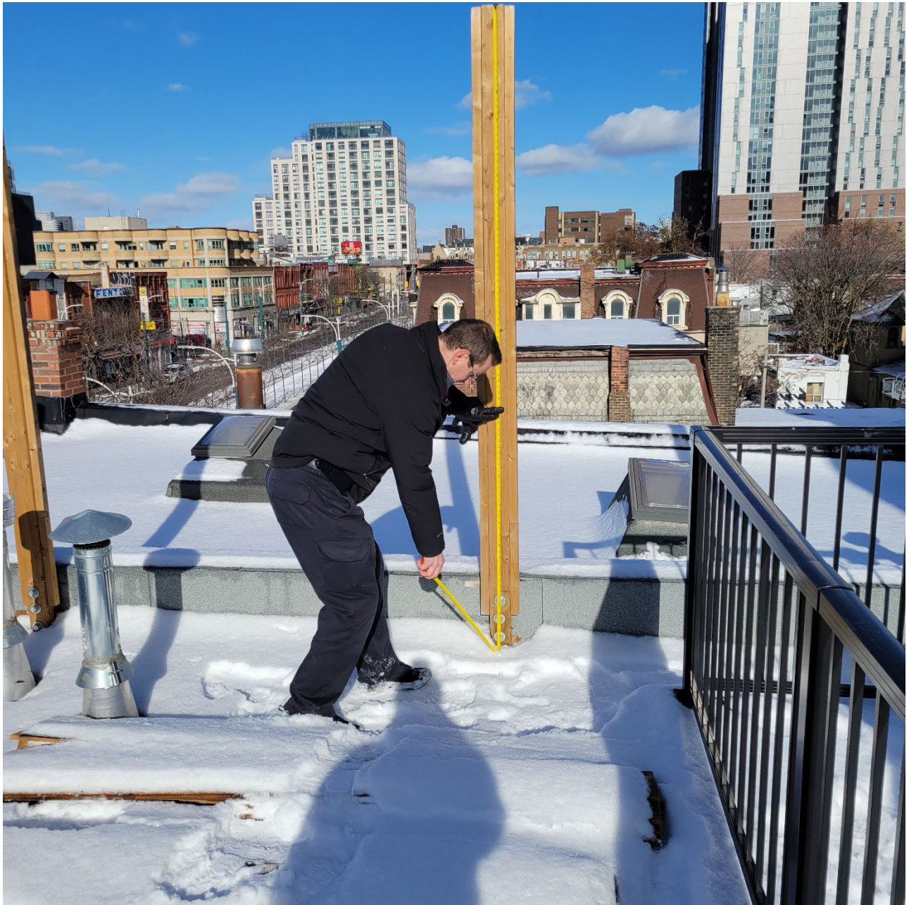
Attachment 8: Fence post on the north side of the building looking north, height of post is 2.6m, measured from the top of post to the floor.