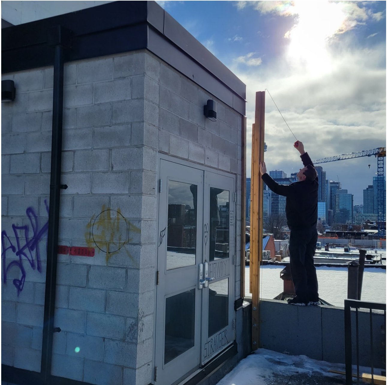
Attachment 5: Fence post on the south side of the building looking south, height of post is 3.66m, measured from the floor to the top of post.