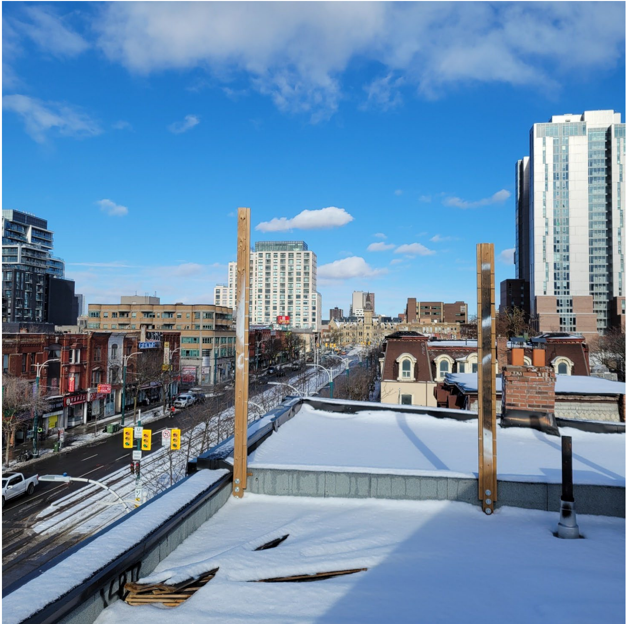
Attachment 6: Fence posts on the north side of the building looking north, height of posts is 2.97m and 2.6m, measured from the top of post to the floor.