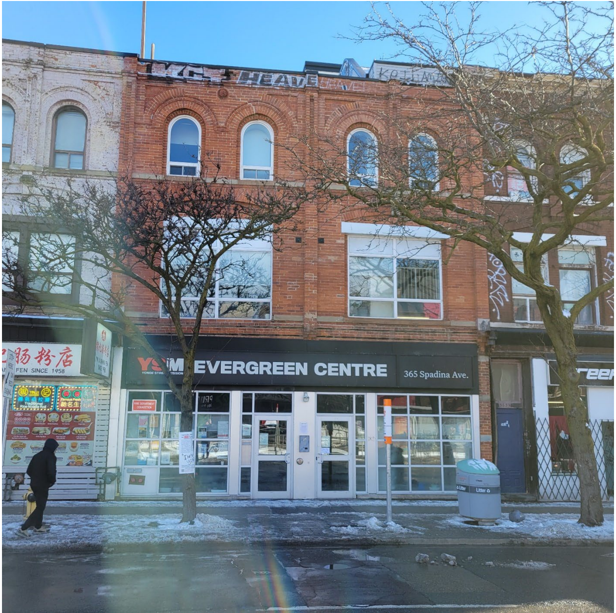
Attachment 3: Photograph taken from Spadina Ave median of 365 Spadina Ave.