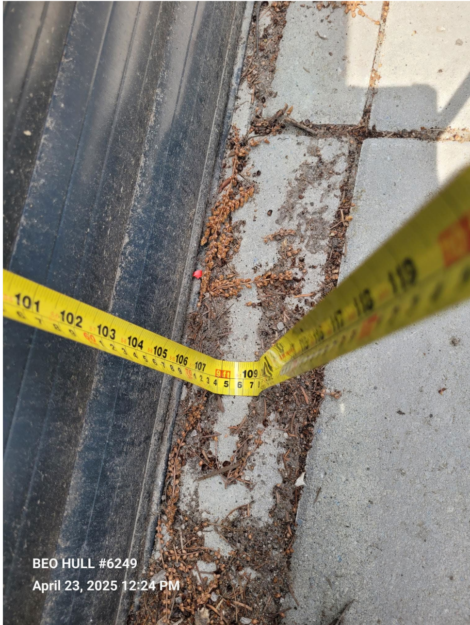
Attachment 6: Zoomed In - Rear Yard - East Fence – Measurements – 2.743 metres