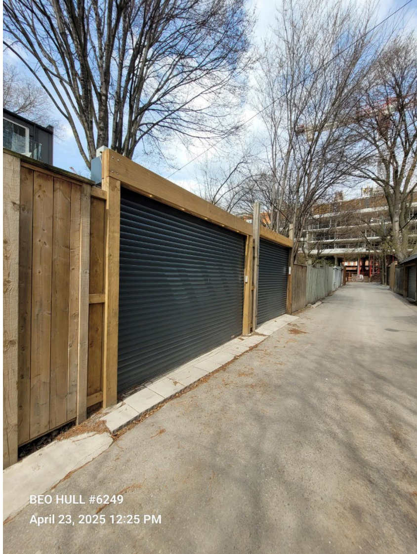
Attachment 3: Rear Yard - East Fence - Facing North