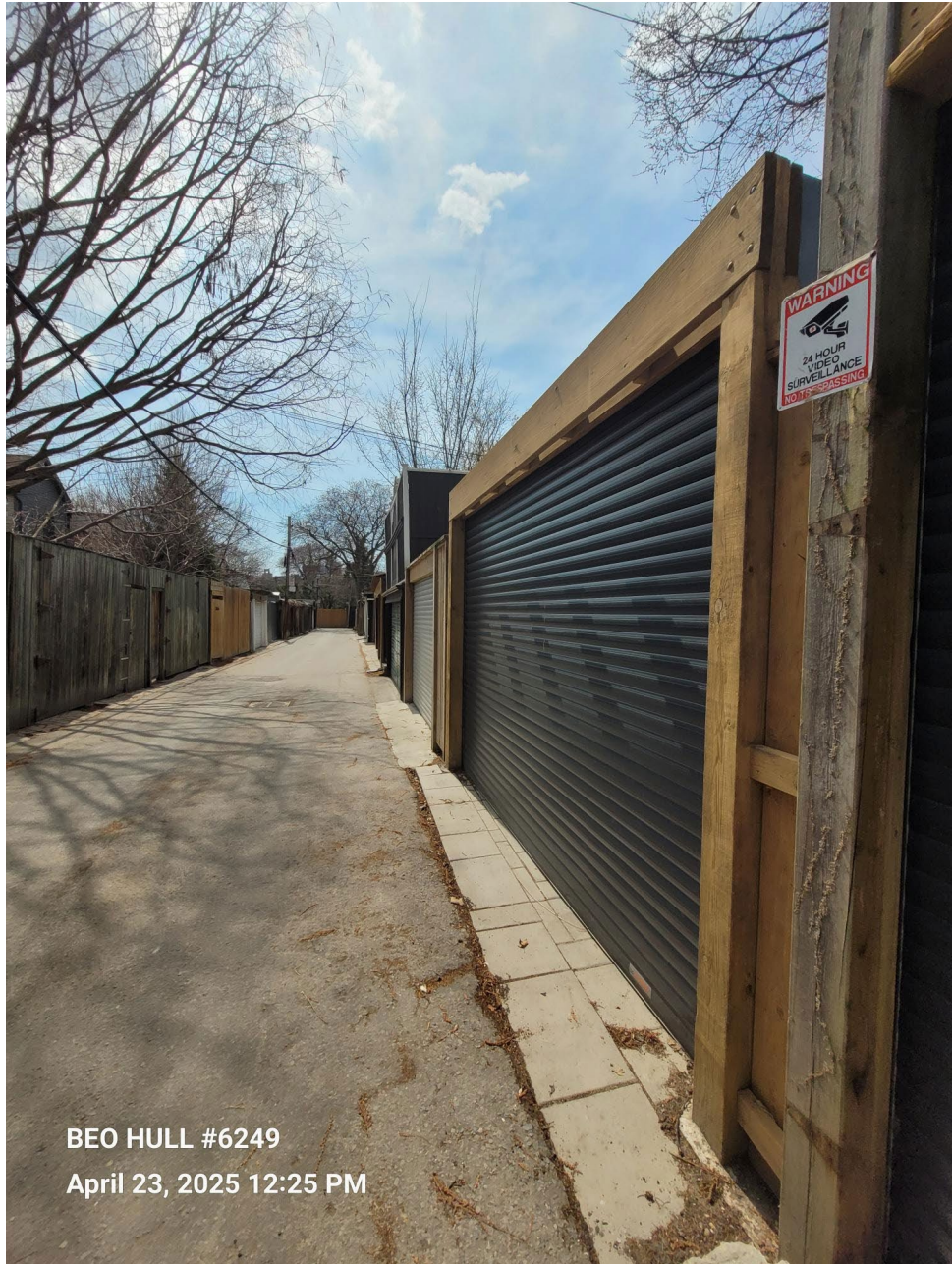
Attachment 4: Rear Yard - East Fence - Facing South