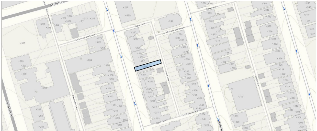
Attachment 2 GIS view – 255 Seaton Street