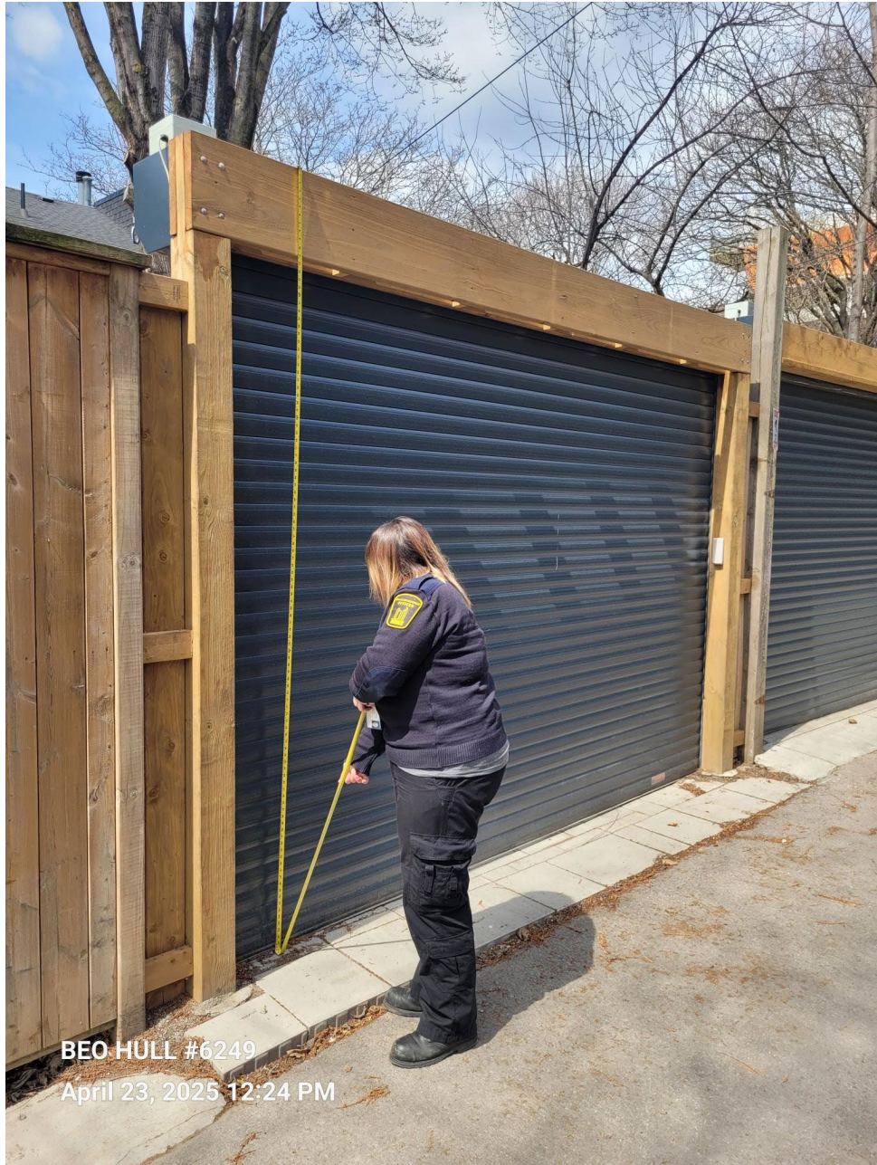
Attachment 5: Zoomed Out View - Rear Yard - East Fence – Measurements