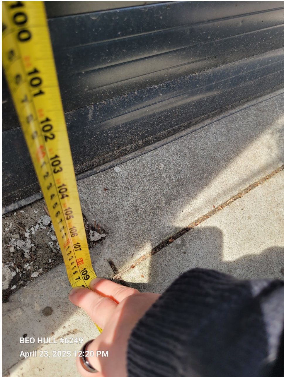
Attachment 6: Rear Yard - East Fence - Zoomed In – Measurements 2.769 metres