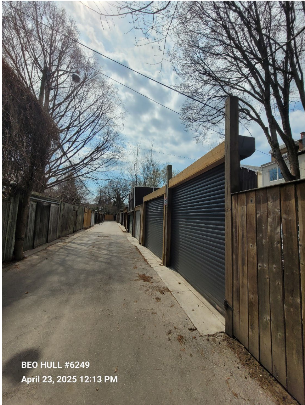
Attachment 3: Rear Yard - East Fence - Facing South