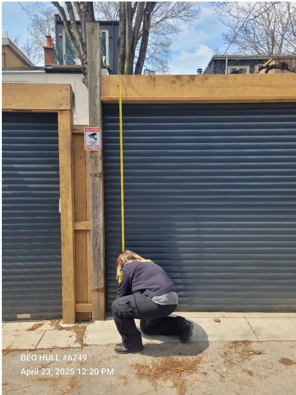
Attachment 5: Rear Yard - East Fence - Zoomed Out – Measurements 2.769 metres