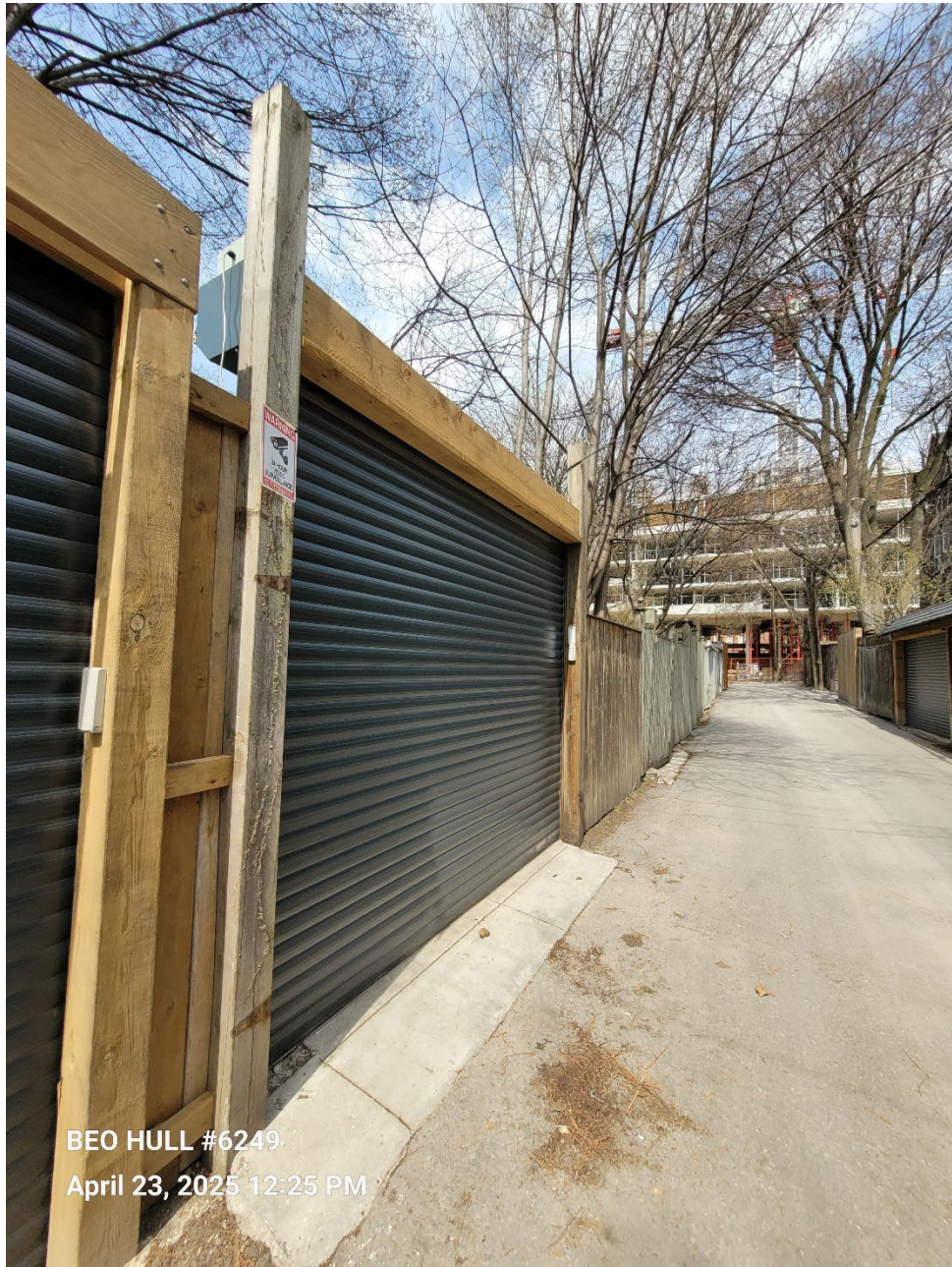
Attachment 4: Rear Yard - East Fence - Facing North