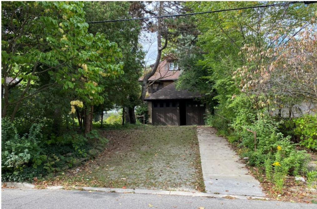
Figure 2: View of the existing dwelling and driveway from Cluny Drive.

The Subject Site is currently occupied by a 3-storey single-detached dwelling. The current dwelling is oriented along the northern lot line, with the primary entrance perpendicular to the street, facing the southern landscaped area, and an attached garage fronting Cluny Drive. Private parking is provided in the aforementioned garage and accessed by a gravel driveway from Cluny Drive ( Figure 2 ).