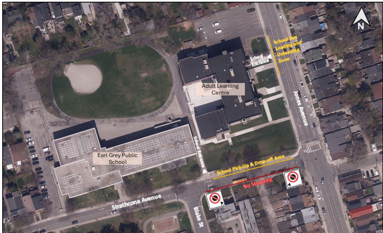
Figure 2 – Temporary School Pick-up and Drop-off Zones

Strathcona Avenue, between Jones Avenue and Blake Street and the temporary school bus loading zone on Jones Avenue.