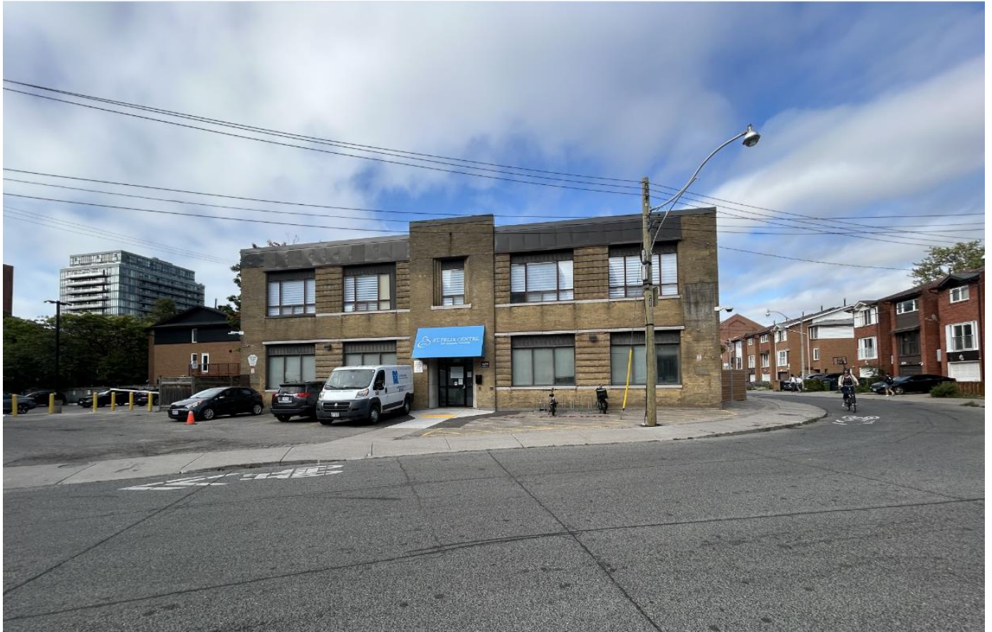
Front of building at 629 Adelaide St W, looking west