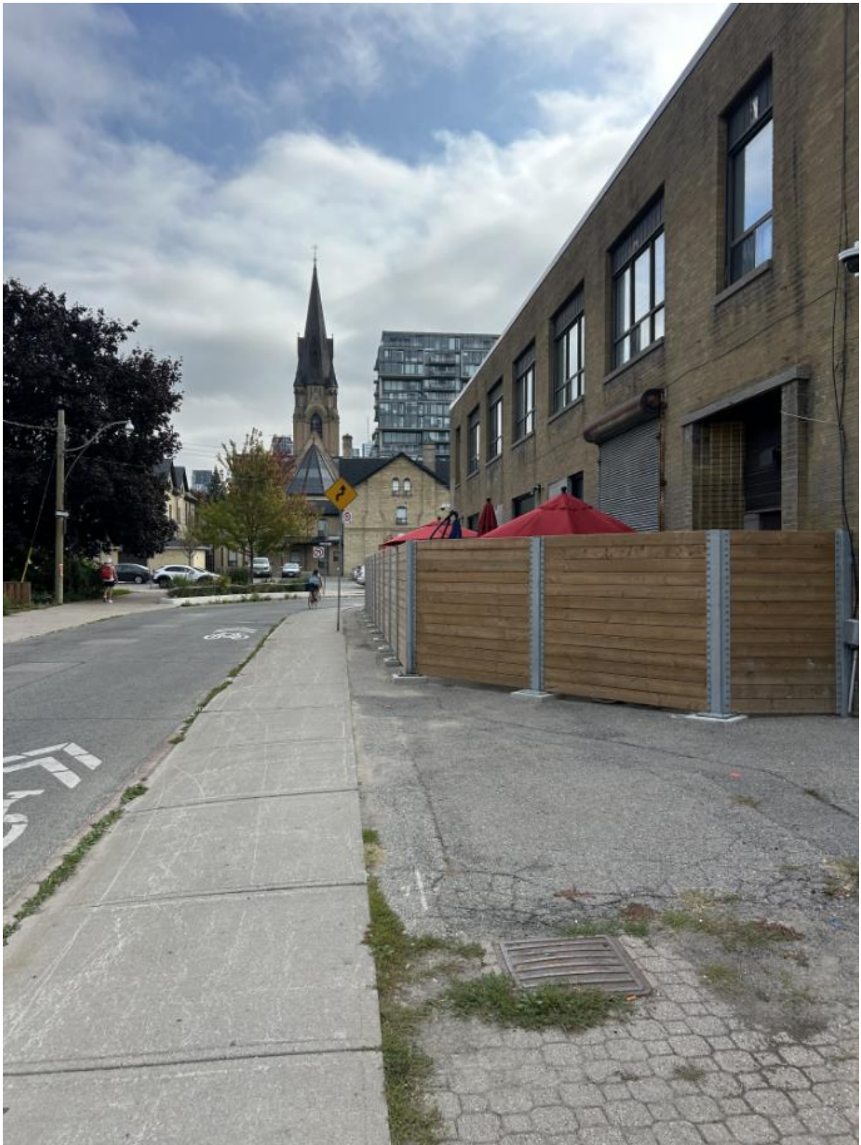
Flank of 629 Adelaide St W, looking east