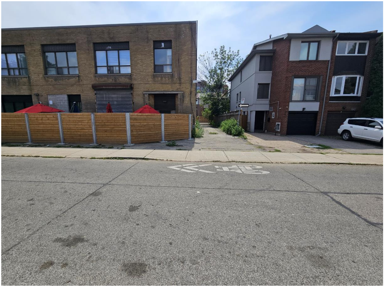
Flank of 629 Adelaide St W, looking south at the north-south lane