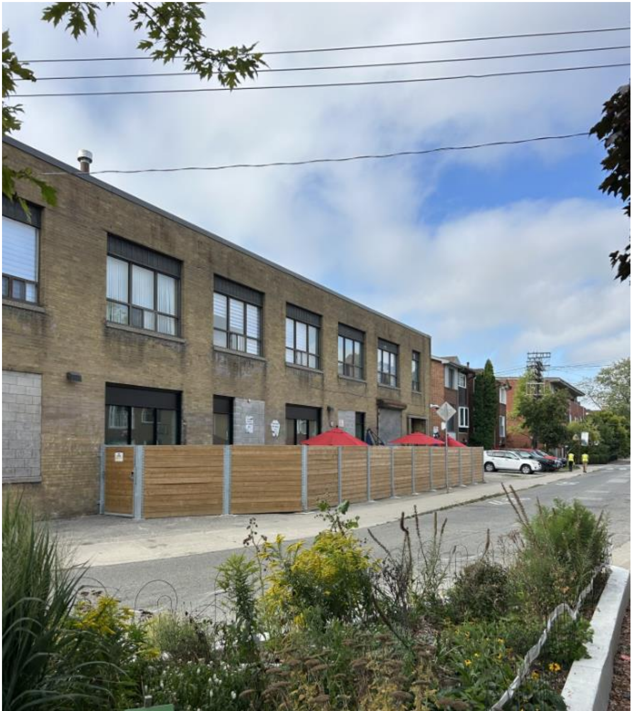
Flank of 629 Adelaide St W, looking southwest