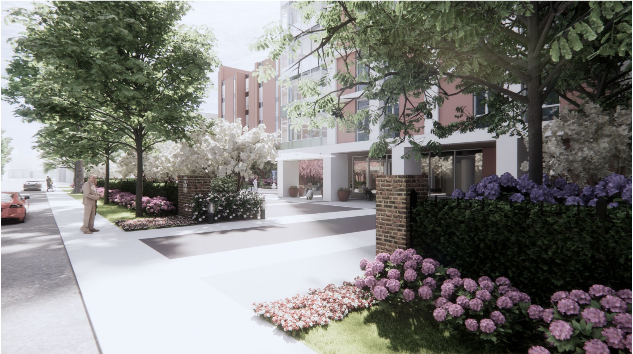
9 Perspective View of Proposed Main Entrance Looking Southeast