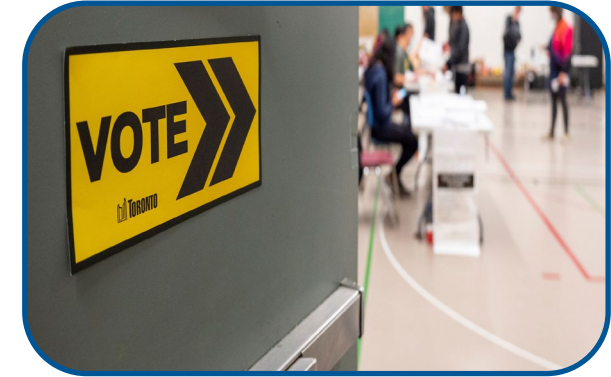
Democracy & Election Engagement