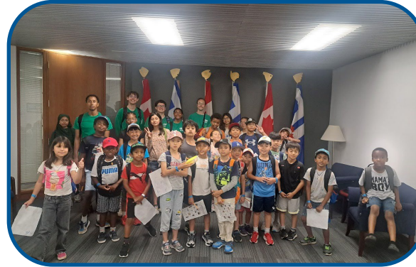
Tours of City Hall