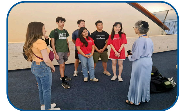
School and Curriculum Connections