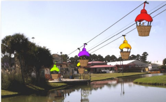
Image 1 - Artistic Rendering of SkyPod Experience