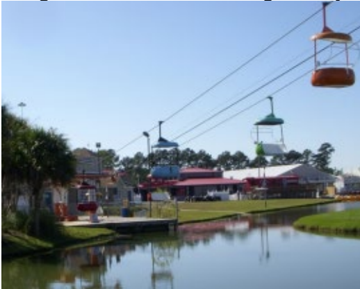
Image 2 - Photo Example of SkyPod Experience at External Location