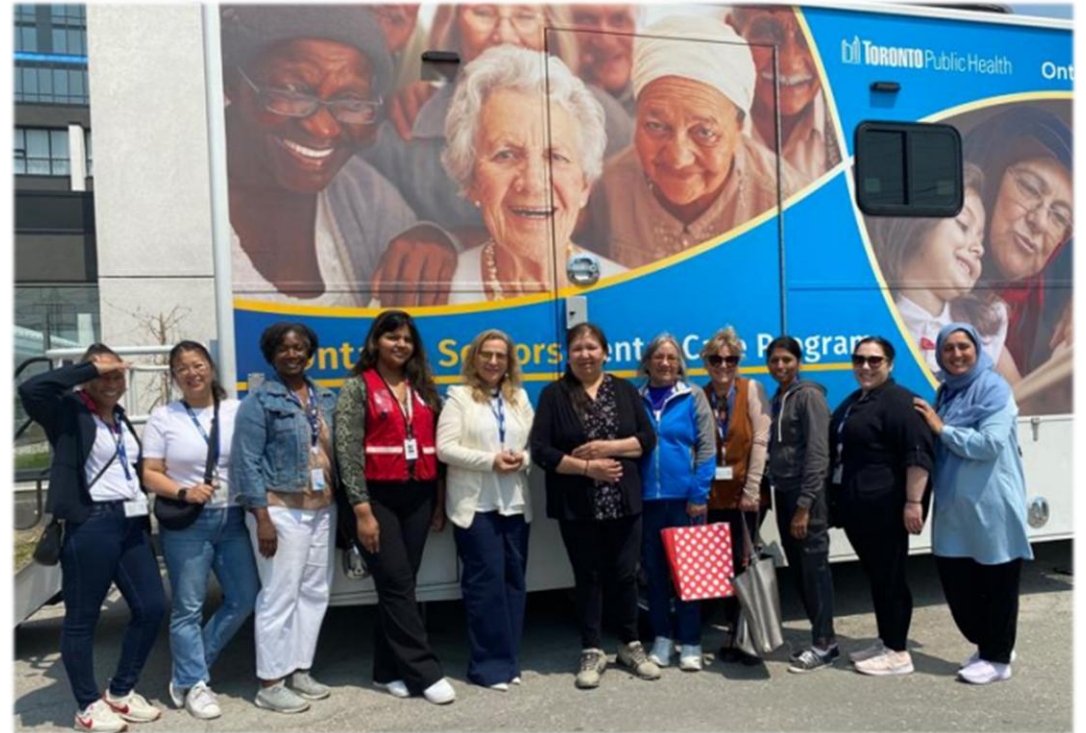
TPH Dental Team standing in front of the TPH mobile clinic as part of the 2025 evacuation response