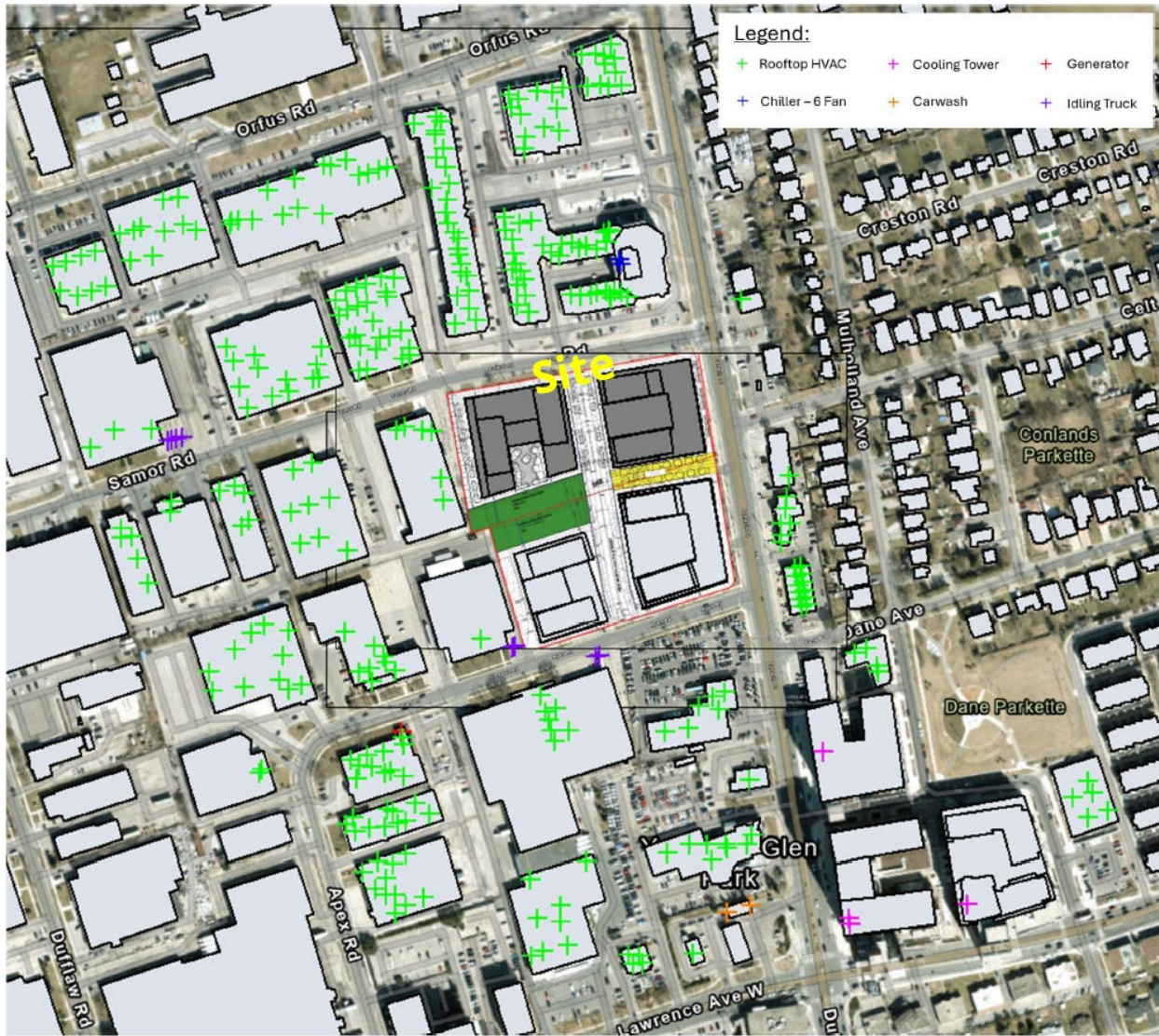
Figure 4a: Sources Included in the Stationary Sources Noise Model