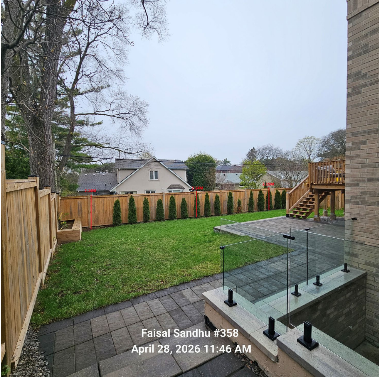
Attachment 2: Photograph - 28 Ternhill Crescent – Rear yard – west fence – Average height labelled. Posts measured from subject property starting from the south side (left to right), 2.01M, 2.01M 2.03M.