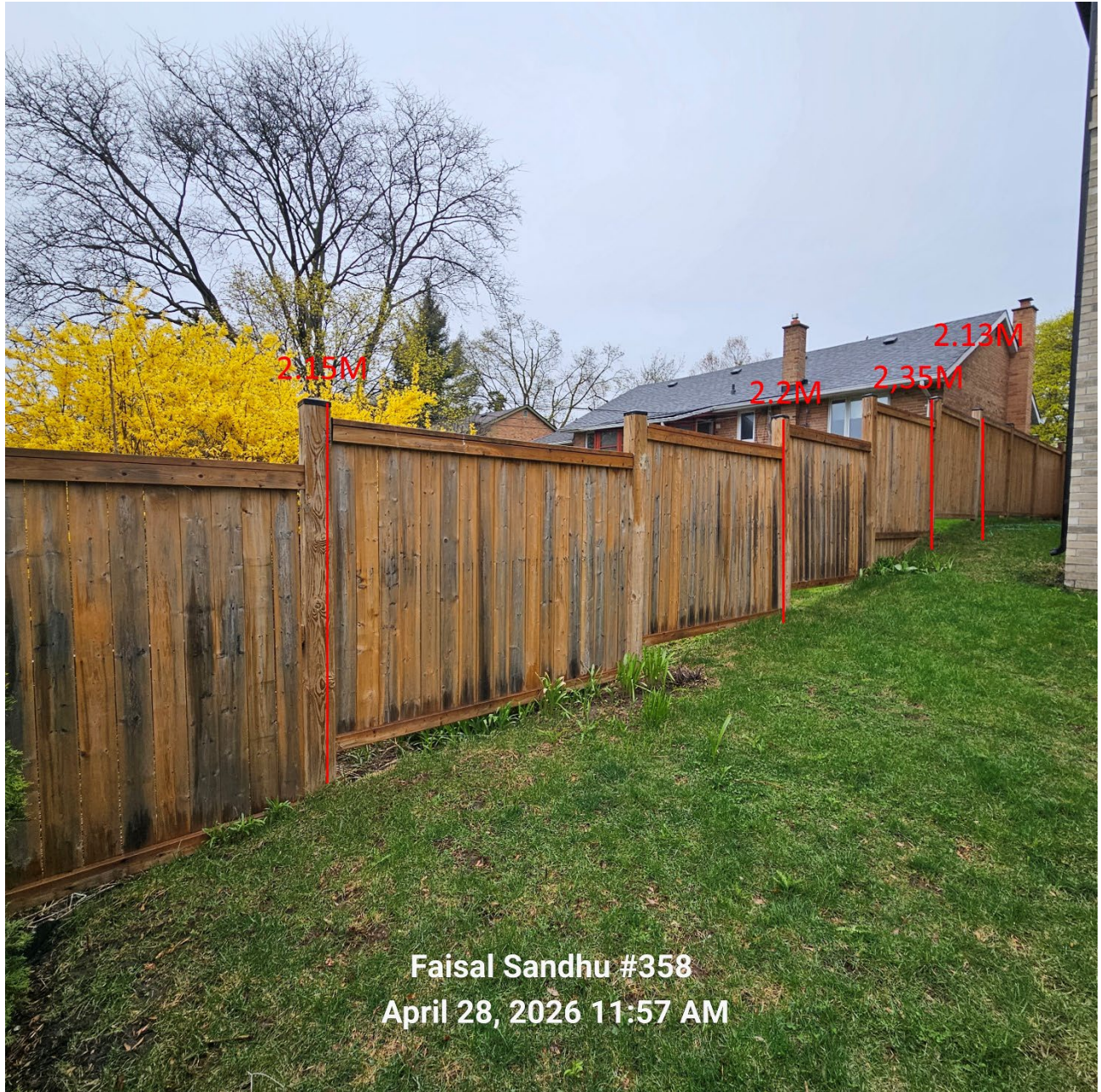
Attachment 5: Photograph – 28 Ternhill Crescent – North side, taken from inside rear yard. Average height labelled. Inside height post measured starting from lowest grade: 2.05M, 2.13M, 2.08M, 2.16M