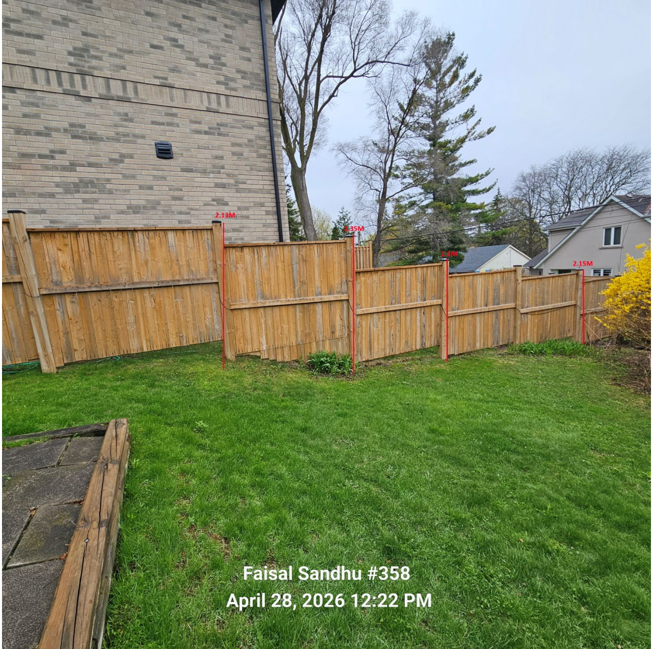
Attachment 4: Photograph - 28 Ternhill Crescent rear yard, north side taken from 30 Ternhill Crescent with labelled average height. Outside height of posts starting from lowest grade: 2.26M, 2.31M, 2.63M, 2.11M