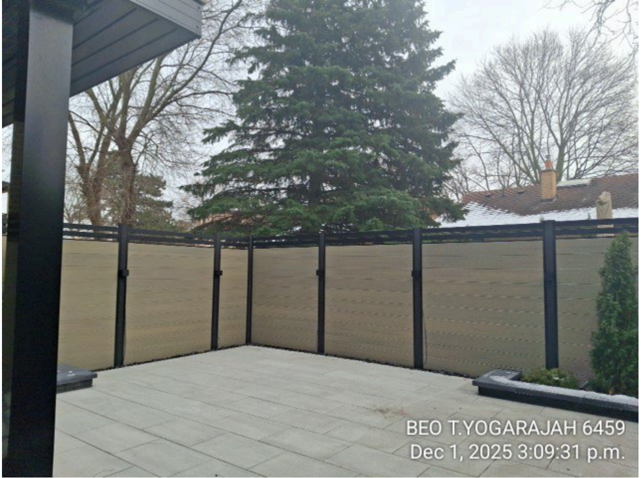
Attachment 2: 17 Hollyhock Officer's photo of rear yard – facing south east