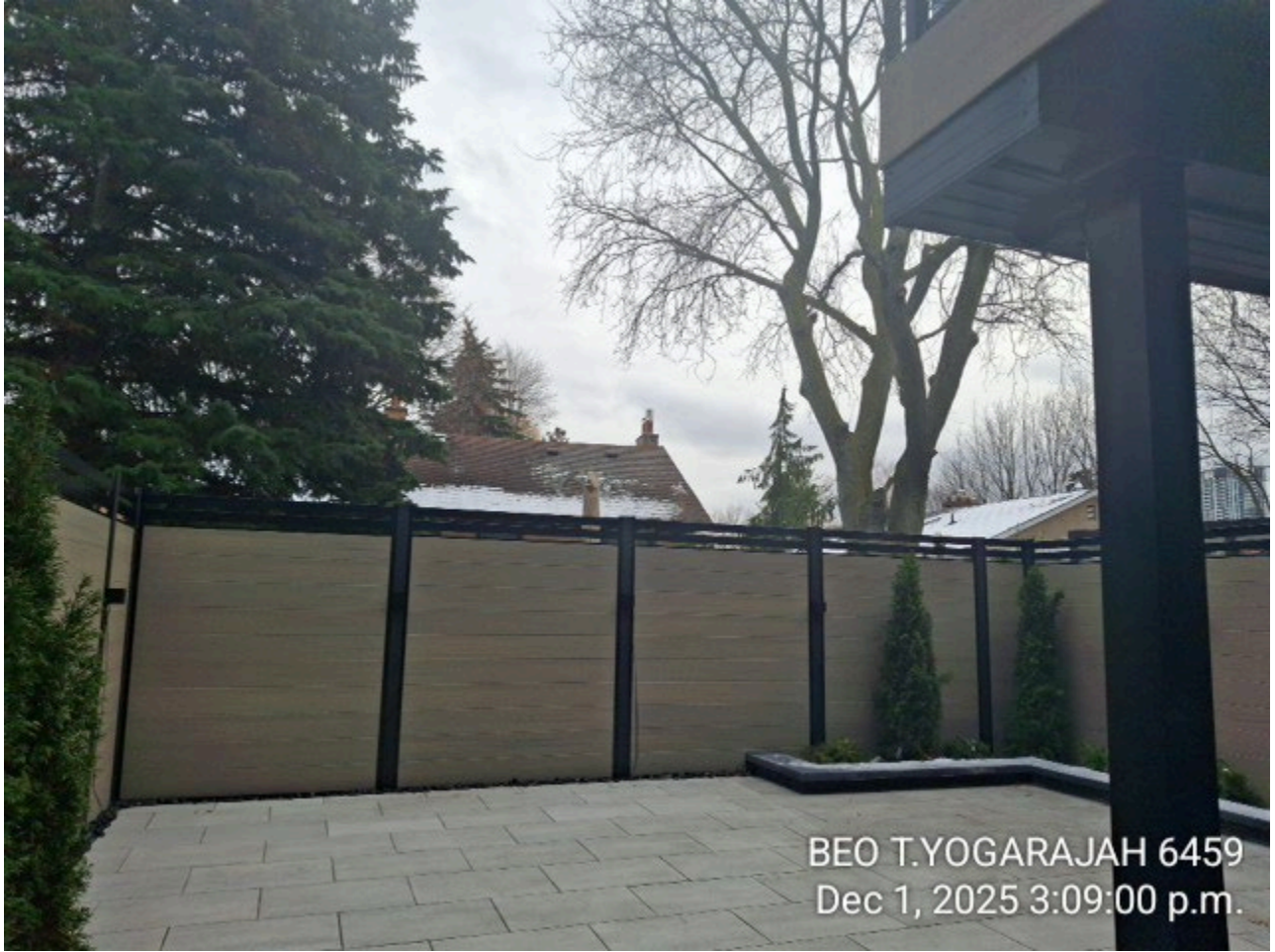
Attachment 4: 17 Hollyhock Officer's photo of rear yard. Facing south