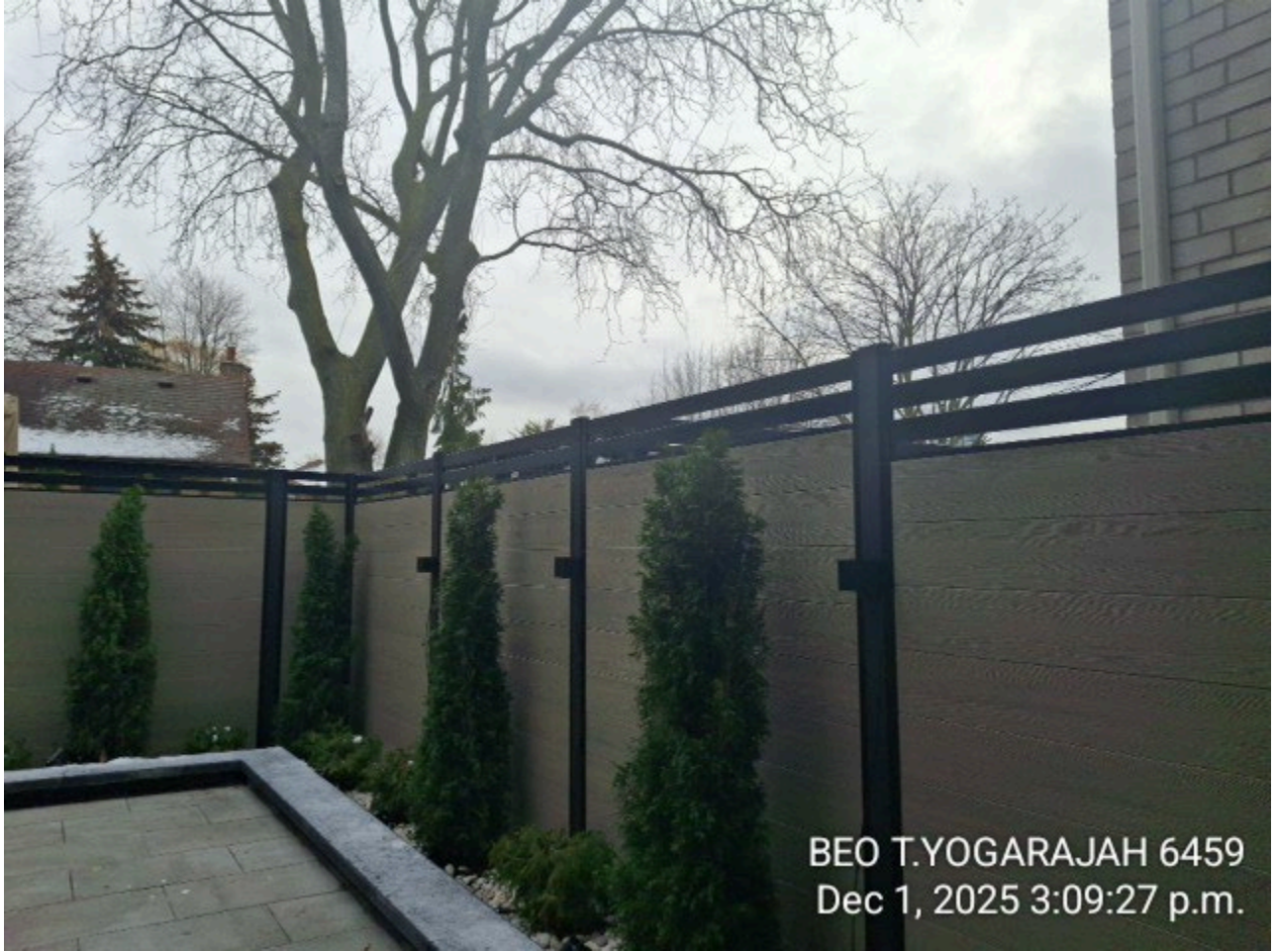
Attachment 3: 17 Hollyhock Officer's photo of rear yard. Facing south west