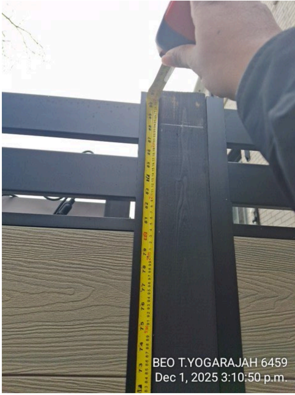
Attachment 5: 17 Hollyhock Officer's photo of measurement 2.31M