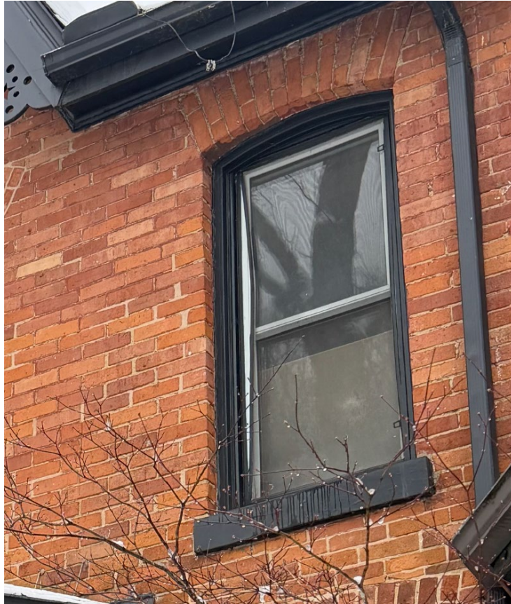
152 Spruce St – Cabbagetown South HCD Window Replacements Grant Amount: $9,584.20