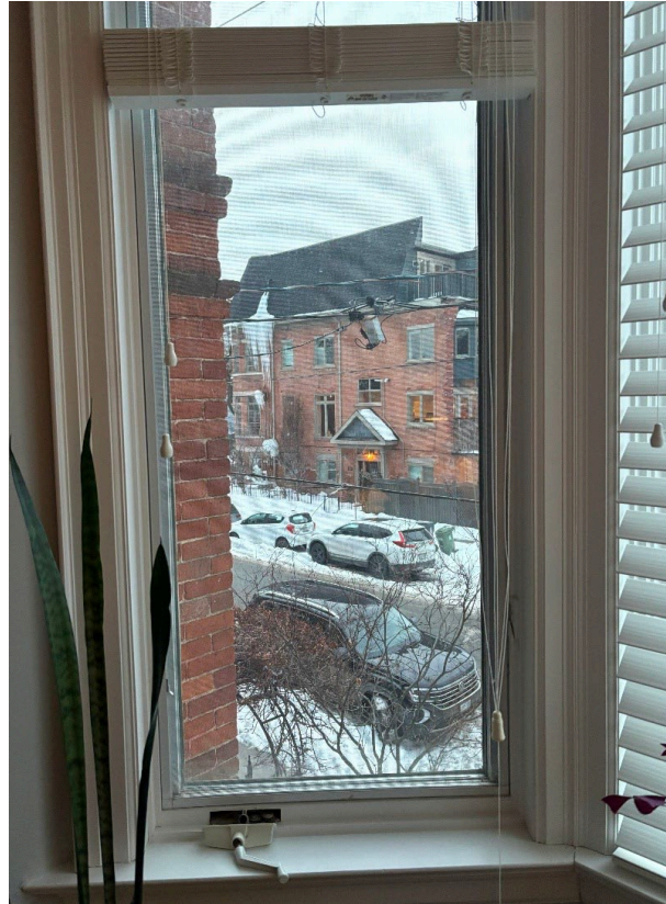
113 Winchester St – Cabbagetown North HCD Window Replacements Grant Amount: $9,176.52