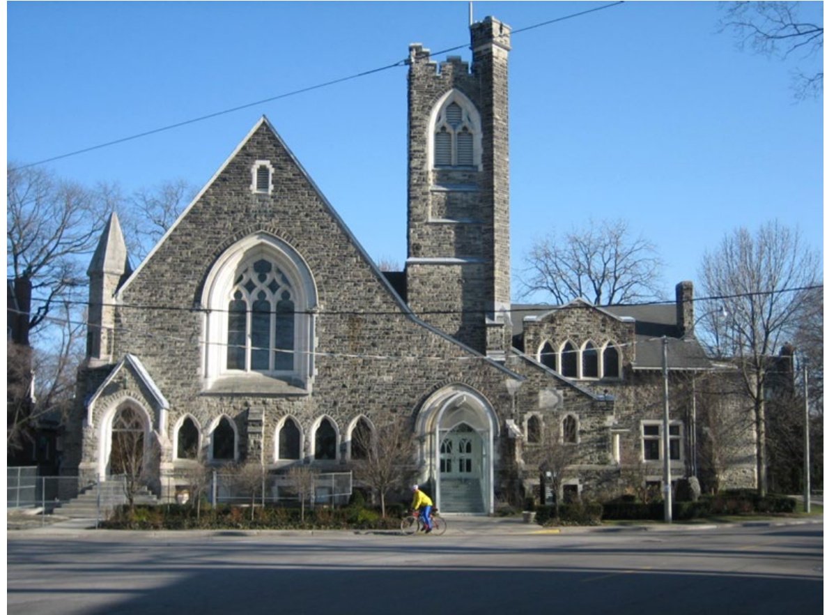
159 Roxborough Dr – North Rosedale HCD Slate Roof Repairs and Masonry Restoration Grant Amount: $154,915.83