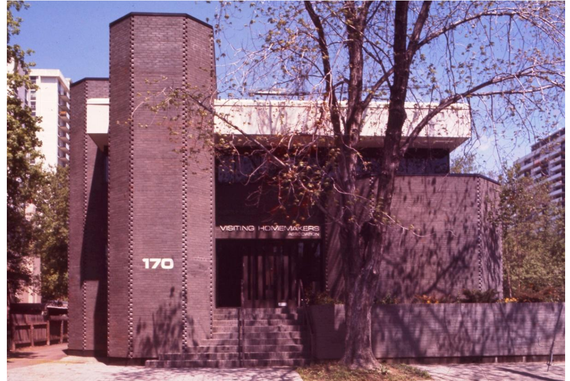
Early photograph of the VHA building showing the original pigment of the concrete brick cladding and paving (Leslie Rebanks)