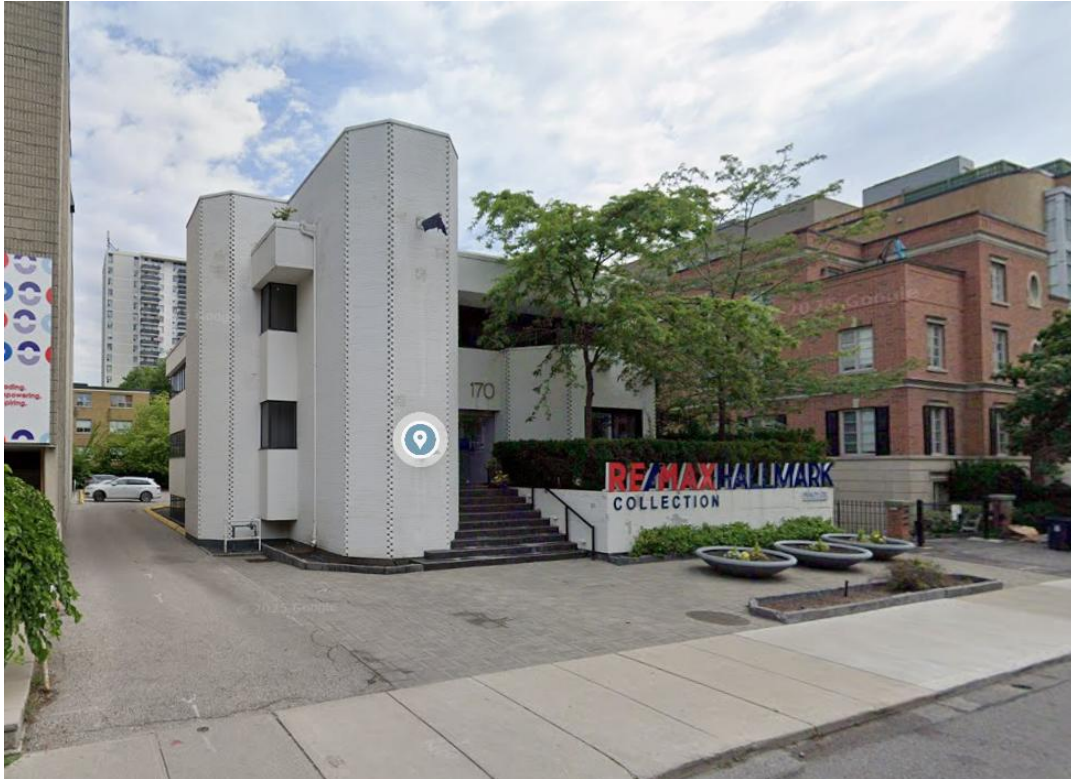
Photograph of the VHA building looking northeast