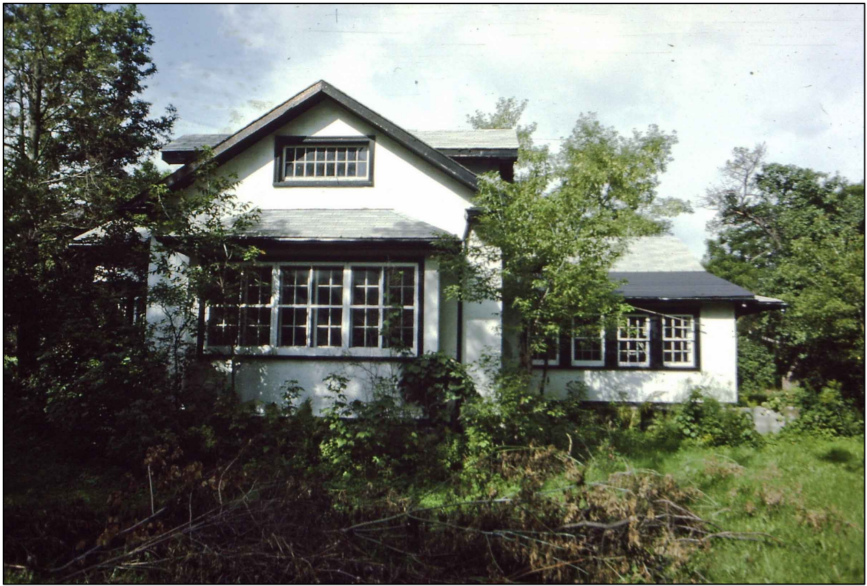
Figure 6. 22 John Street, east facade, 1977.