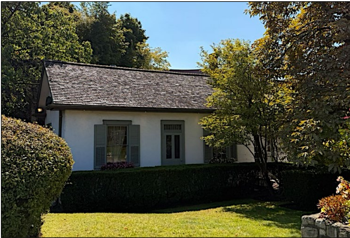
Figure 10. Workers Cottage formerly at 26 John Street, now the eastern cottage of the two (Alex Corey, September 2025).