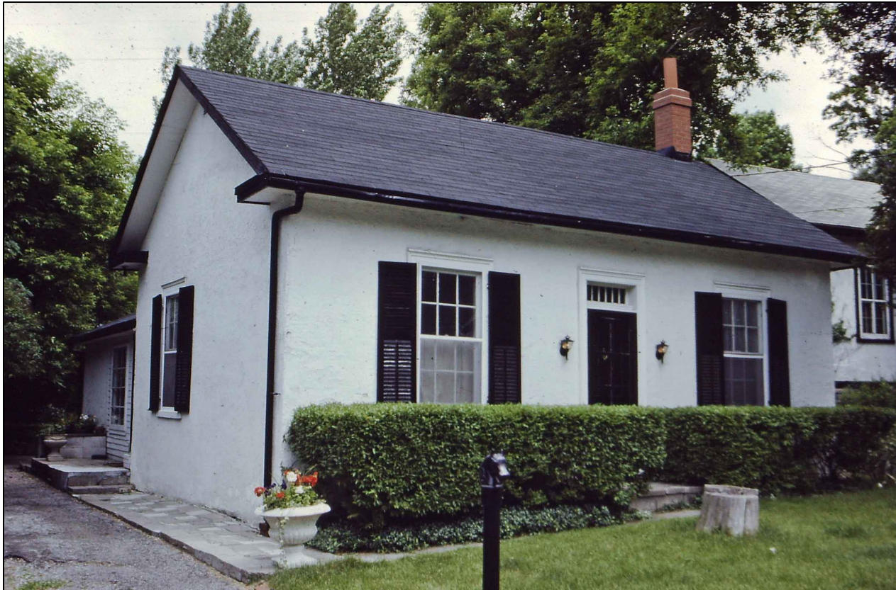
Figure 7. 26 John Street, 1980.