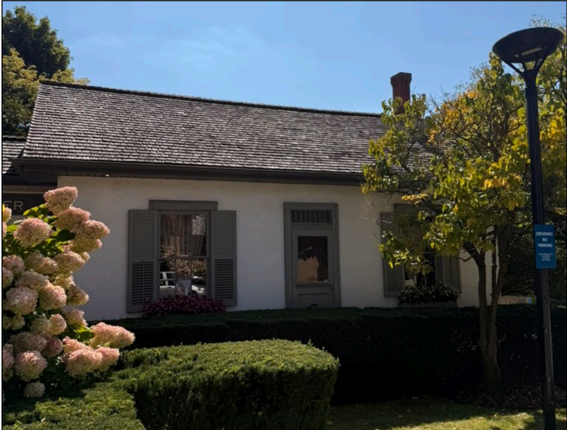
Figure 11. Workers Cottage formerly at 22 John Street, now the western cottage of the two (Alex Corey, September 2025).