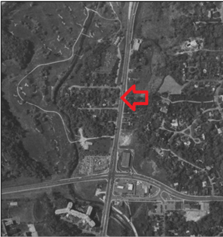
Figure 8. Aerial Photograph of Yonge and York Mills, 1977. The subject property is indicated by arrow.