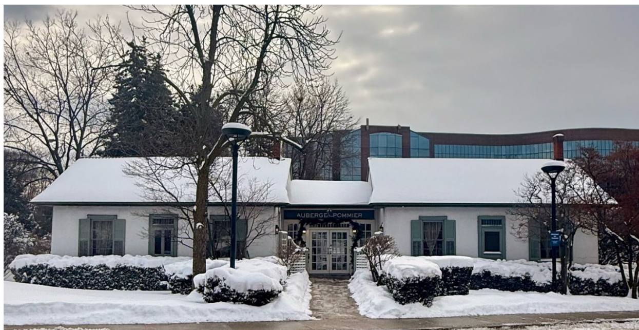
Figure 3. 4150 Yonge Street, north façade.

In undertaking this research and evaluation, we recognize that the area now known as the City of Toronto is the traditional territory of many nations including the Mississaugas of the Credit, the Anishnabeg, the Chippewa, the Haudenosaunee and the Wendat peoples, and is now home to many diverse First Nations, Inuit and Métis peoples. Toronto is covered by Treaty 13 signed with the Mississaugas of the Credit (1805), and the Williams Treaties (1923) signed with multiple Mississaugas and Chippewa bands.