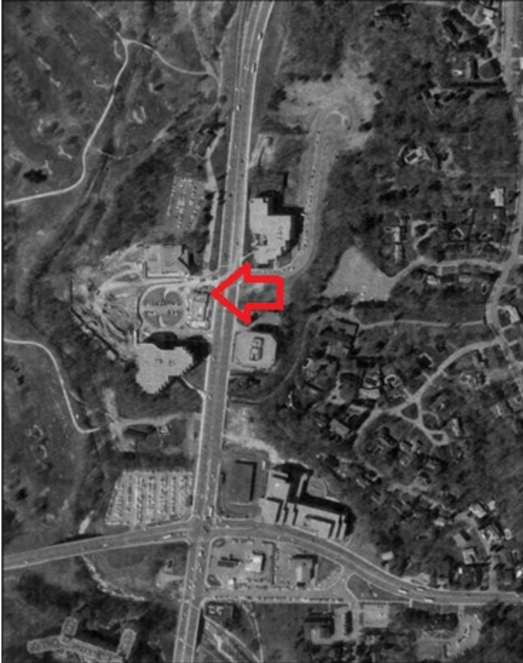
Figure 9. Aerial Photograph of Yonge and York Mills, 1987. The subject property is indicated by arrow.