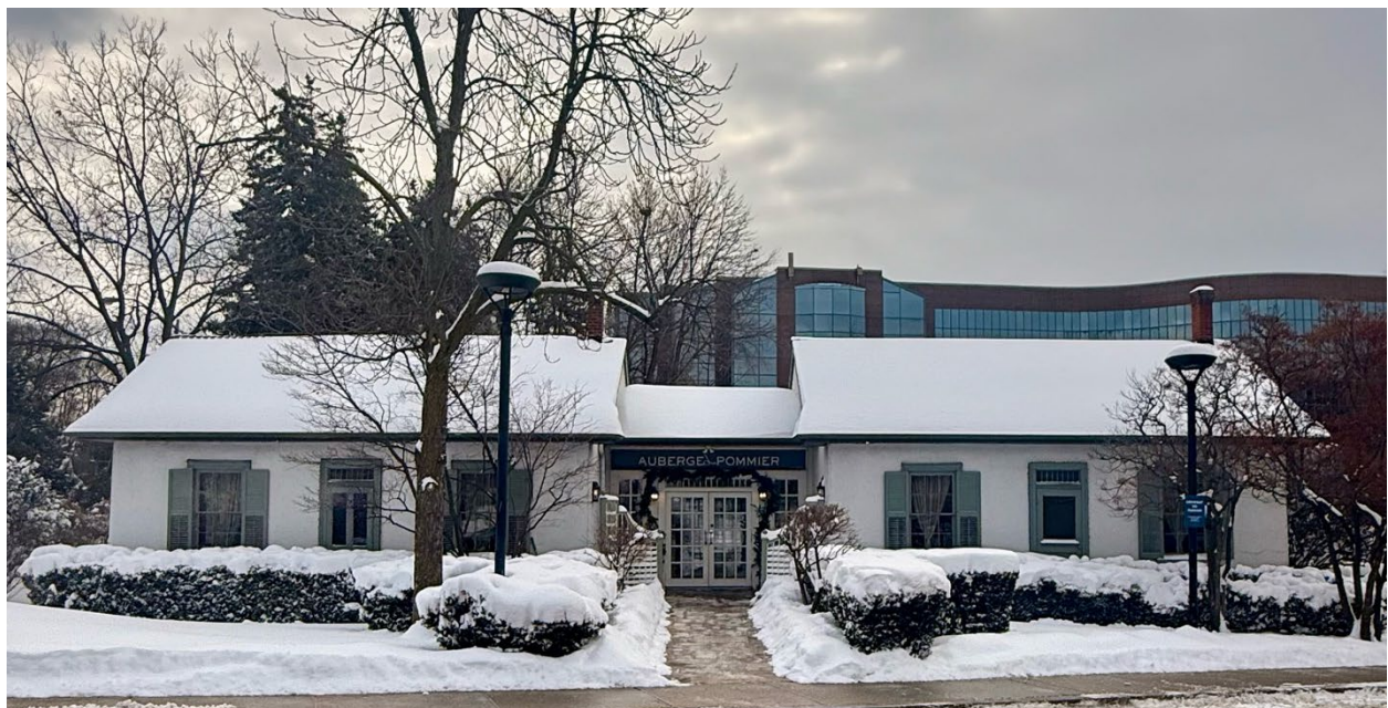
Figure 2. 4150 Yonge Street, north façade (Alex Corey, January 2026).