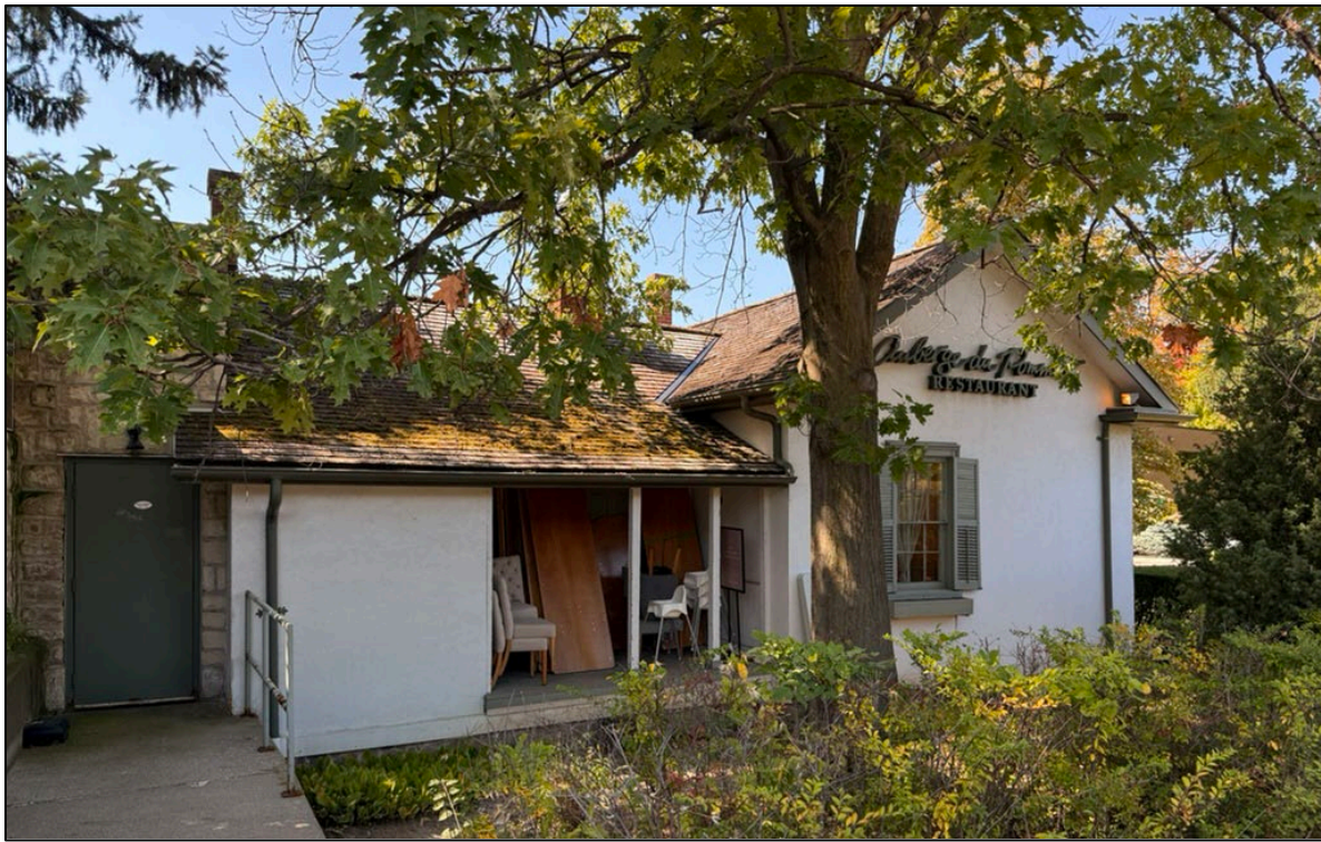
Figure 12. East facade of the former 26 John Street, seen from Yonge Street (Alex Corey, September 2025).