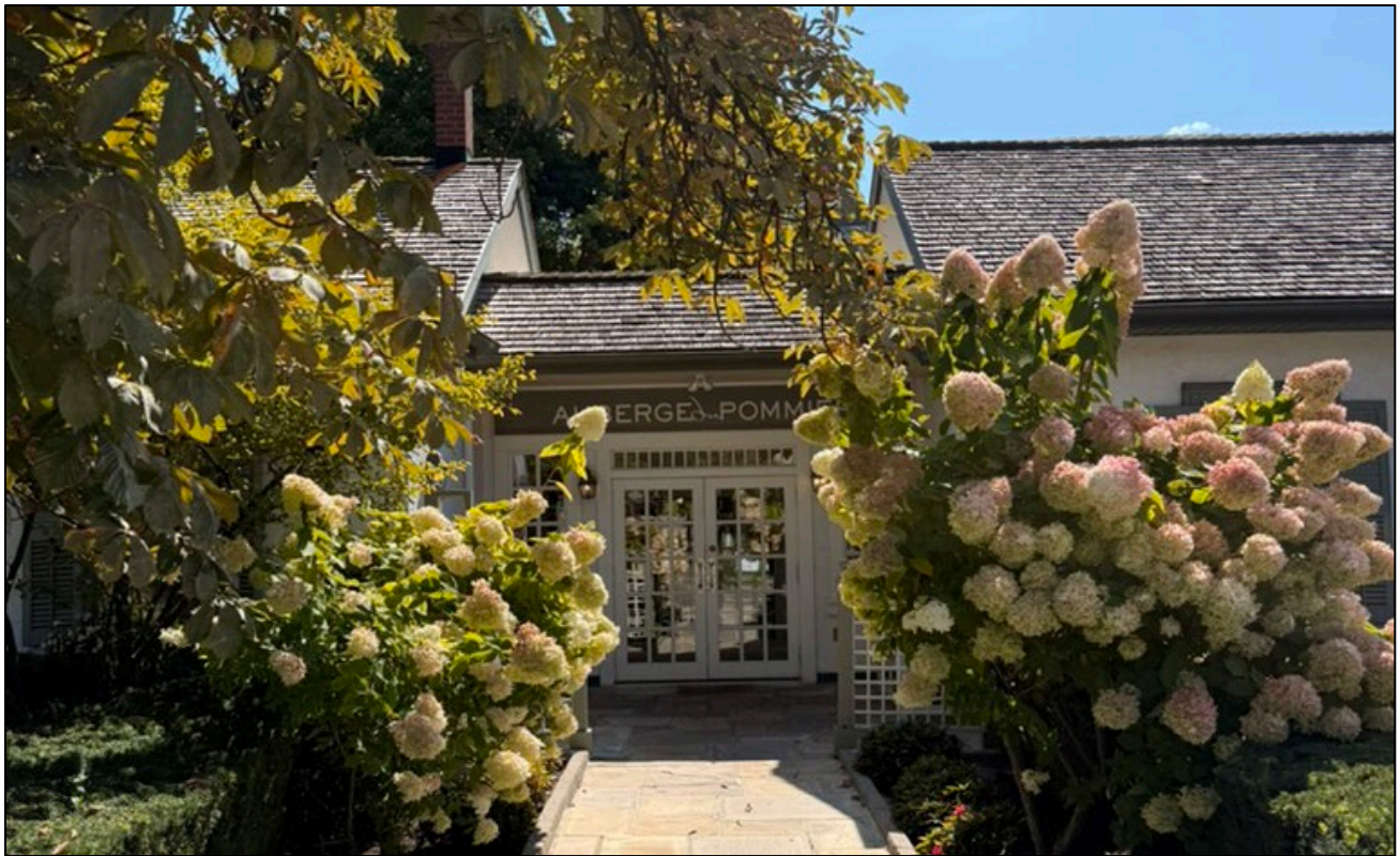
Figure 14. Infill construction connecting the former 22 and 26 John Street (Alex Corey, September 2025).