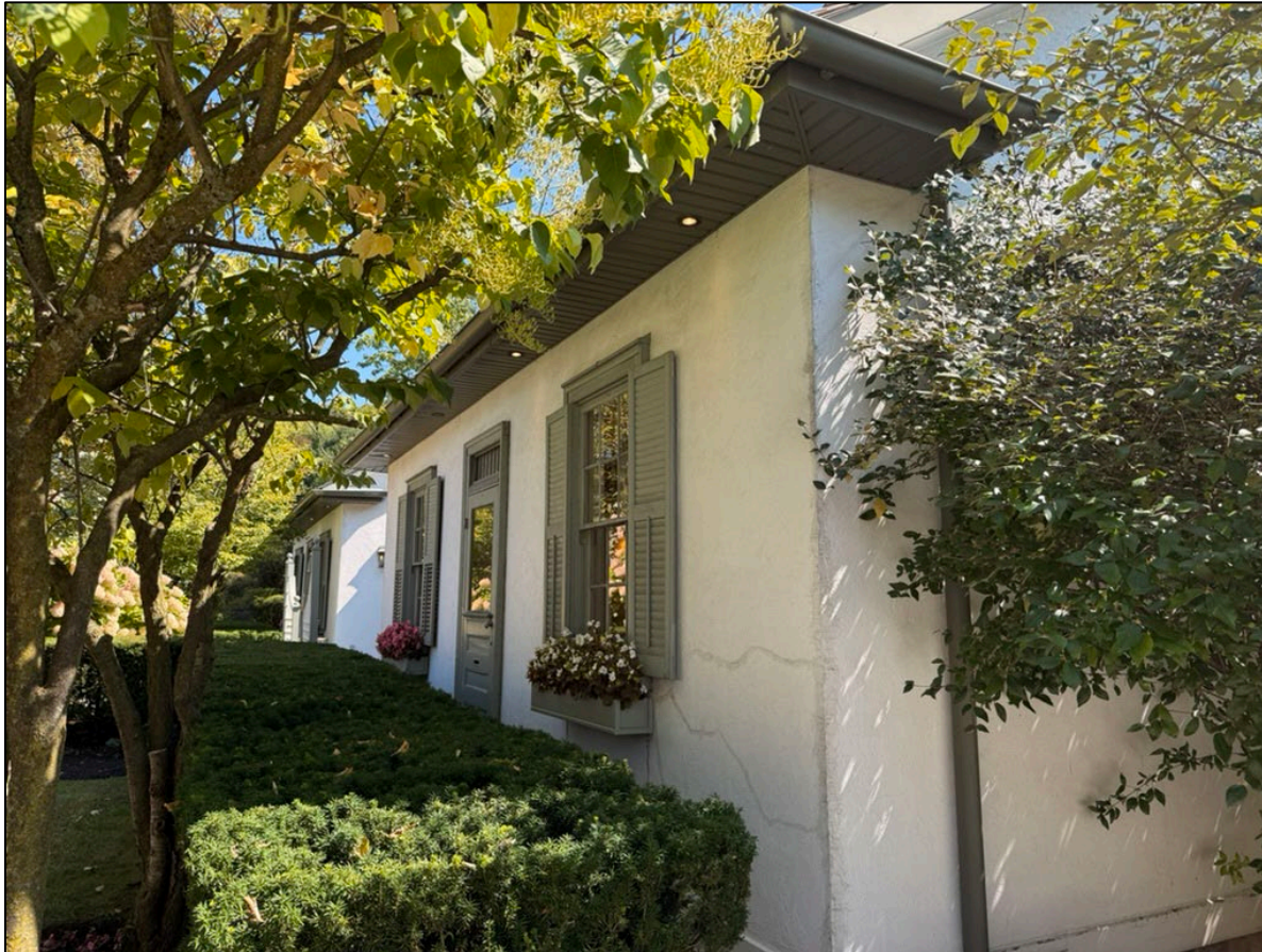
Figure 13. Primary (north) facade of the former 22 John Street (Alex Corey, September 2025).