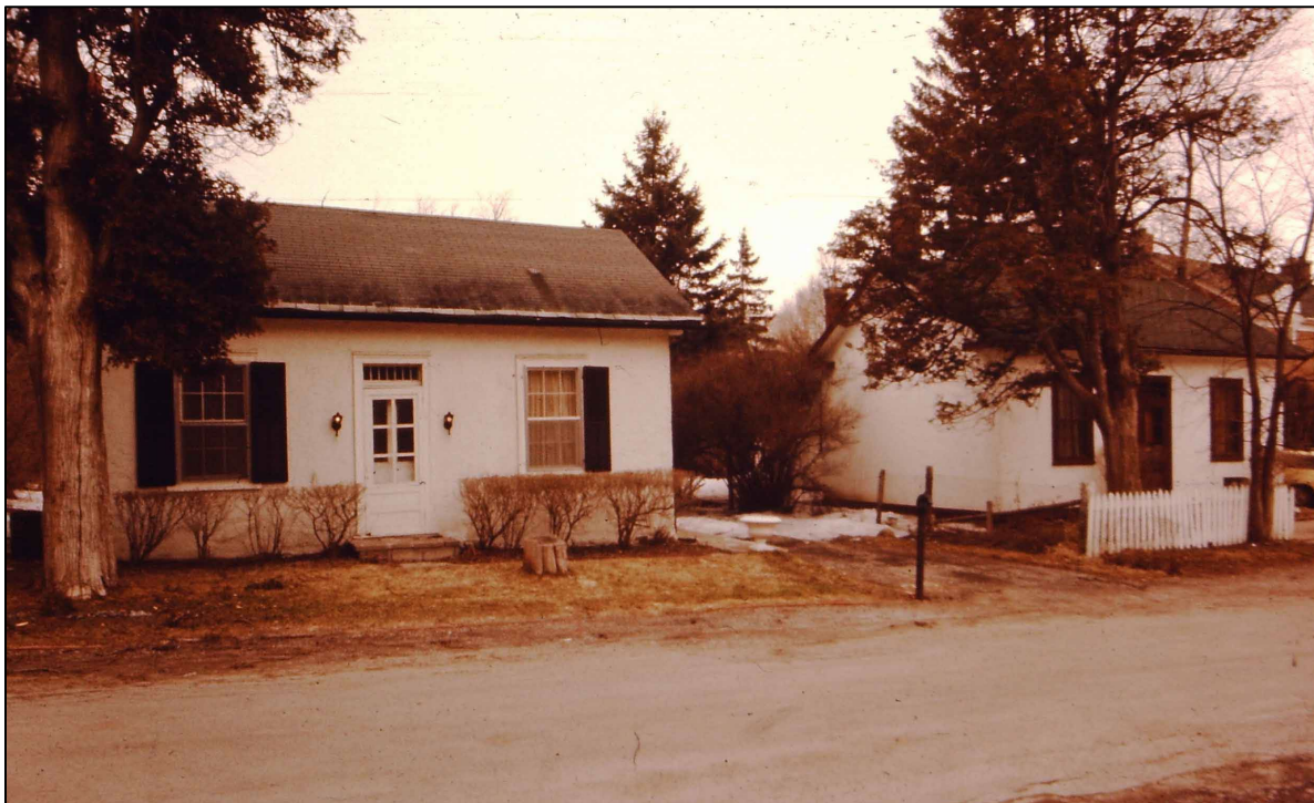
Figure 5. John Street Workers Cottages, c. 1970s, Toronto Historical Board.