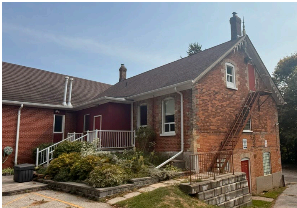
Figure 2. 328 Bellamy Road North, J.P. Wheler House (Alex Corey, September 2025).