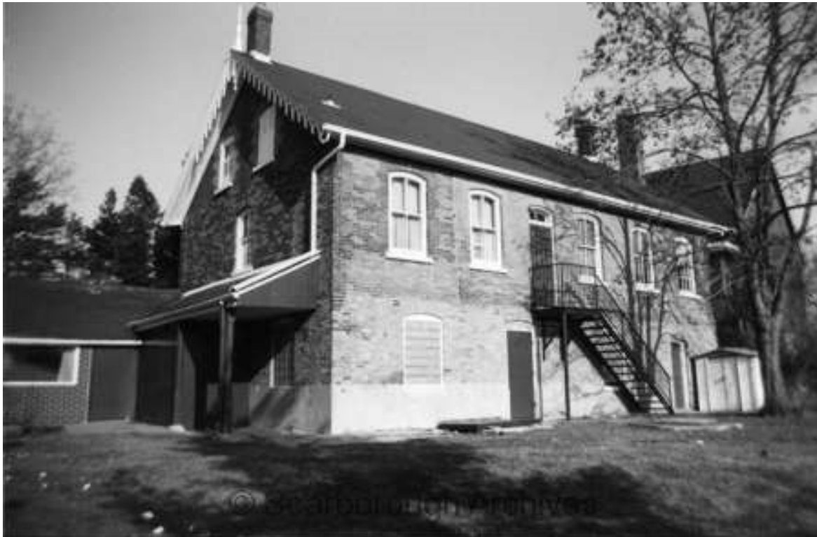
Figure 6. Photograph of the southwest (rear) facade of the Wheler House, date unknown.