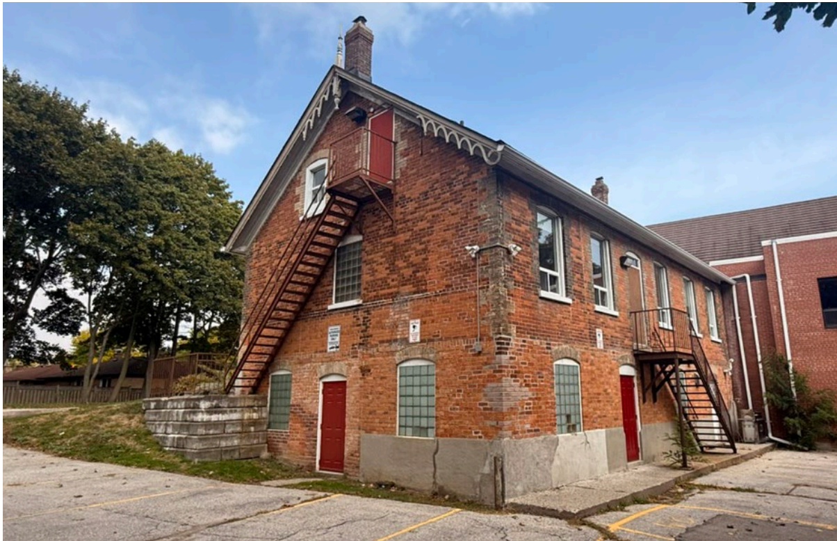
Figure 12. The Wheler House, southwest façade (Alex Corey, September 2025).