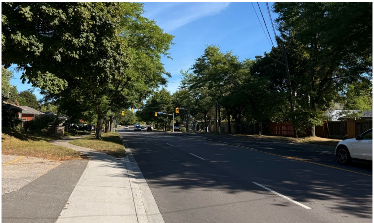
Figure 16. Bellamy Road North, looking north from 328 Bellamy Road North (Alex Corey, August 2025).