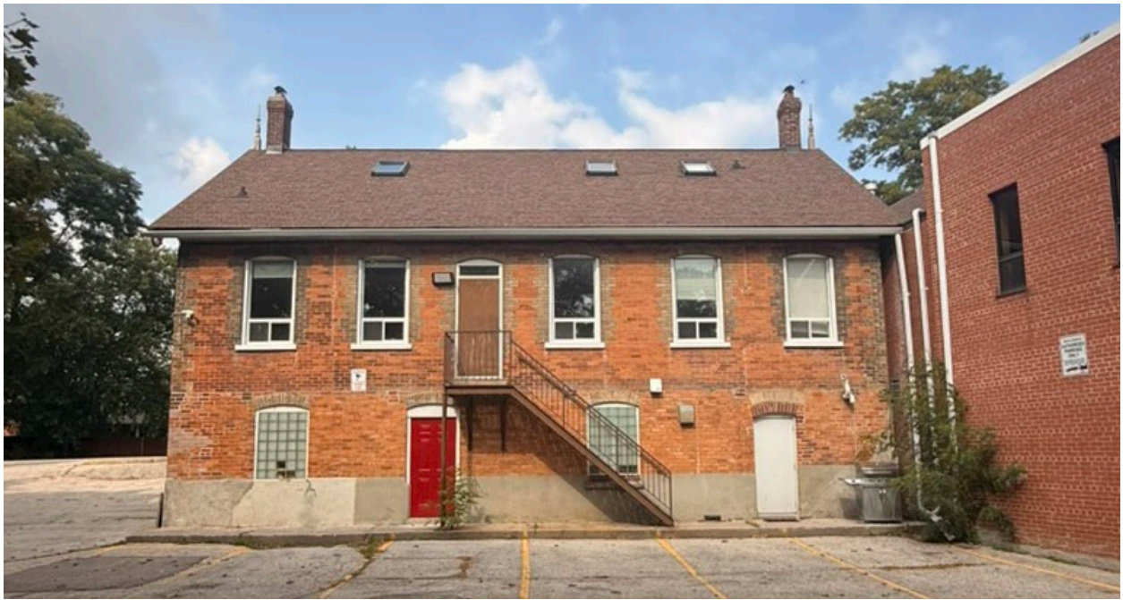
Figure 13. The Wheler House, south façade (Alex Corey, September 2025).