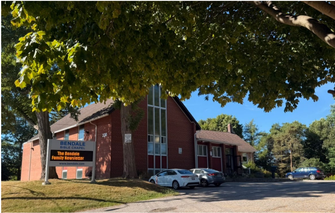
Figure 9. Bendale Bible Chapel and the Wheler House, looking southwest from Bellamy Road North (Alex Corey, August 2025).