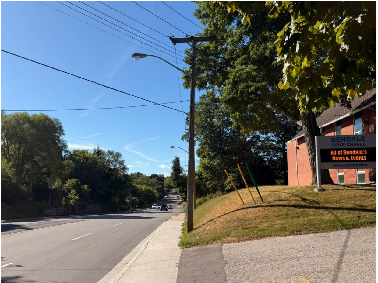
Figure 15. Bellamy Road North, looking south from 328 Bellamy Road North (Alex Corey, August 2025).