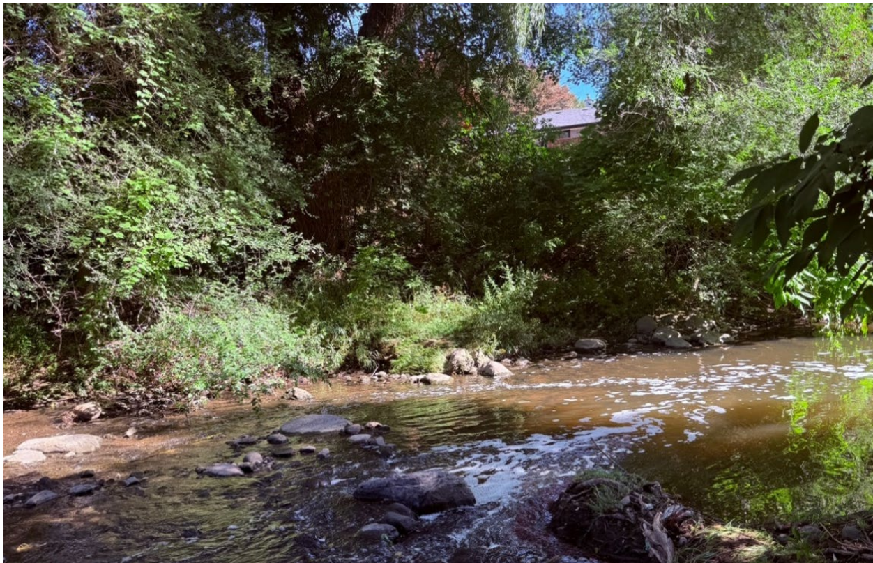
Figure 17. West Highland Creek, Hague Park, looking northeast towards 328 Bellamy Road North (Alex Corey, August 2025).