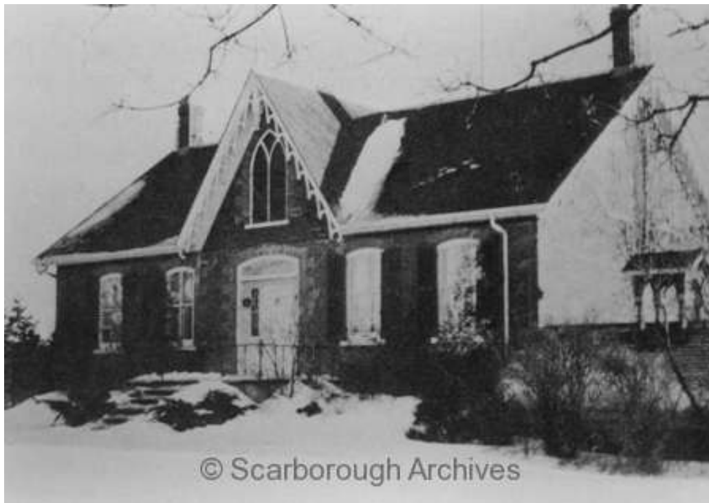
Figure 4. Photograph of the north (front) facade of the Wheler House, date unknown.