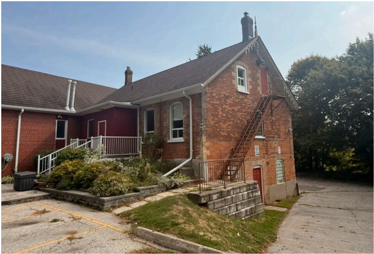
Figure 11. The Wheler House, north-west facade showing the existing bank (Alex Corey, September 2025).