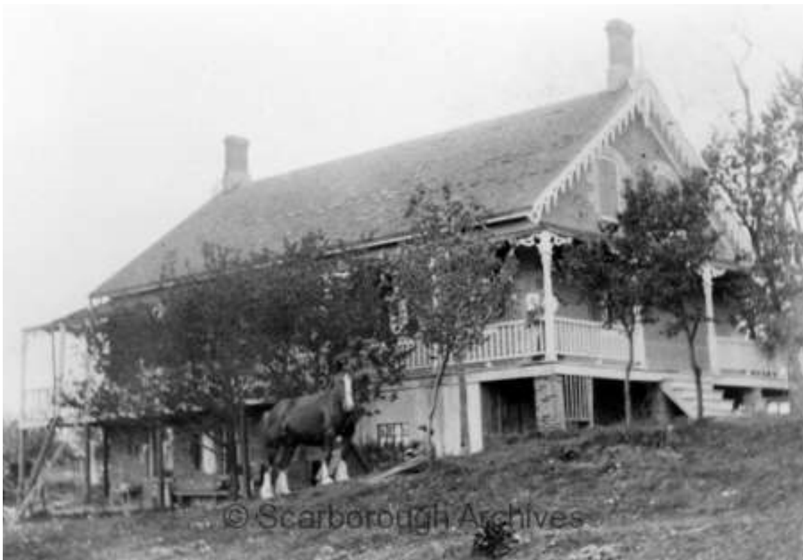
Figure 5. Photograph of the south-east (rear) facade of the Wheler House, date unknown. Scarborough Historical Society.