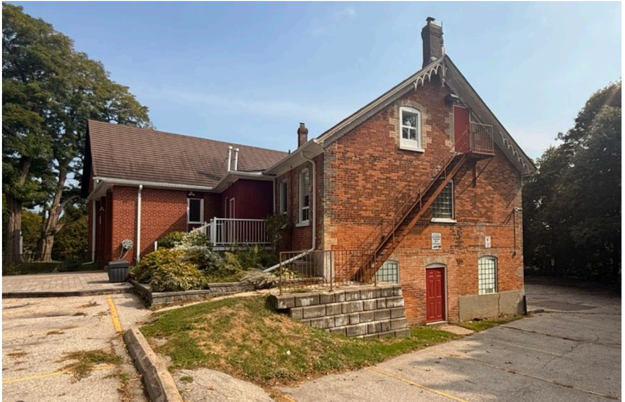
Figure 14. The Wheler House. northwest facade showing the existing bank and relation to Bendale Bible Chapel.