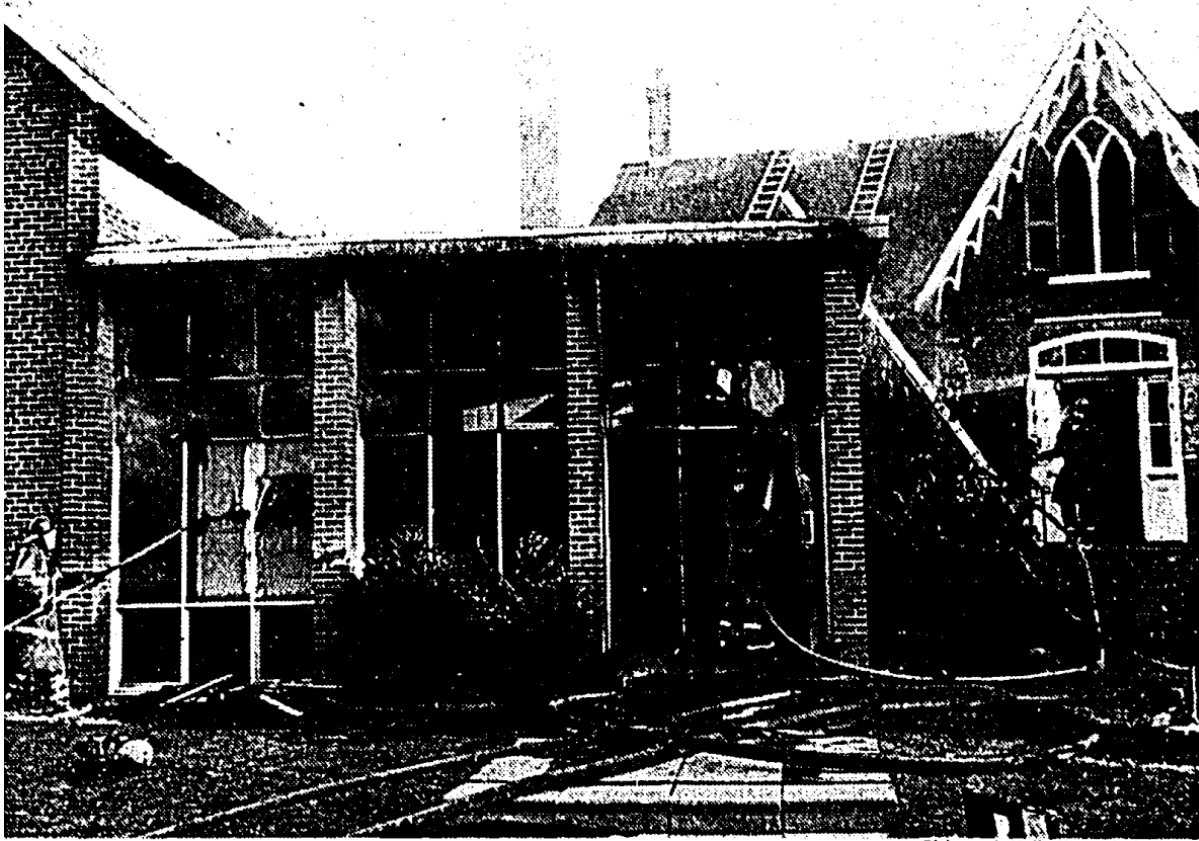
Figure 7. Photograph showing damage to Bendale Bible Chapel with the Wheler House at rear following a fire. The Globe and Mail, September 13, 1967.