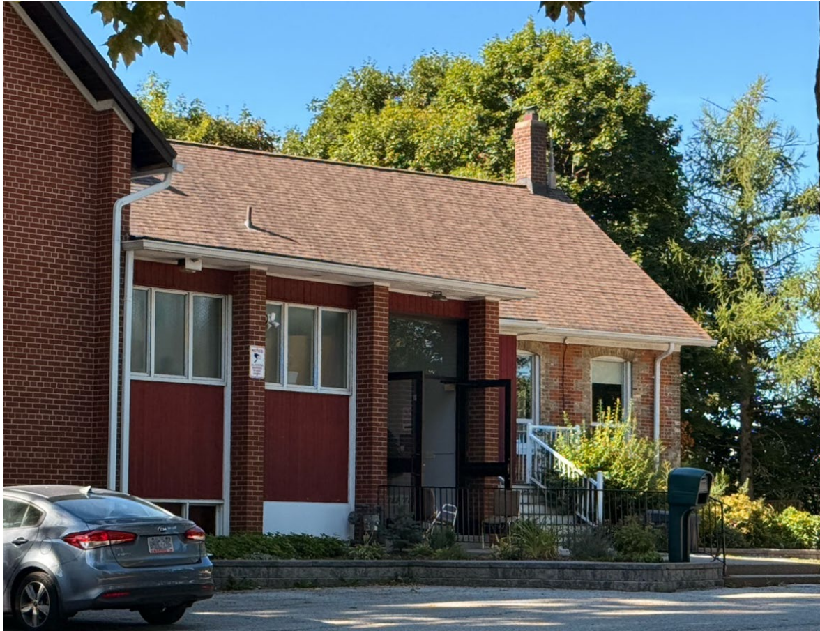
Figure 10. The Wheler House, north (front) facade, looking southwest from Bellamy Road North (Alex Corey, August 2025).