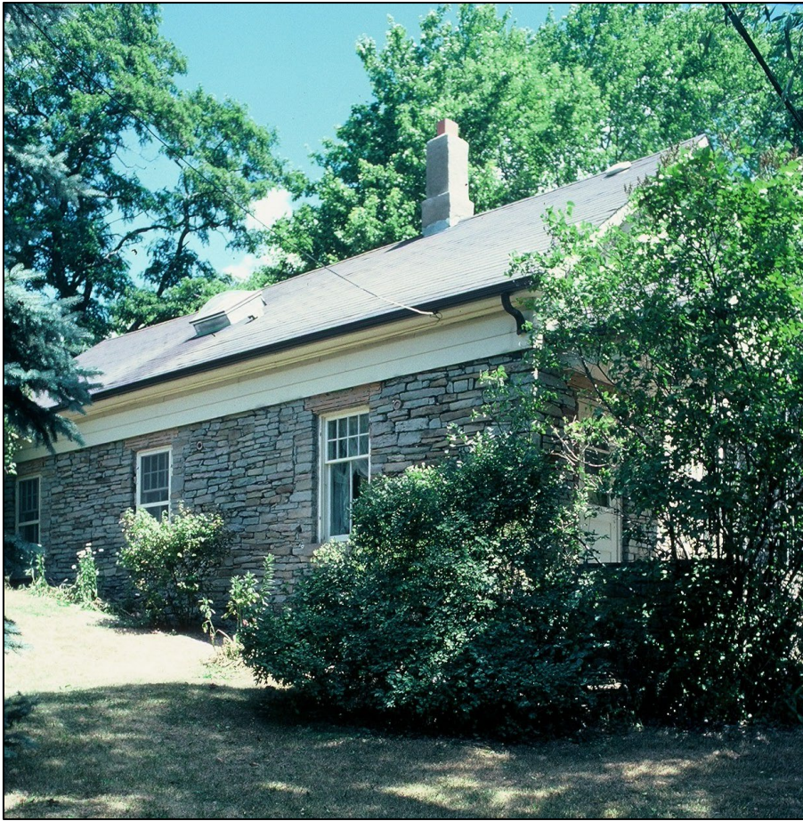
Figure 9: 34 Jason Road, west façade, date unknown. Etobicoke Inventory of Heritage Properties, Toronto Historical Board.