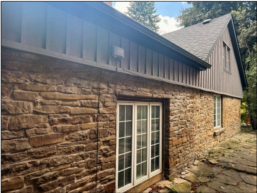
Figure 13: 34 Jason Road, north facade. "L" addition with French doors is in the foreground with the original structure at the right (Alex Corey, September 2025).