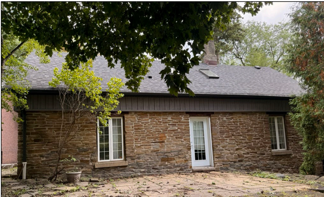
Figure 12: 34 Jason Road, west facade, showing three openings with modified opening at centre for access to stone patio (Alex Corey, September 2025).