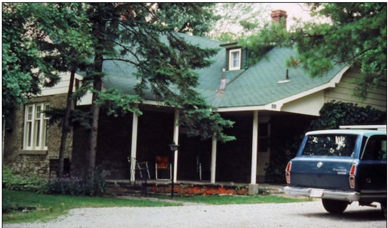
Figure 8: 34 Jason Road, date unknown.