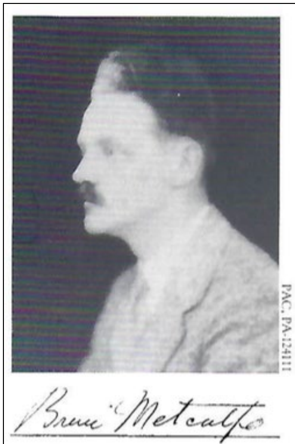
Figure 7: Photograph and signature of Bruce Metcalfe, date unknown.