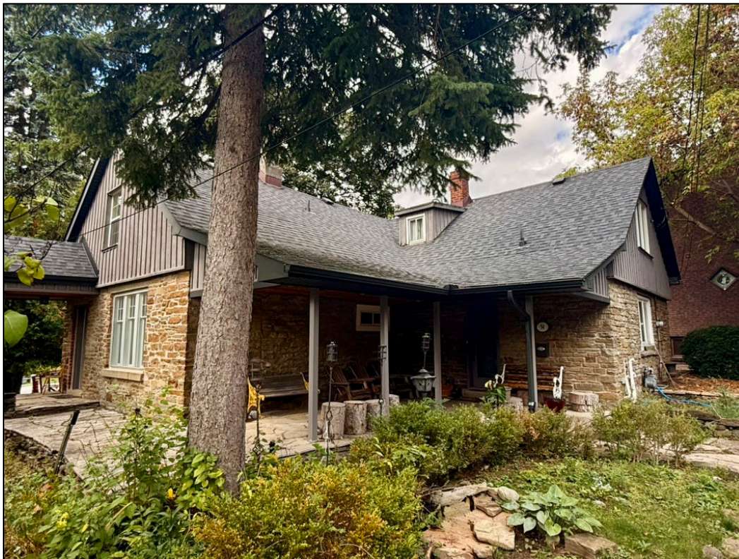
Figure 2. 34 Jason Road, southeast façade (Alex Corey, September 2025).