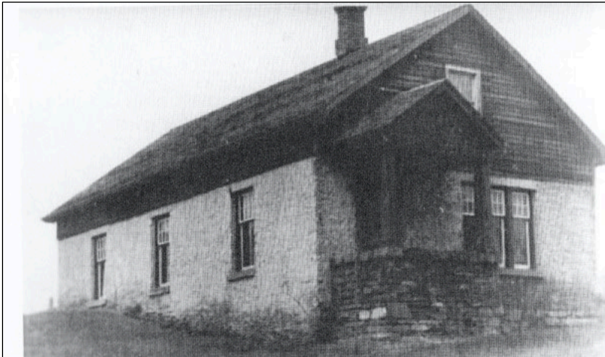
Figure 6: 34 Jason Road, date unknown (pre-1926). Note the stucco cladding, which was subsequently removed. Twitchin, The History of Thistle Town.