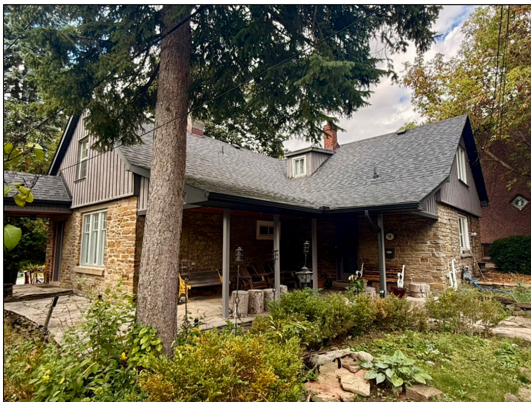
Figure 3. 34 Jason Road, southeast façade.

In undertaking this research and evaluation, we recognize that the area now known as the City of Toronto is the traditional territory of many nations including the Mississaugas of the Credit, the Anishnabeg, the Chippewa, the Haudenosaunee and the Wendat peoples, and is now home to many diverse First Nations, Inuit and Métis peoples. Toronto is covered by Treaty 13 signed with the Mississaugas of the Credit (1805), and the Williams Treaties (1923) signed with multiple Mississaugas and Chippewa bands.