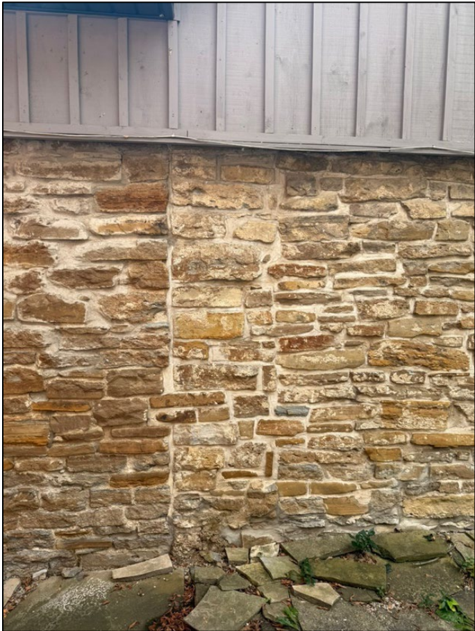
Figure 14: 34 Jason Road, north facade, showing the joint between the c.1921 (right) and c.1926-33 (left) structures (Alex Corey, September 2025).