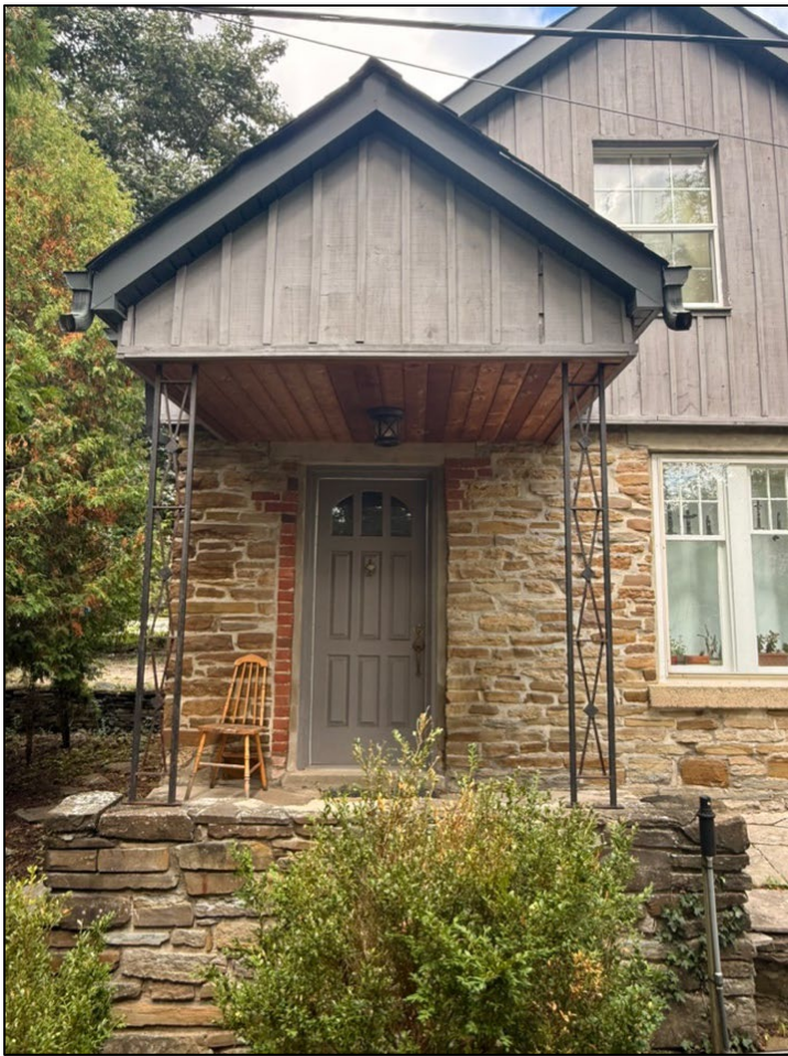
Figure 11: 34 Jason Road, south facade, secondary entrance with gabled awning (Alex Corey, September 2025).