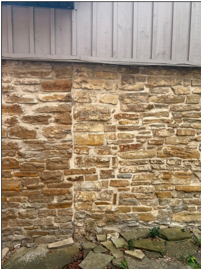
Figure 14: 34 Jason Road, north facade, showing the joint between the c.1921 (right) and c.1926-33 (left) structures (Alex Corey, September 2025).