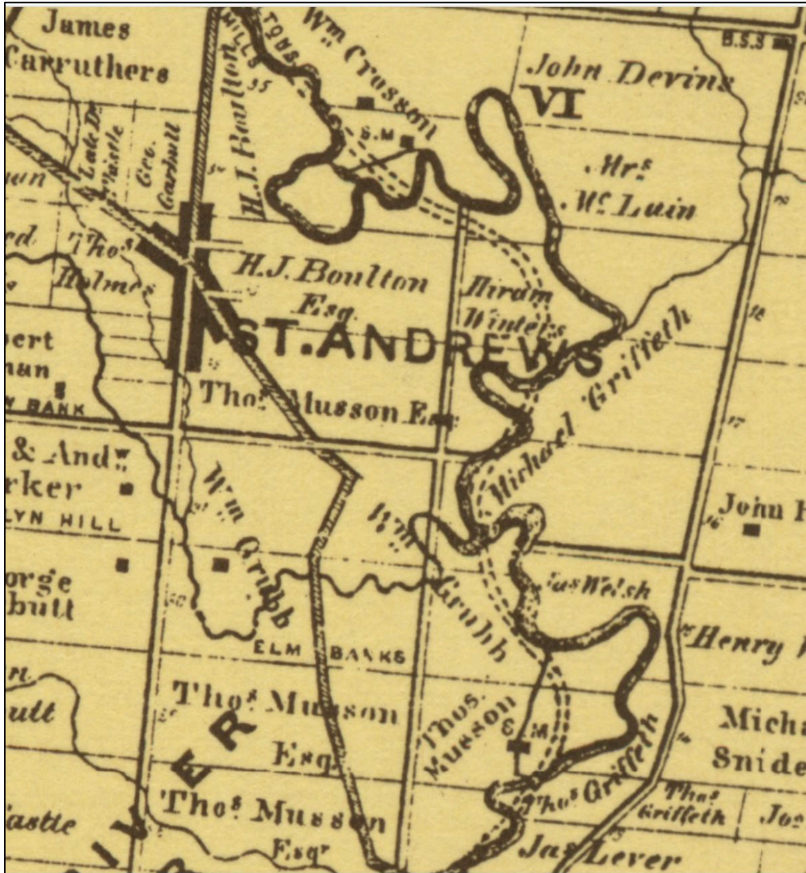
Figure 4: George Tremain, Tremain's Map of the County of York Canada West, compiled and drawn by George R. Tremain from Actual Surveys Toronto. Published by George C. Tremain, 1860 with notations added showing the approximate location of 34 Jason Road.