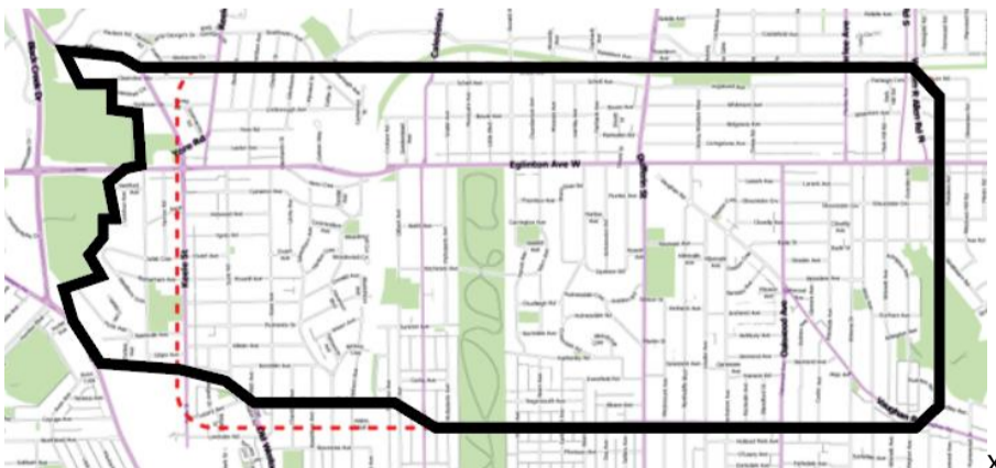
Diagram 3. Community supported boundary