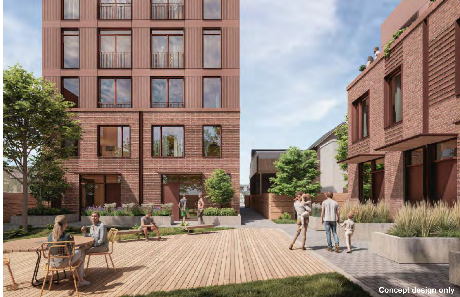
Concept design only