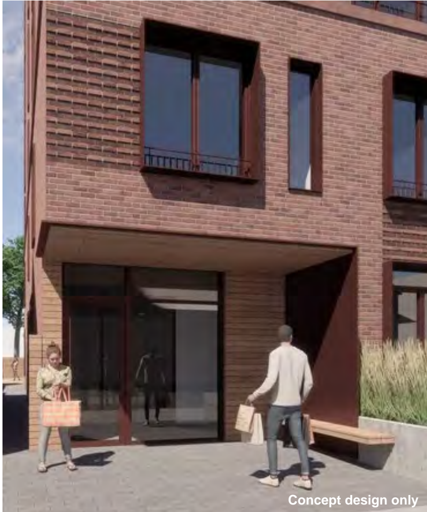
Concept design only