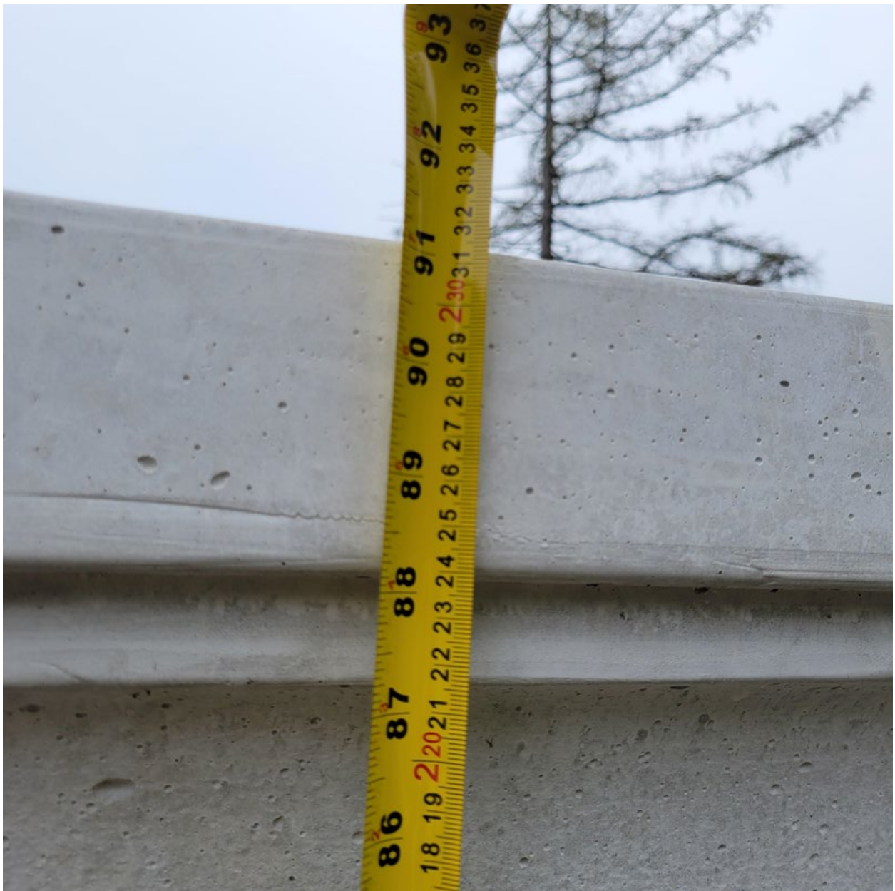
Attachment 6: Pillar Measurement