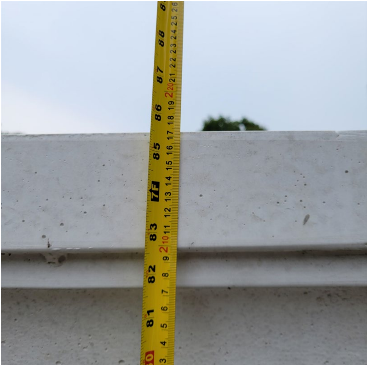
Attachment 4: Pillar Measurement