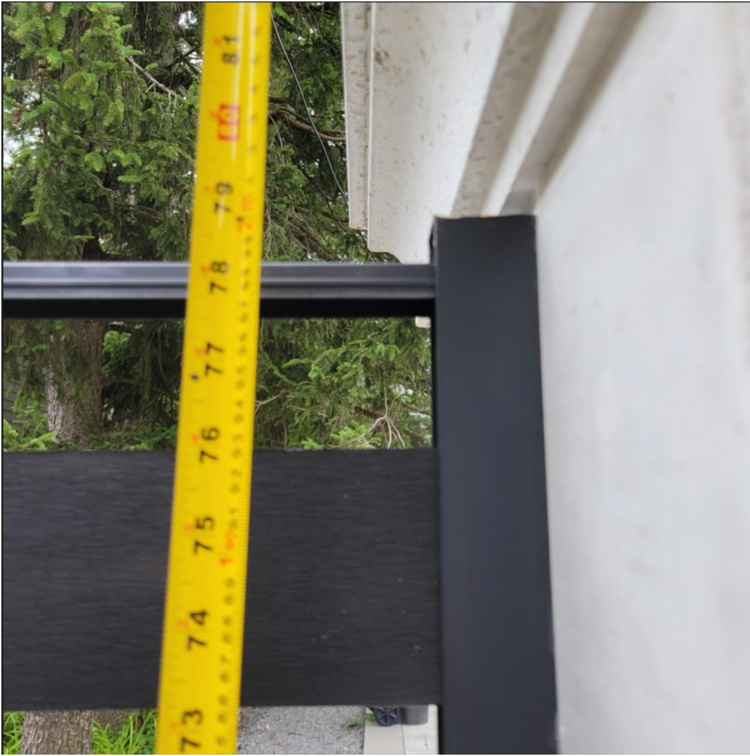
Attachment 8: Measurement of Fence between the Gates