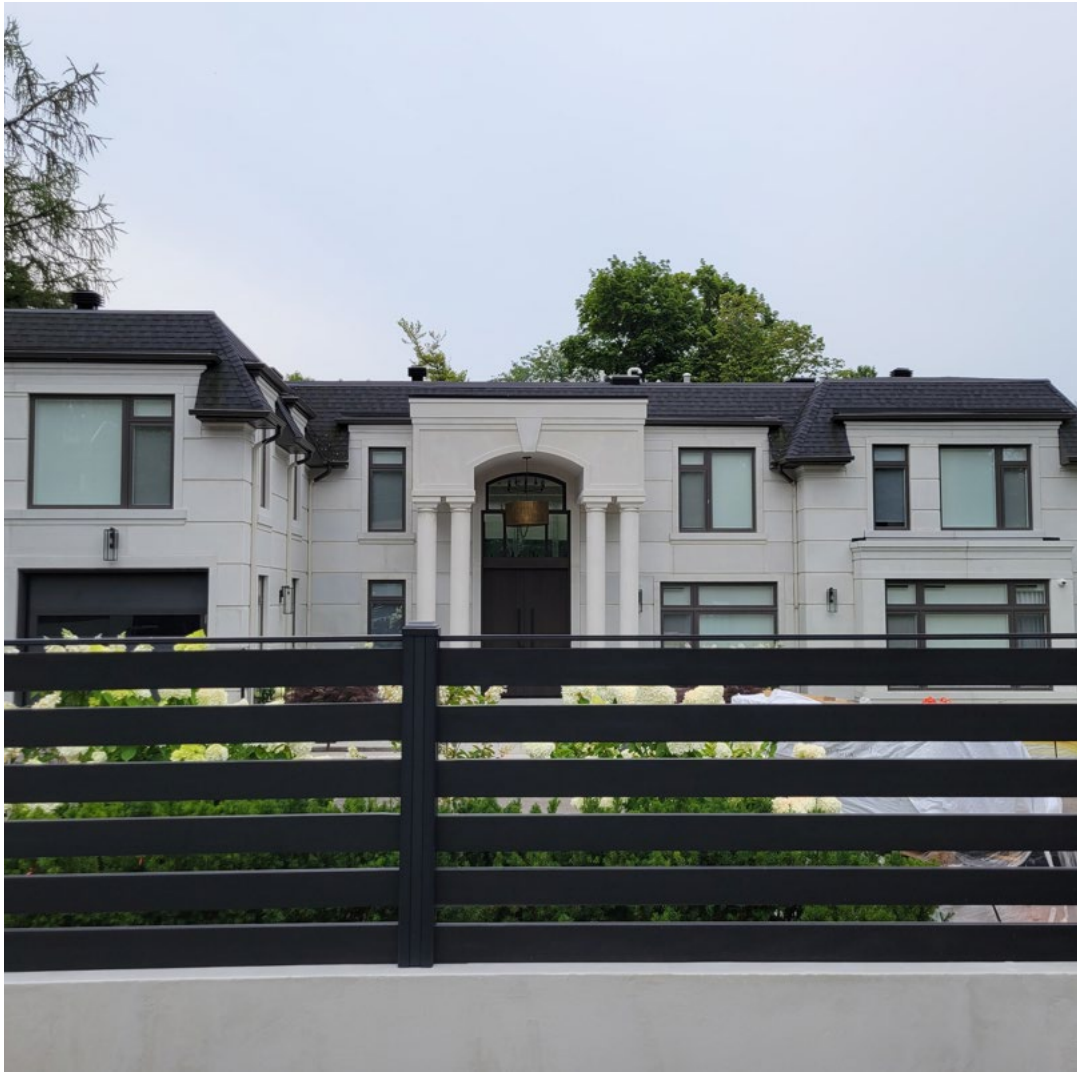
Attachment 7: Fence between Gates