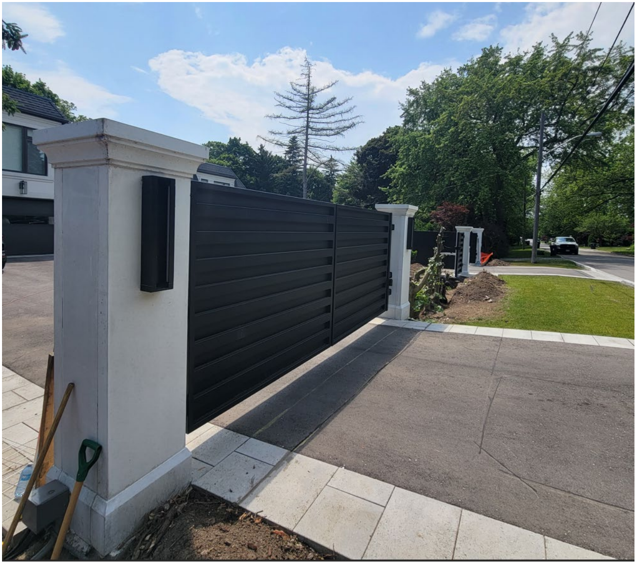
Attachment 2: North Property Line Gates with Pillars