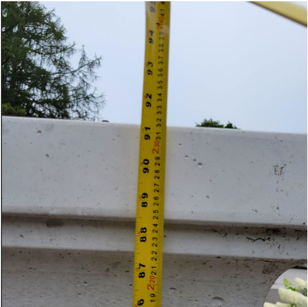
Attachment 5: Pillar Measurement