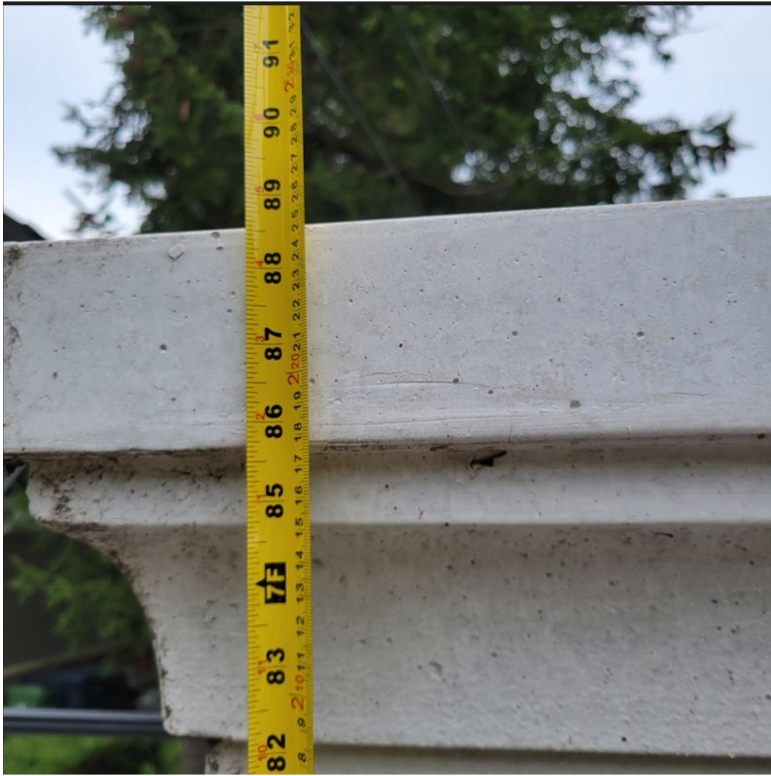
Attachment 3: Pillar Measurement