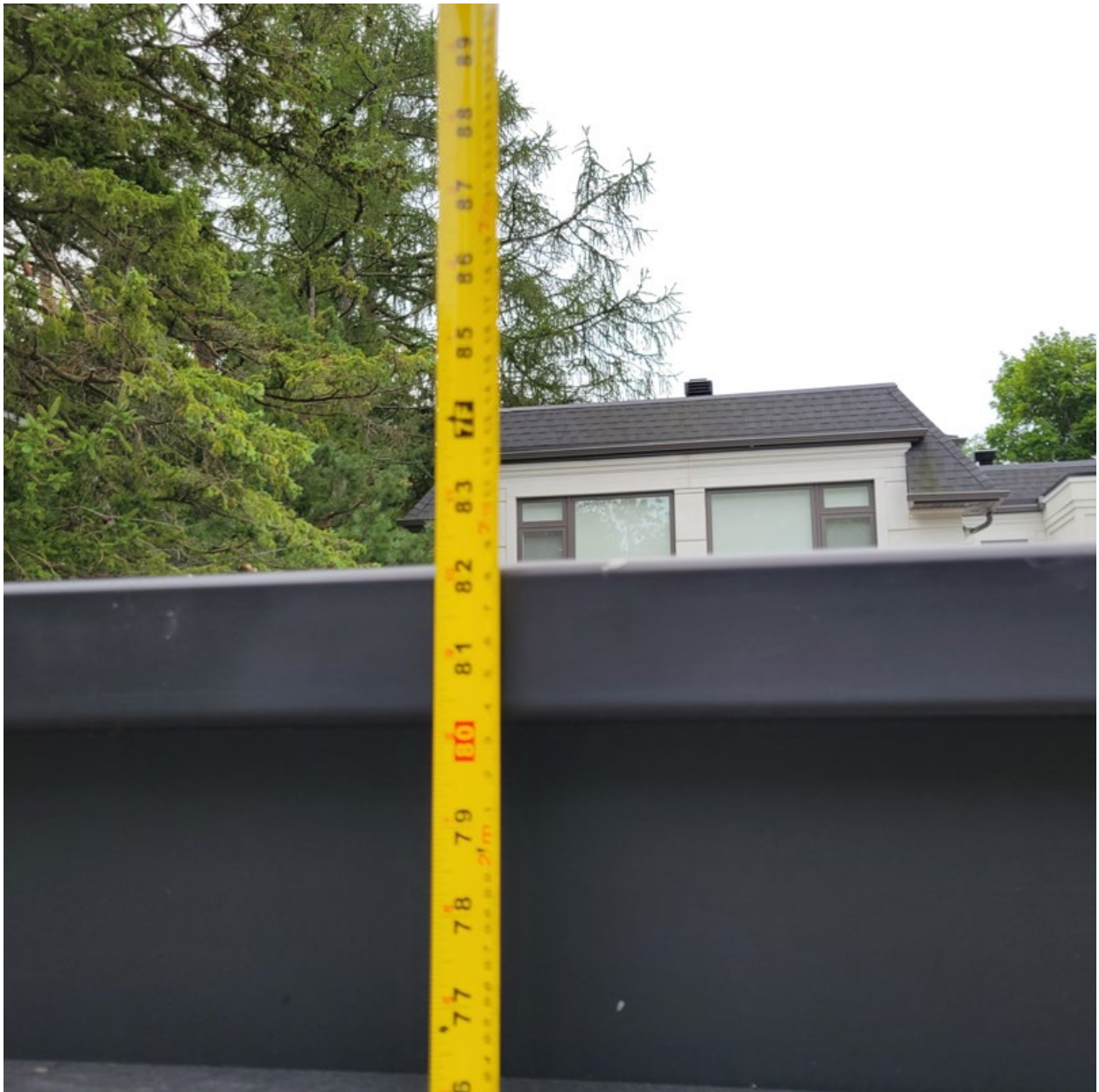
Attachment 8: East End Gate Measurement