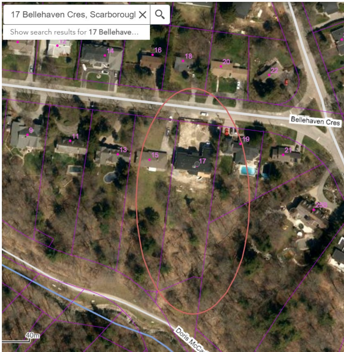
Attachment 1: iView Map of Property – 17 Bellehaven Crescent