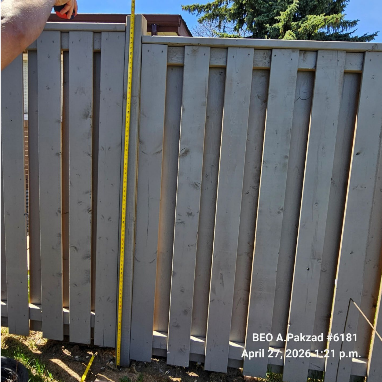
Attachment 5: Supervisor's photo – Fence height grading difference (2.03m)