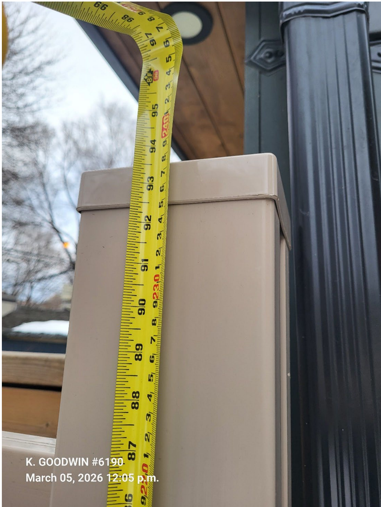
Attachment 5: Rear fence – Southern lot line – zoomed measurement confirmation

K. GOODWIN #6190 March 05, 2026 12:05 p.m.