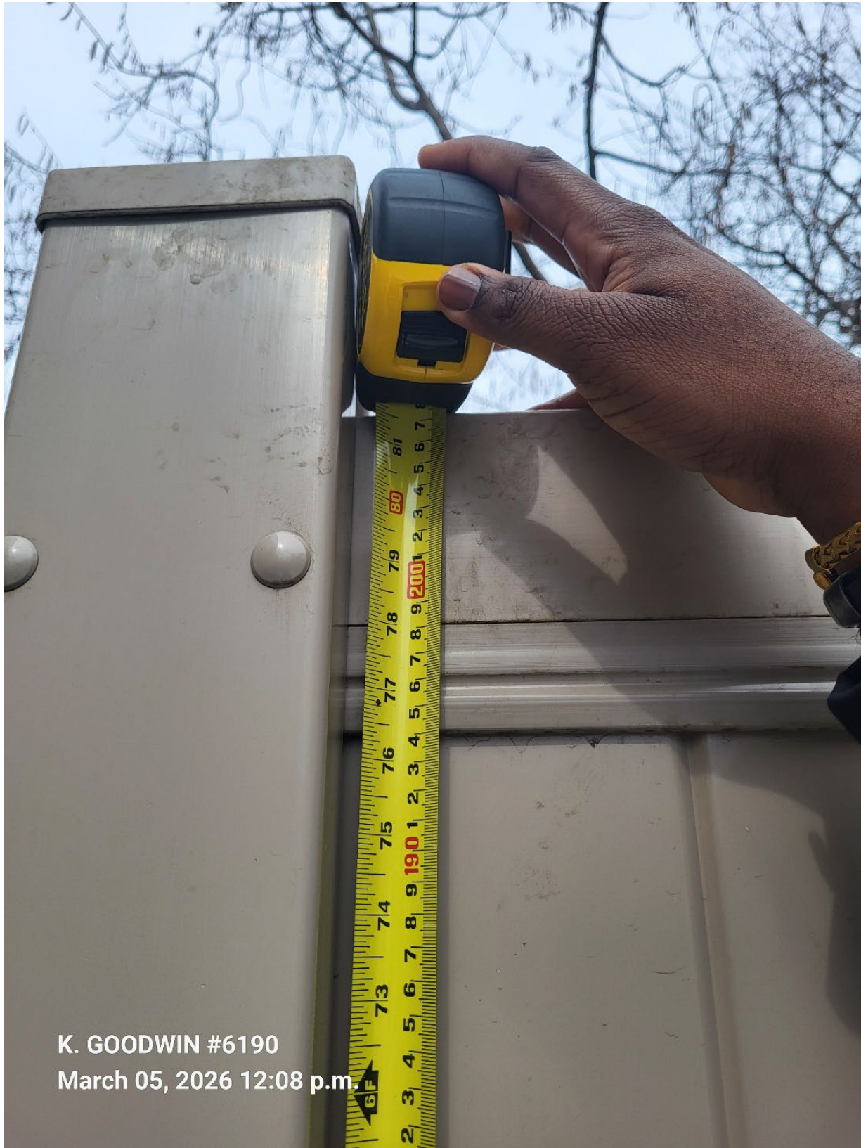
Attachment 7: Rear fence – Northern lot line – zoomed measurement confirmation