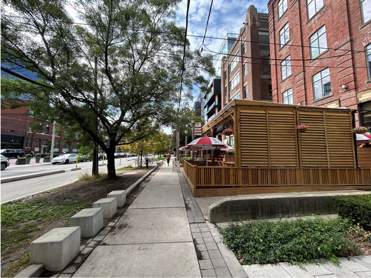
Attachment 3: Photo looking west at 482 Wellington Street West