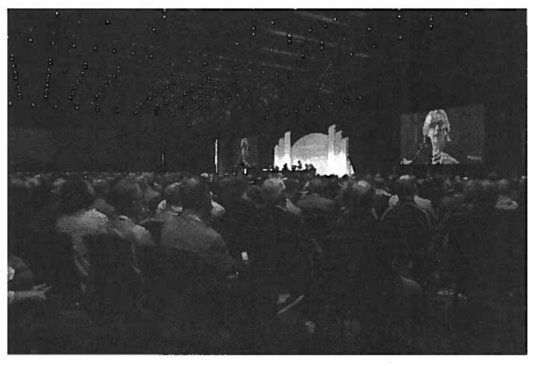
June 4-8, 2015 Shaw Convention Centre, Edmonton, Alberta

The 2015 edition of FCM's Annual Conference and Trade Show, with a focus on the 2015 federal election, delivered informative and thought-provoking sessions designed to meet the unique professional development needs of municipal political leaders and senior staff. Under the theme Today's communities, tomorrow's Canada, the event was a huge success and brought together more than 1,700 municipal leaders from across the country.