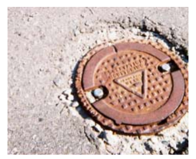
Monitoring well cap

Ground water is monitored to ensure contaminates are not entering the groundwater.