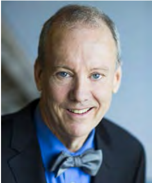
William McDonough - Designer & Sustainability Pioneer