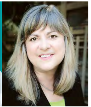
Cinda Chavich - Author, The Waste Not, Want Not Cookbook