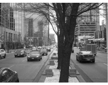
The future of the landscaped median