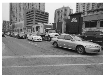
Re-configuring right-of-way and traffic lanes