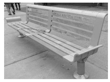
Adding street trees, lighting, and street furniture

The following opportunities will be discussed at the Design Charrette: