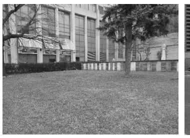
Integrating adjacent parks and public open spaces