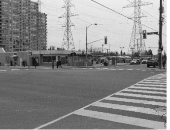
Improving pedestrian crossing facilities