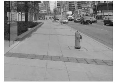
Enhancing sidewalks and boulevard widths